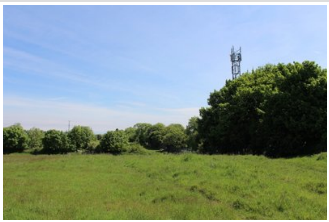
Mobile Phone Mast