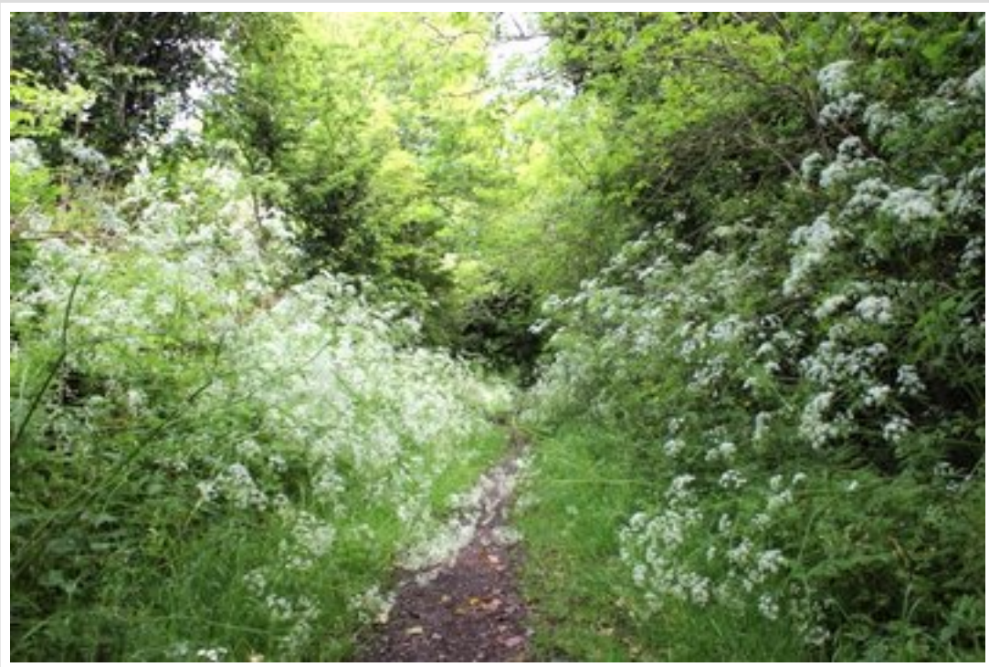
Lonan Path with cow parsley

I started at a long "lonan" (lane) that hasn't changed in years. There is a quarry at one area near the top of the lane, which is quite deep. Peregrine falcons nest on the exposed rocky faces as well as ravens. When I have been here the past few years, I usually went to the other side of the area, which is at the woodland side, so have not seen this side since about 2006, it was nice seeing it again.