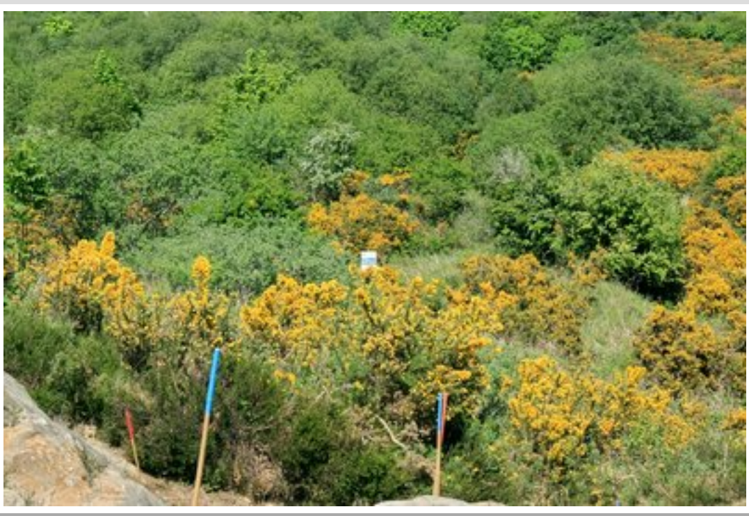
Rocky Scrub Woodland

So I walked down the steep slopes and found a burnt out car (sad to say it wasn't the only bit of mangled car remains here) and found the large meadow, but to get to it, I had to walk over the twisted remains of a bonnet and front of a burnt out car buried in the sandy bank. I was at another flower grassland meadow.