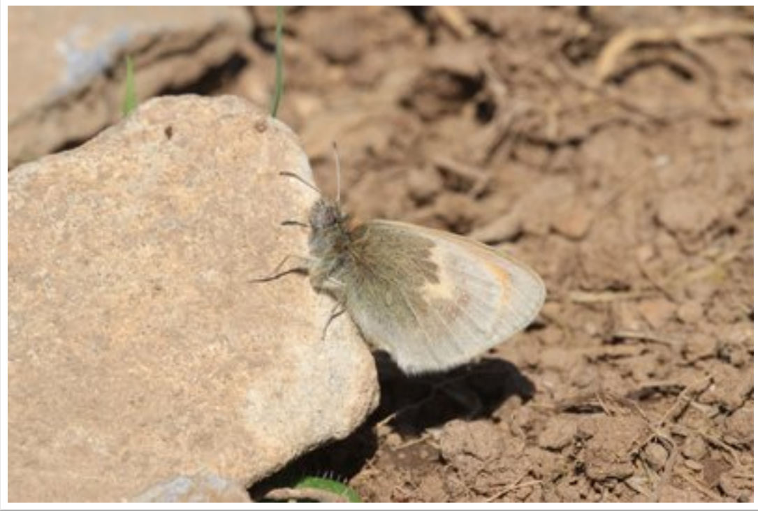
Small Heath 4

However, one side had a large area of gorse that was burned and earlier that morning before I came here, firefighters had to put out the blaze but it was quite bad. There was also some broom growing around here.