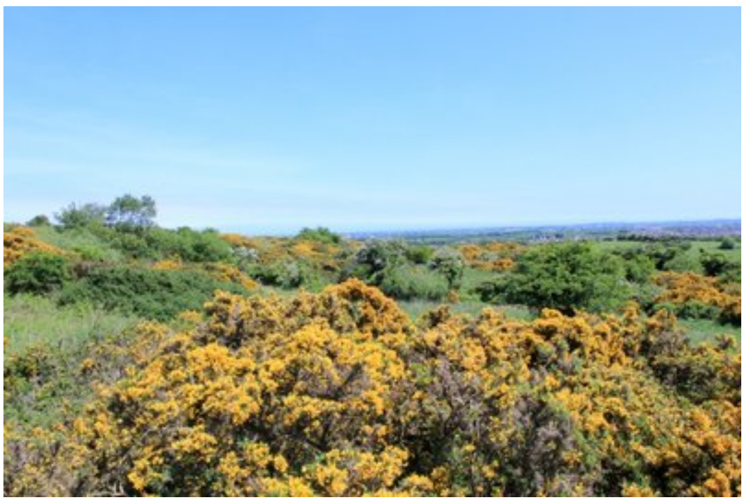
Flower Meadow 3 - 2