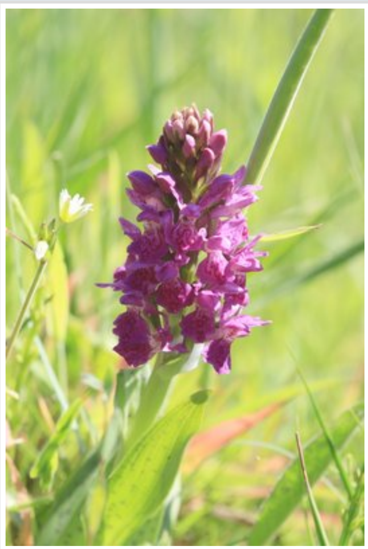
Common Spotted Orchid

Before leaving here to head home, I found 4 Common Spotted Orchid hybrids Dactylorhiza fuchsii x purpurella (D. x venusta) and got a few photos.