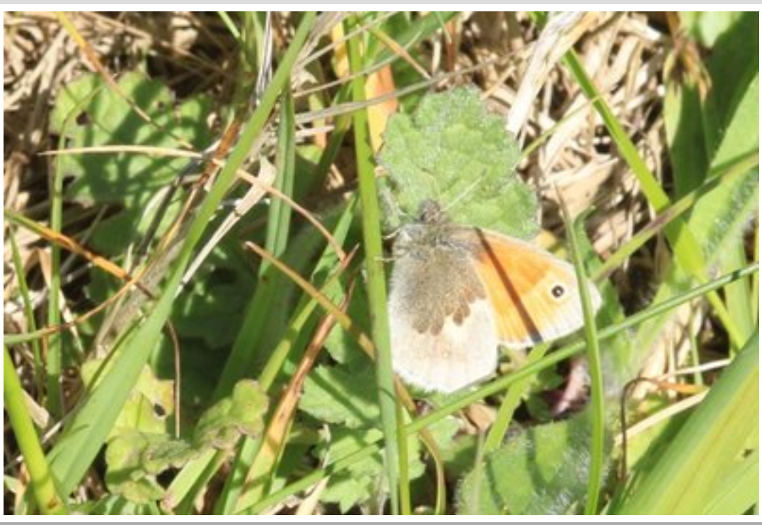
Small Heath Sunning Itself