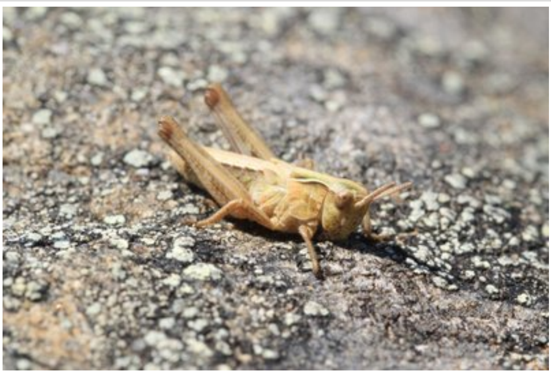
Young Field Grasshopper

After looking around and trying to find a way out that wasn't the way I came in, I realized I had to go through the burned gorse, so went through them. Lots of bracken growing here. Saw another large red damselfly, 7 Small Heath and a female Speckled Wood Kept going past a few areas: