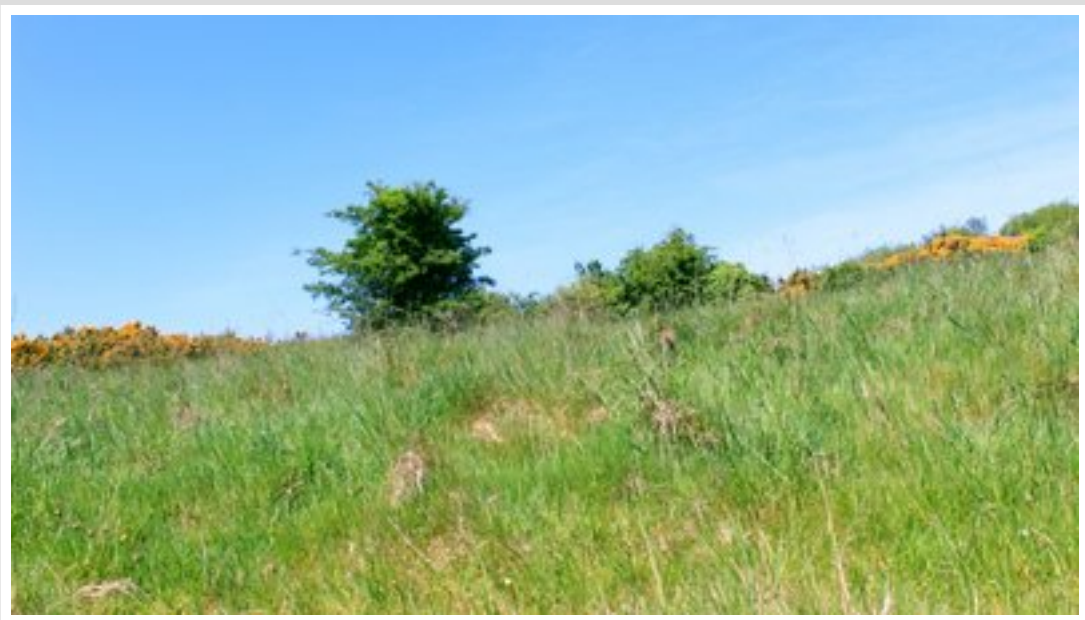
2 Acre Flower Meadow

However, one side had a large area of gorse that was burned and earlier that morning before I came here, firefighters had to put out the blaze but it was quite bad. There was also some broom growing around here.