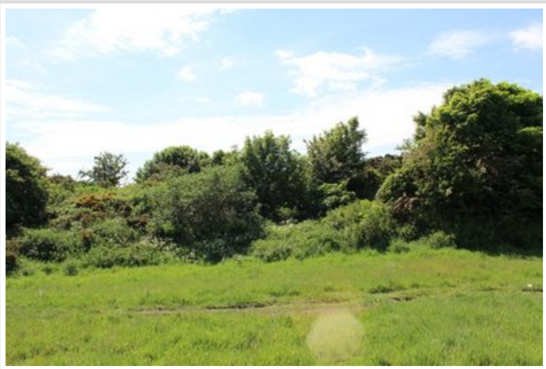
Trees and Hedgrow

Next, I went back the way I came and followed a path into a short grassland area with wildflowers and some gorse. I then saw a butterfly. I really wished I had a photo of it as it was unusual, but flew too fast to catch. It was the shape and size of a large white but was light brown (like a small heath) on its upperside with no other markings. Didn't see its underside, so unsure what it was. Couldn't have been a large heath as they don't exist here with no cotton grass, so no idea what it was. Managed to see a Small Heath here and got a photo, not great though. Not had much luck photographing these so far.