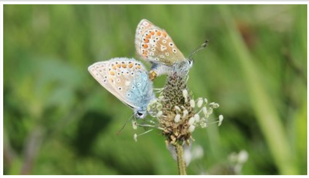
Common Blue Pair Again

Before leaving here to head home, I found 4 Common Spotted Orchid hybrids Dactylorhiza fuchsii x purpurella (D. x venusta) and got a few photos.