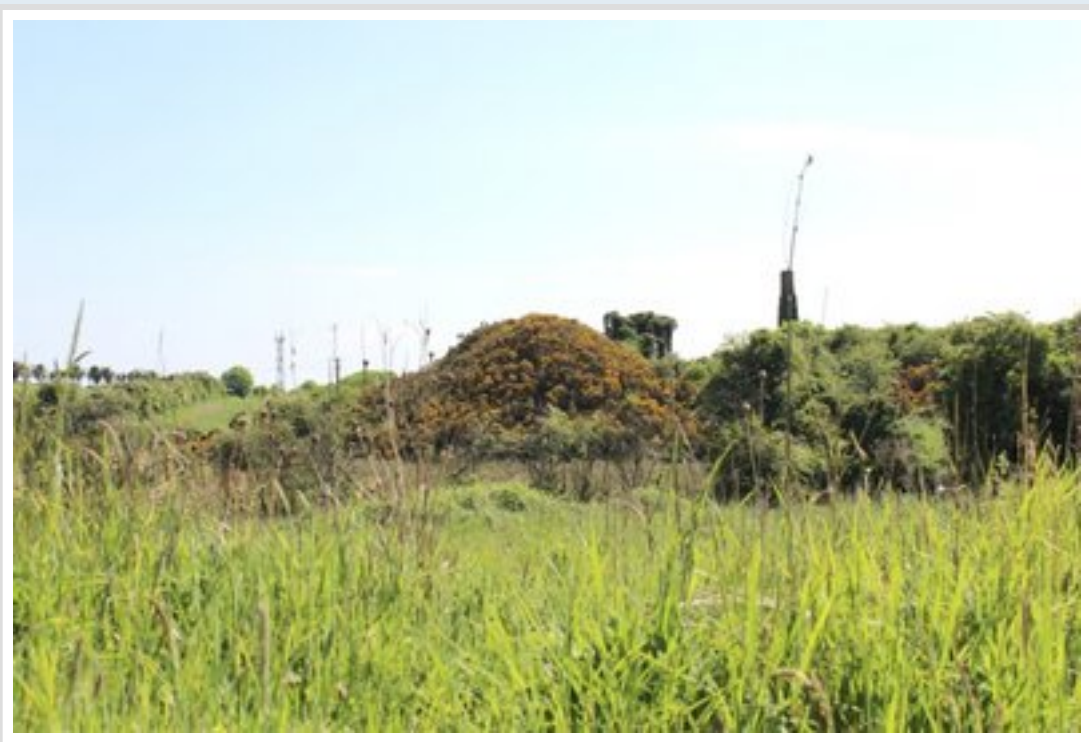
Flower Meadow (Mine in distance)

In distance you can see a hill with gorse and a chimney, these were part of the old mine that is disused, at times you can see red deer here that come out of the woodland nearby: