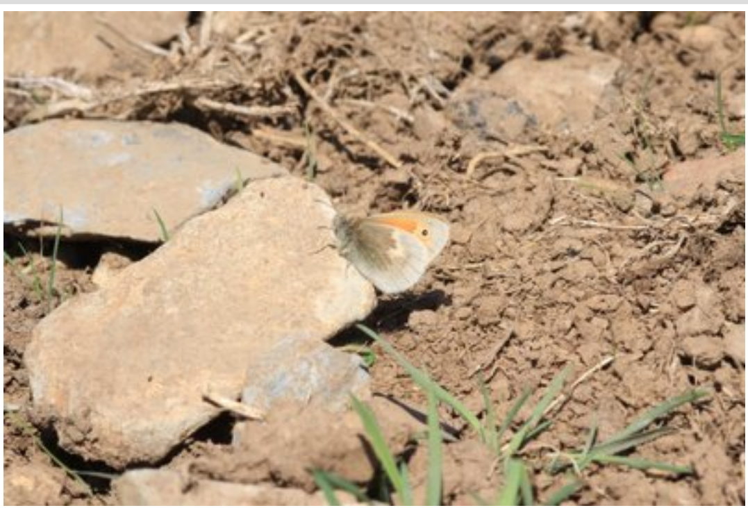
Small Heath 1

It was now about 1:30pm, so after stopping for a rest, heard some long-tailed tits and saw them in the hawthorn nearby where I was sitting, continued higher up (now at 400ft above sea level) and walked over a stone wall and found a 2 acre or so flower meadow. Here I saw my first Common Blue of the year, a male, only got a slightly blurred photo though. Also saw 11 Small Heath as well. One seemed more willing, so took a few photos of it, slowly getting closer each time to see how far I could get to it before it flew away. Took 4 photos then it bolted. Came out alright.