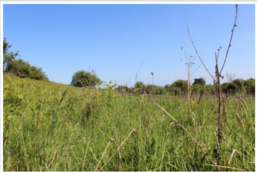
Last area meadow