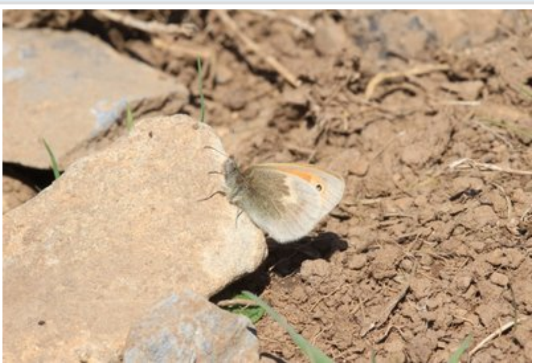
Small Heath 2