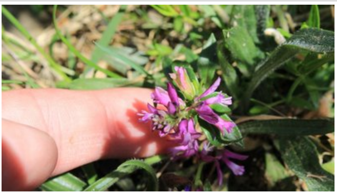
Common Milkwort (Pink Form)

I then was looking around and saw several Common Milkwort ( Polygala vulgaris ) with pink and purple-blue forms growing side-by-side, the first time I have seen the pink form before.