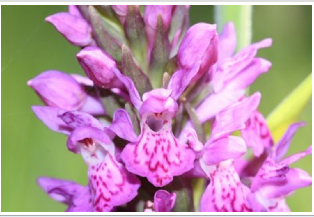
Common Spotted Orchid 2

Left at 4:30pm and overall walked near 10 miles. On way home, just before leaving here, saw a male Orange-Tip . Woke up this morning feeling a bit cramped and sore with a sunburned back of my head, but worth it though.