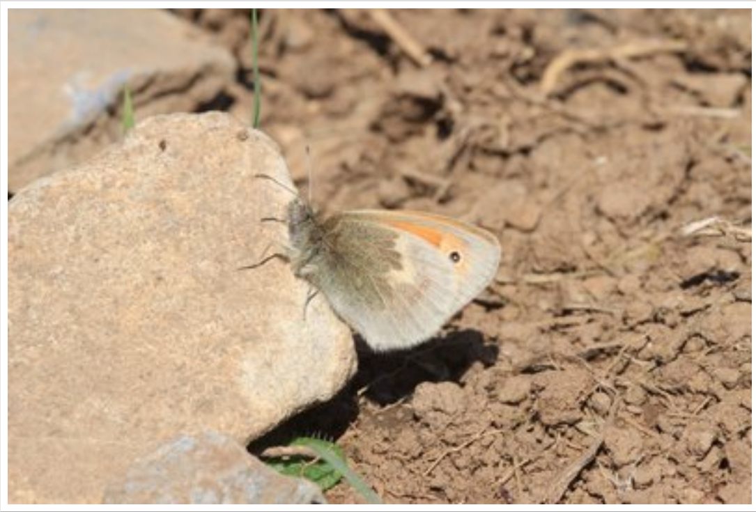
Small Heath 3