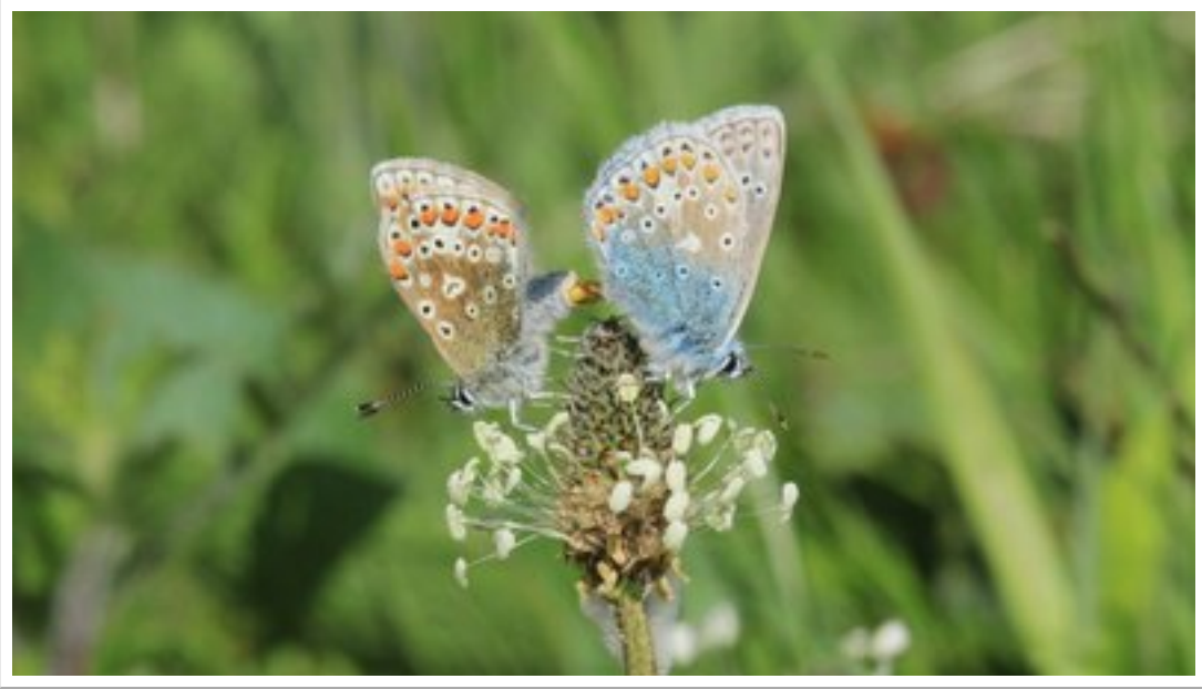
Common Blue Pair

Got a good couple of photos of the mating common blue. They did the "lovers waltz" walking side ways around the plantian head as they, mated: