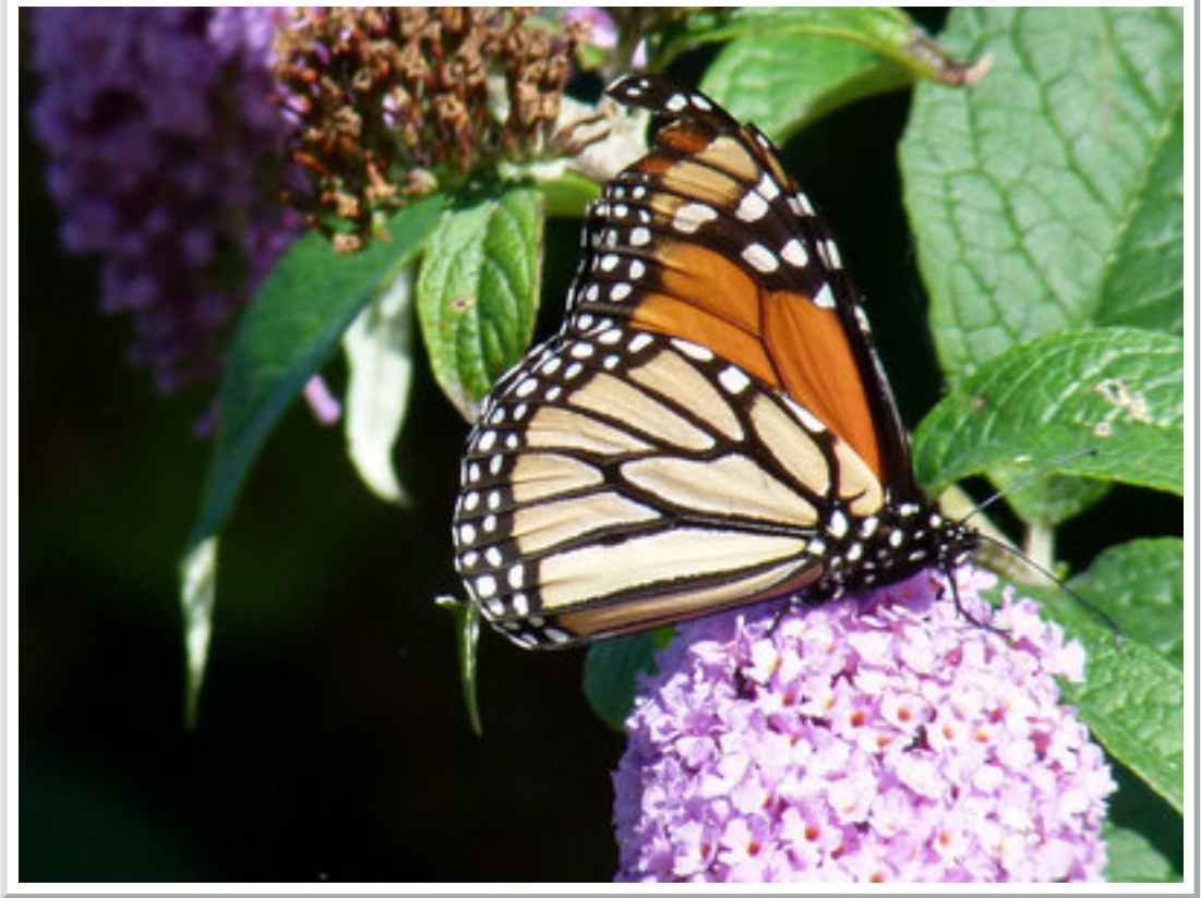
Monarch Butterfly at Easton (Portland).

a constant passage of Swallows, otherwise things were fairly quiet. We then returned to Lodmoor early afternoon to find the Short Billed Dowitcher showing right in the open and only 5 other people present. A mega rarity (admittedly present for 10 days or so) and only 8 of us in total present on a Saturday afternoon. Despite the crowds in Weymouth and Portland (there appeared to be many things on) we had a fantastic day out.