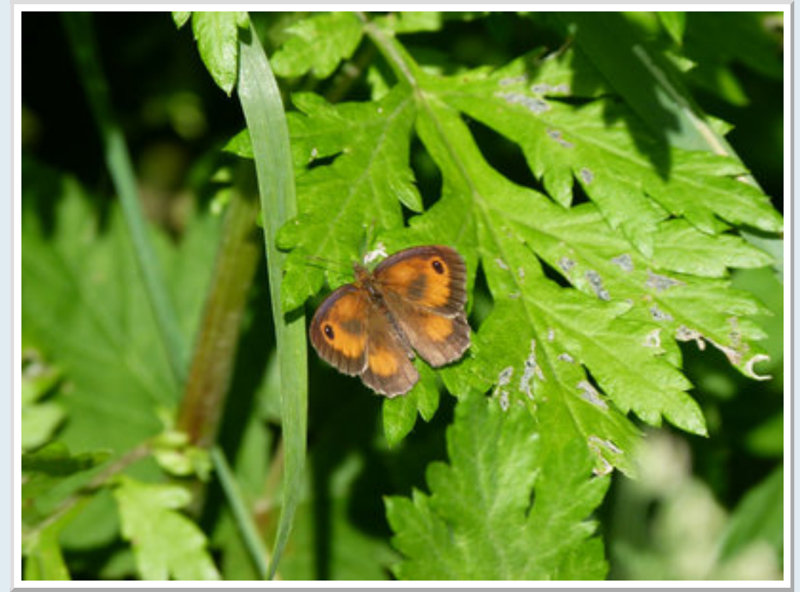
Gatekeeper at Hamstreet.

I THINK THE MARDIED WHITE IS A DELIGHTFUL butterfly.