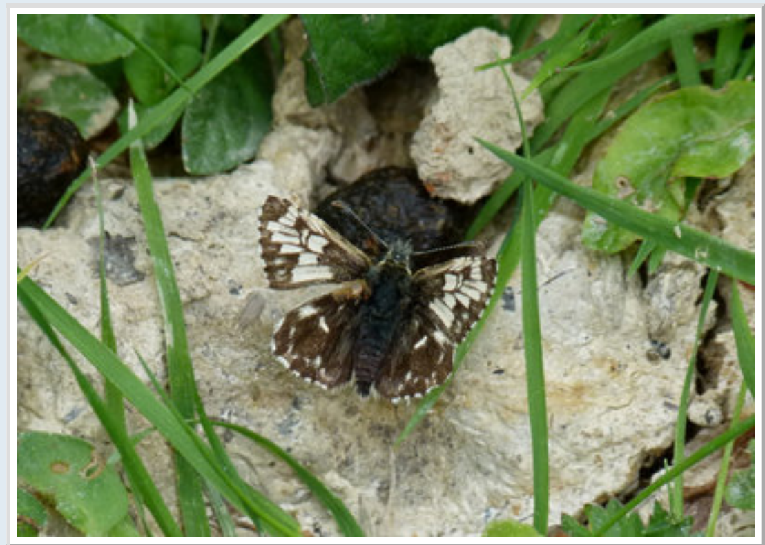
Grizzled Skipper at Beckley Wood (East Sussex).

We had run the moth trap overnight and although there was only 9 species, one was a real goodie for us. It was White Point and obviously our first garden record. Twenty years ago this was only known as a migrant, and then only from the south coast. Over the last few years it has been suspected of breeding along the coast and the fact that a friend trapping at Hamstreet caught 5 fresh ones the following night seems to confirm this theory.