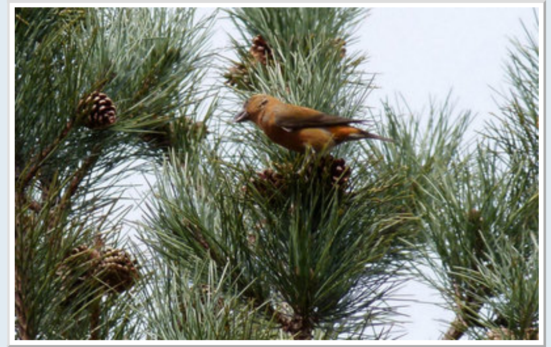
One of the bright male Common Crossbills seen in Hamstreet Woods.