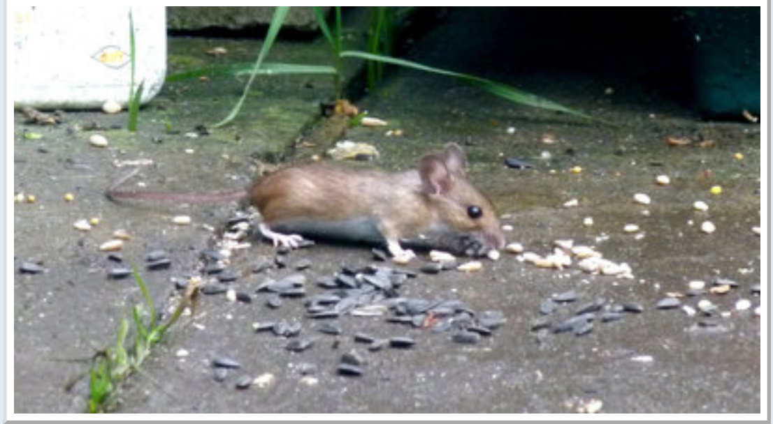
Wood Mouse? Trying to survive in a Cat filled environment.