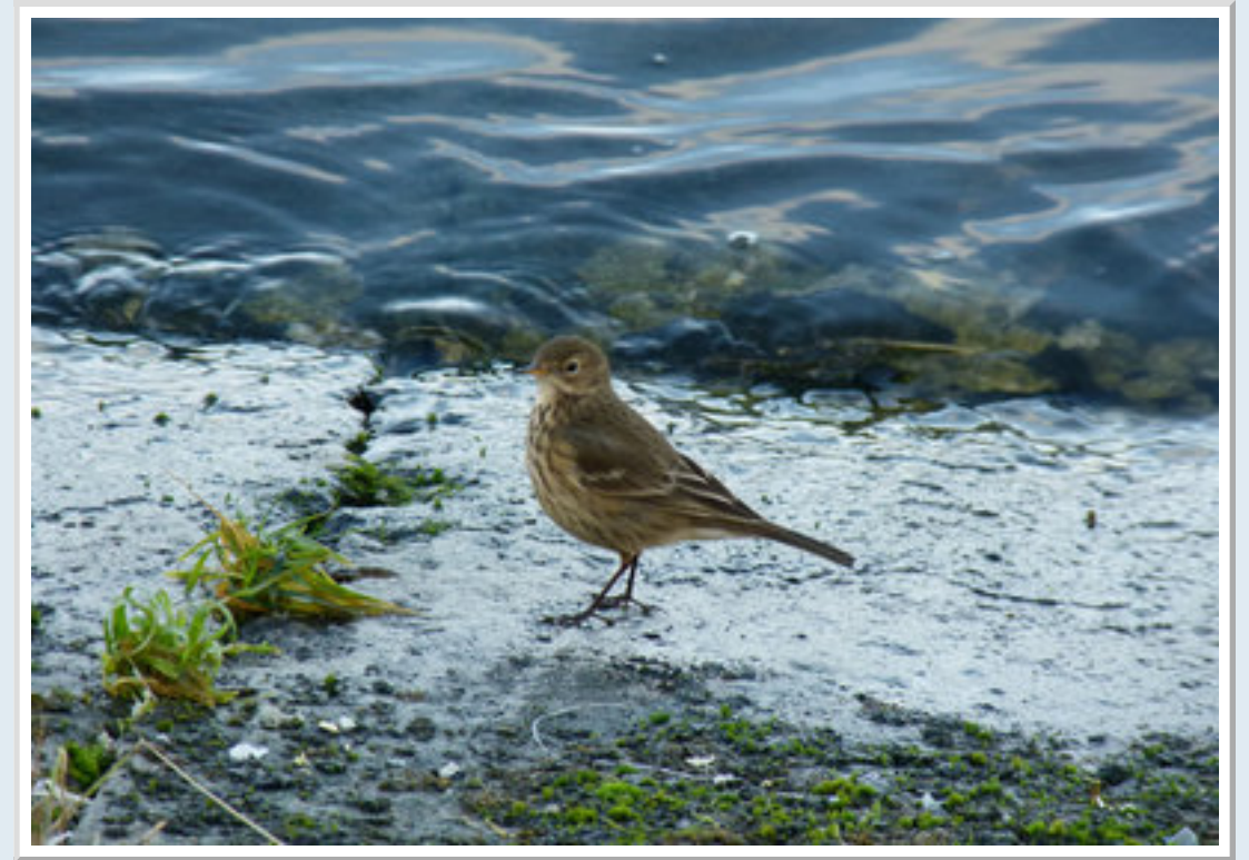
Buff-bellied Pipit at the Queen Mother Reservoir.