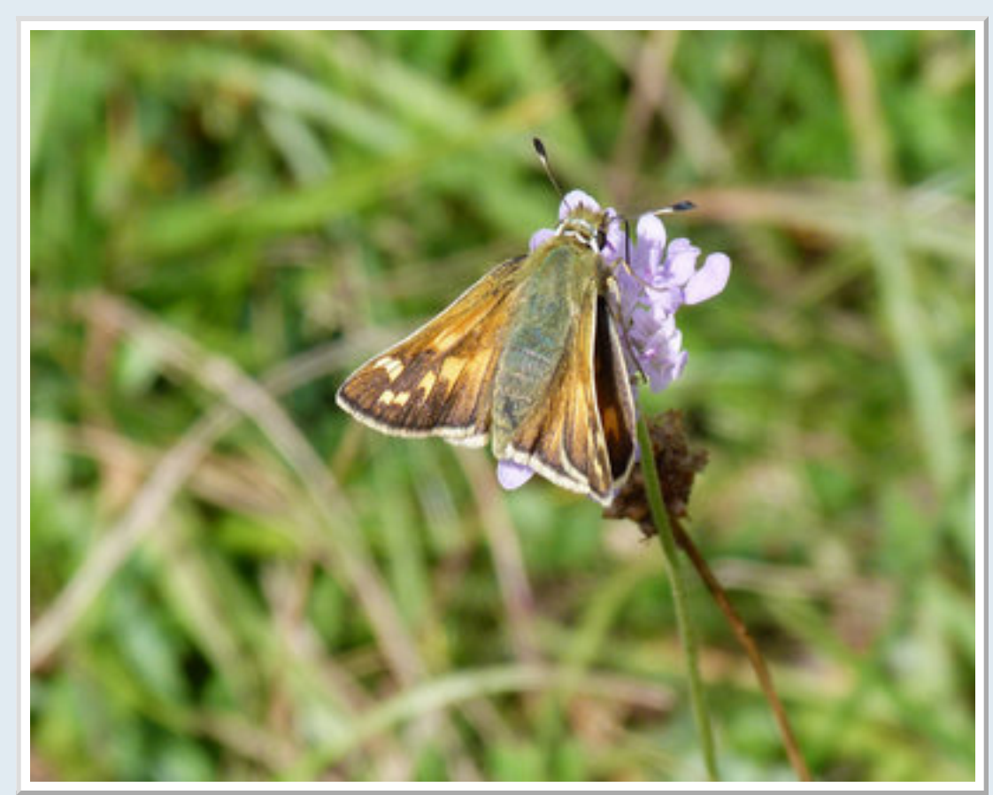
Silver Spotted Skipper in the first field at Lydden NR.