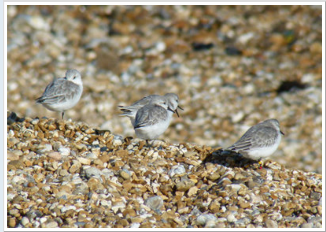
Part of a flock of Sanderling on Littlestone Beach.