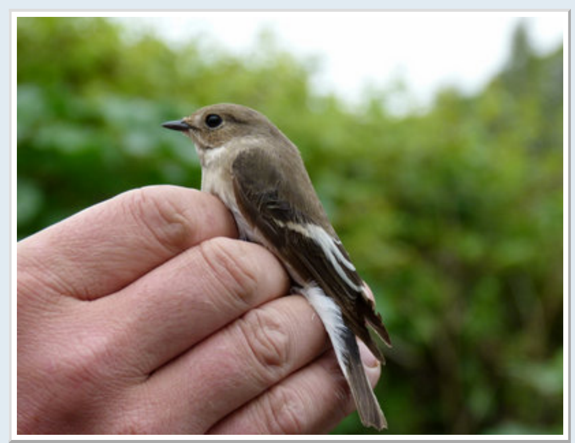
Pied Flycatcher trapped at Dungeness