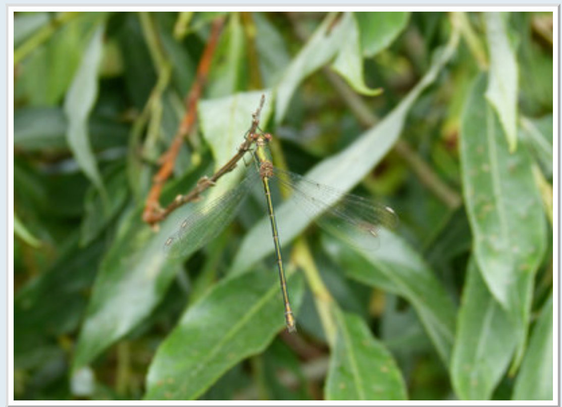
Willow Emerald Damselfly on Chislet Marsh.