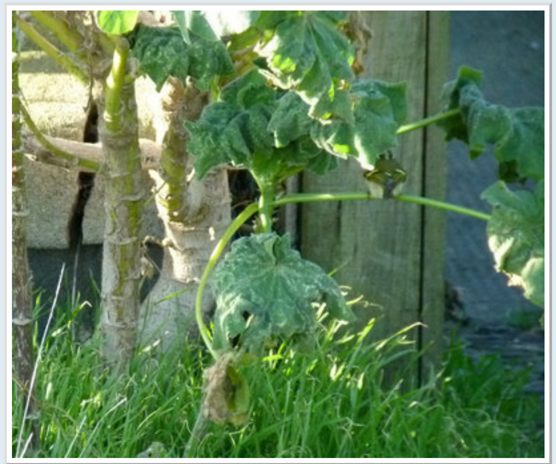
Record photo of the Pallas's Warbler at Dungeness. Difficult to photo as mobile, poor light and rubbish photographer. It does show the central crown stripe.