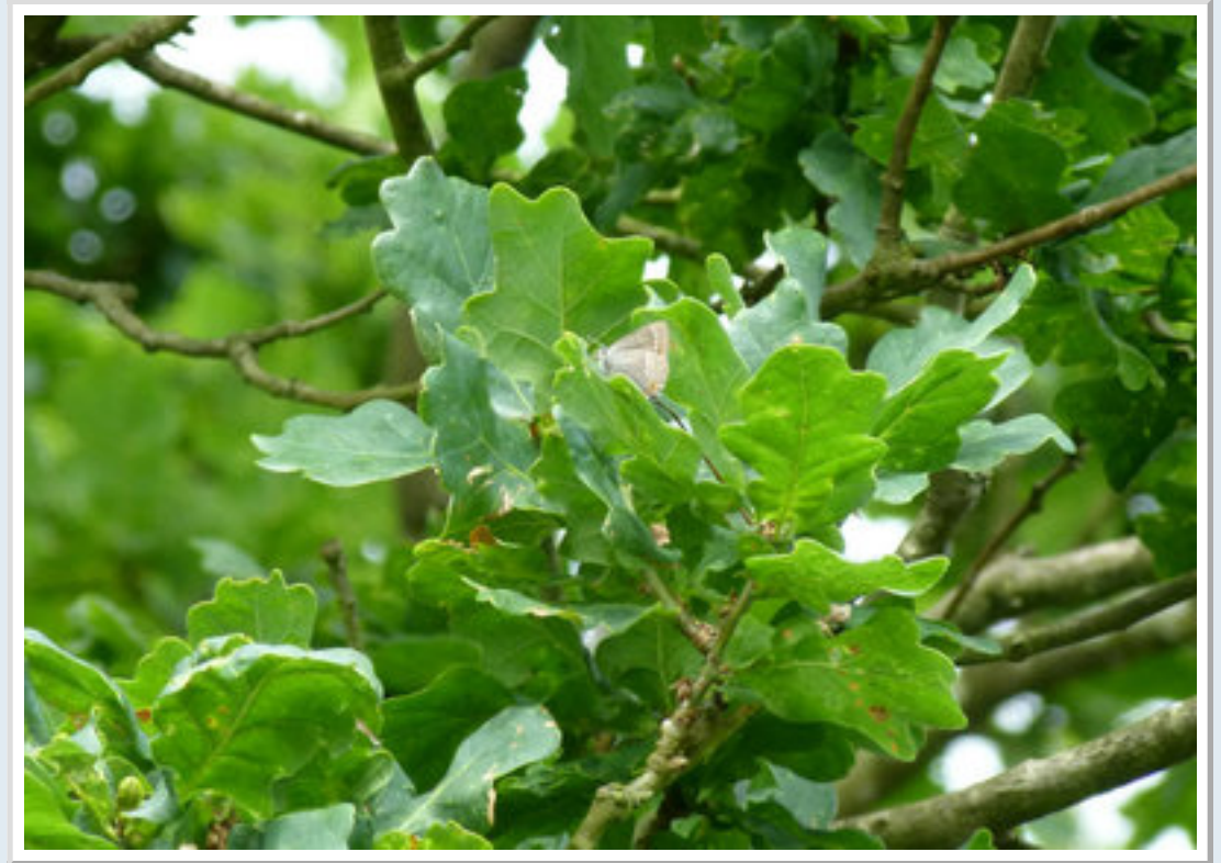
One of the 17 seen at Hamstreet. This one came down the lowest but was still quite high up.