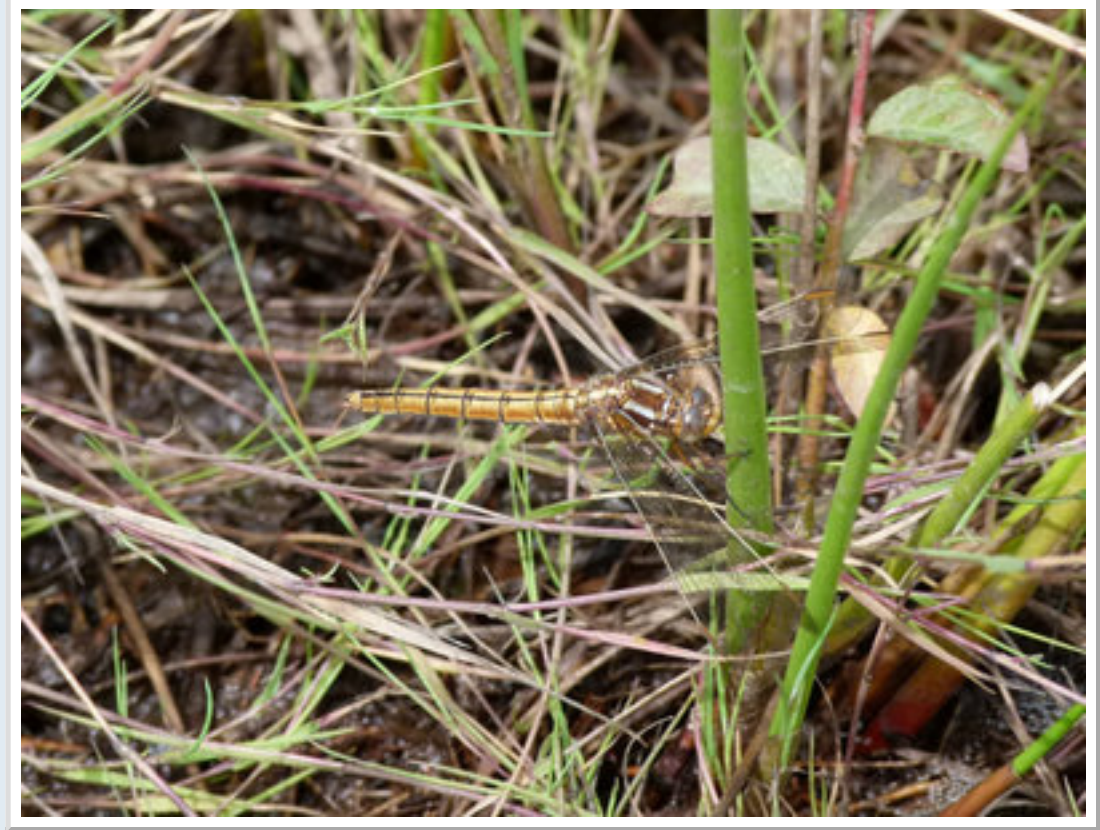
Female Keeled Skimmer at Hothfield. This individual was seen to egg lay.