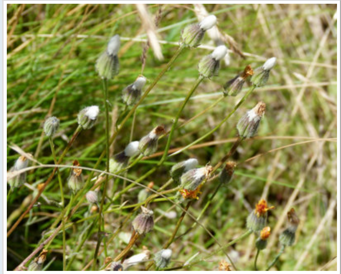
This group of Stinking Hawksbeard had closed up for the day time we arrived early pm.