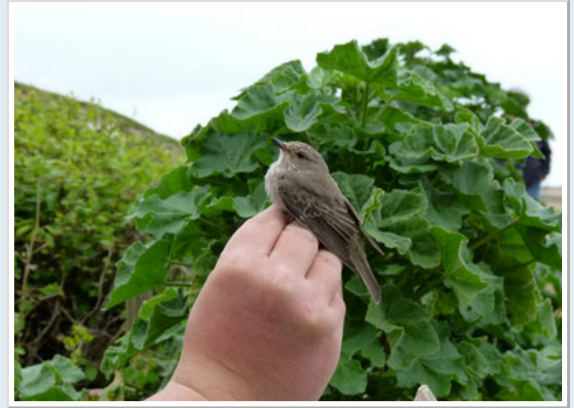
Spotted Flycatcher trapped at Dungeness