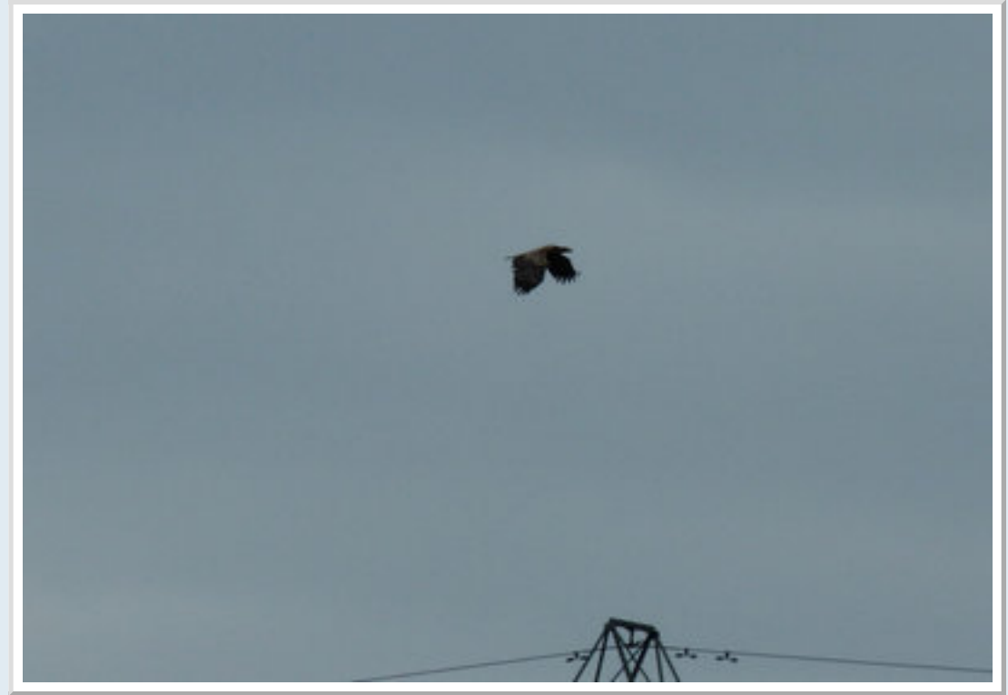
2nd Winter WHITE TAILED SEA EAGLE near Walland Marsh.