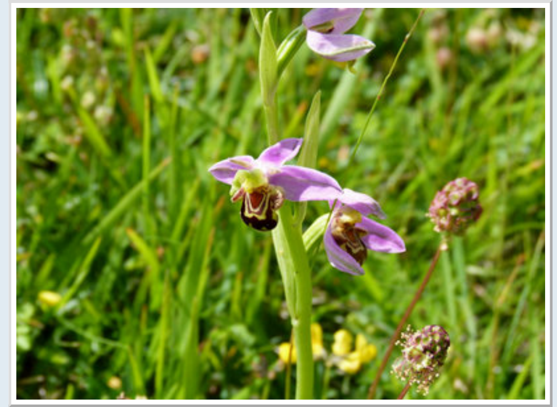
Bee Orchid at Castle Hill Folkestone