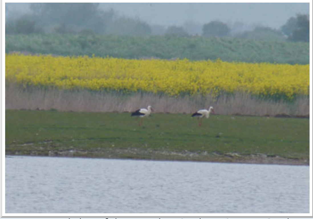
Distant record shot of the two White Storks at Scotney Gravl Pits. Both unringed and fully winged.