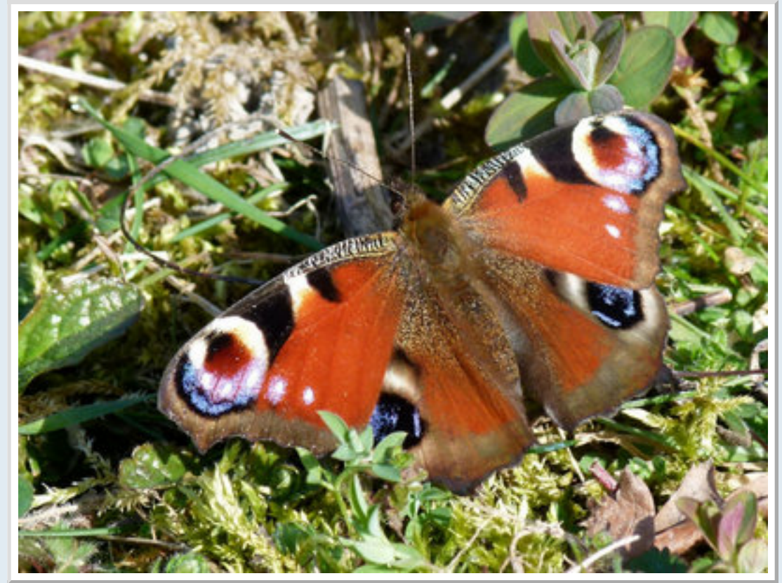
Not my best photo of a peacock, just so nice to see one after the long winter months.