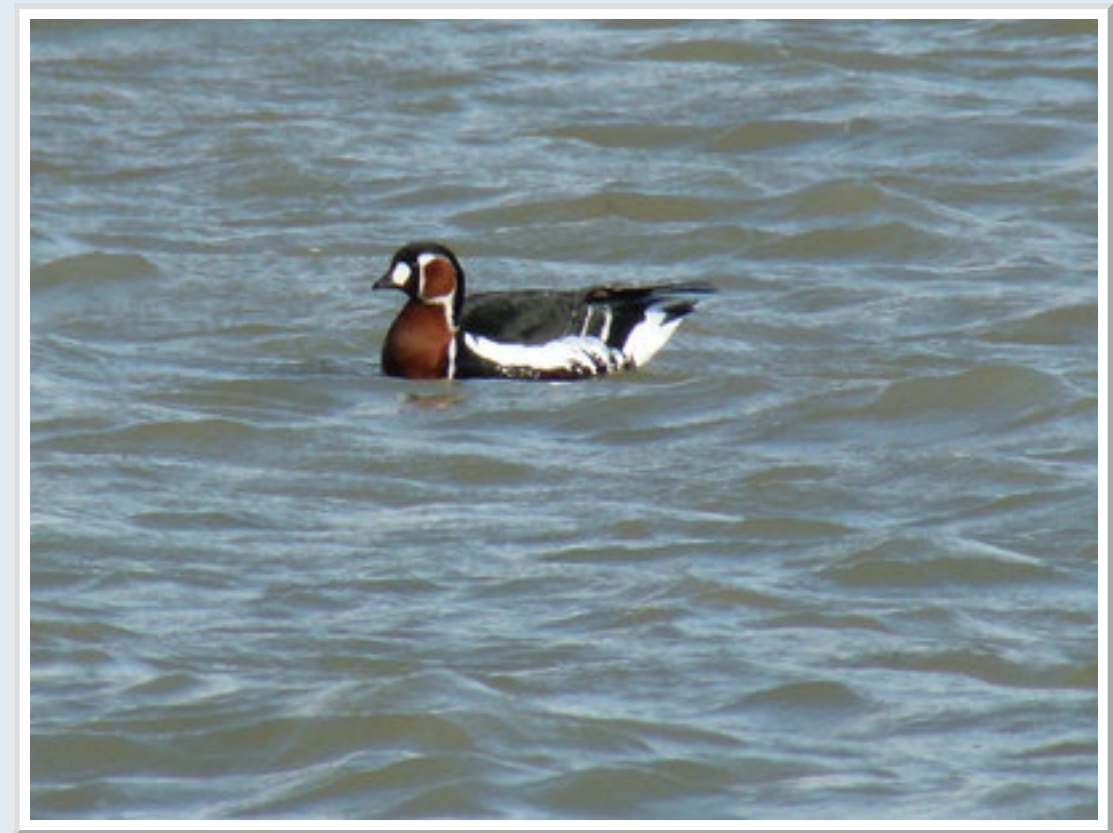
Red Breasted Goose at the West end of Seasalter.