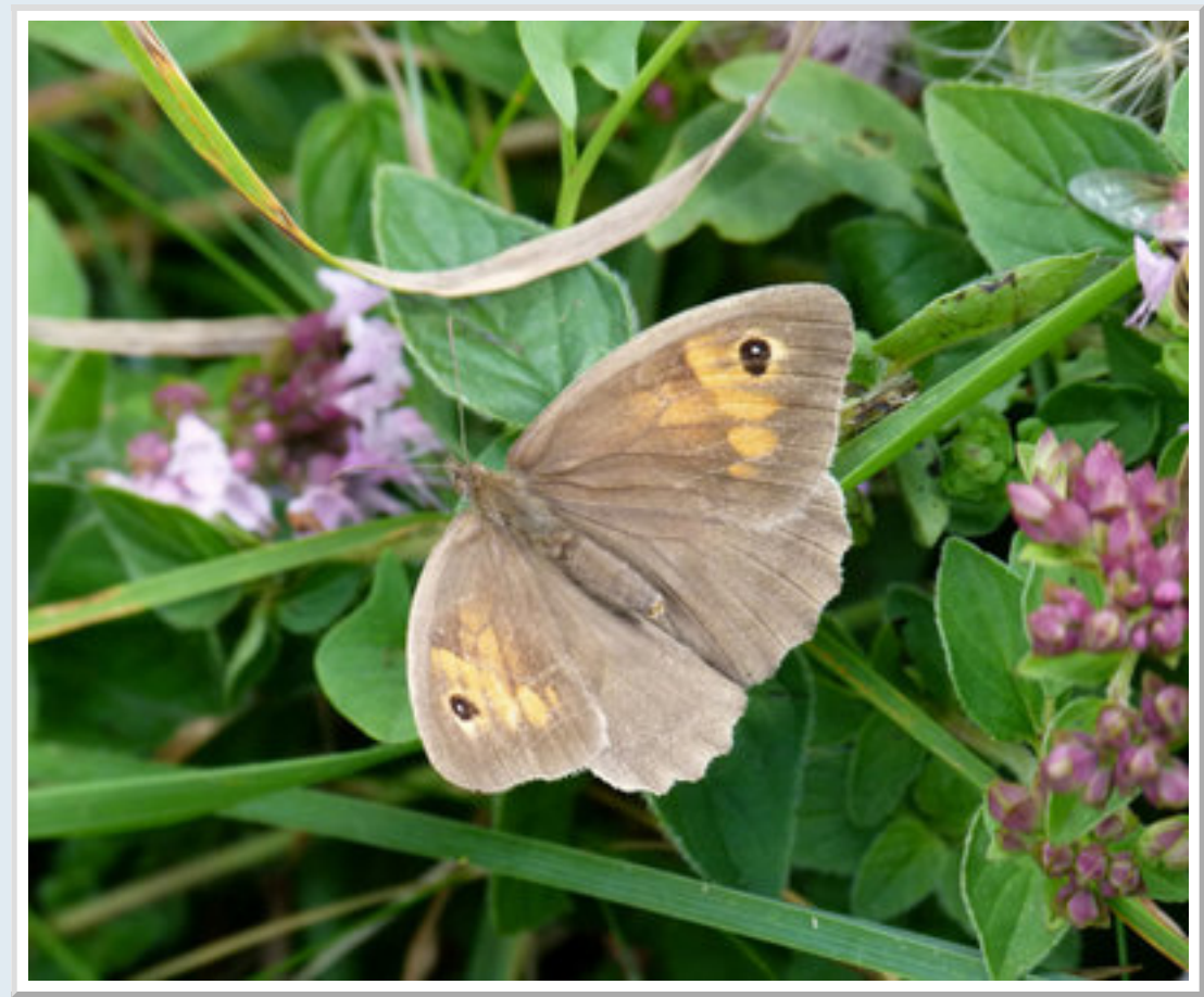
Many Meadow Brown still on the wing.