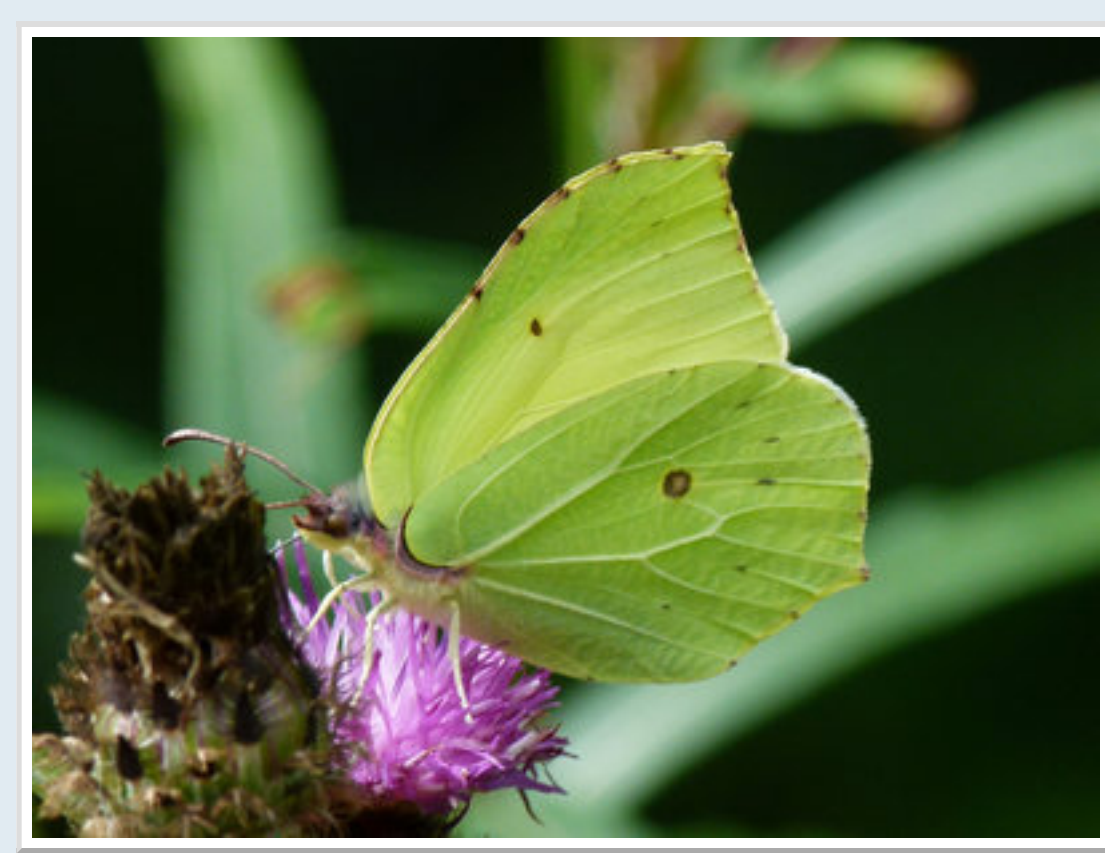
Brimstone in Hamstreet Woods.

A very faded Tree Lichen Beauty is well hidden against on a tree trunk. The moth should be a lot greenier.