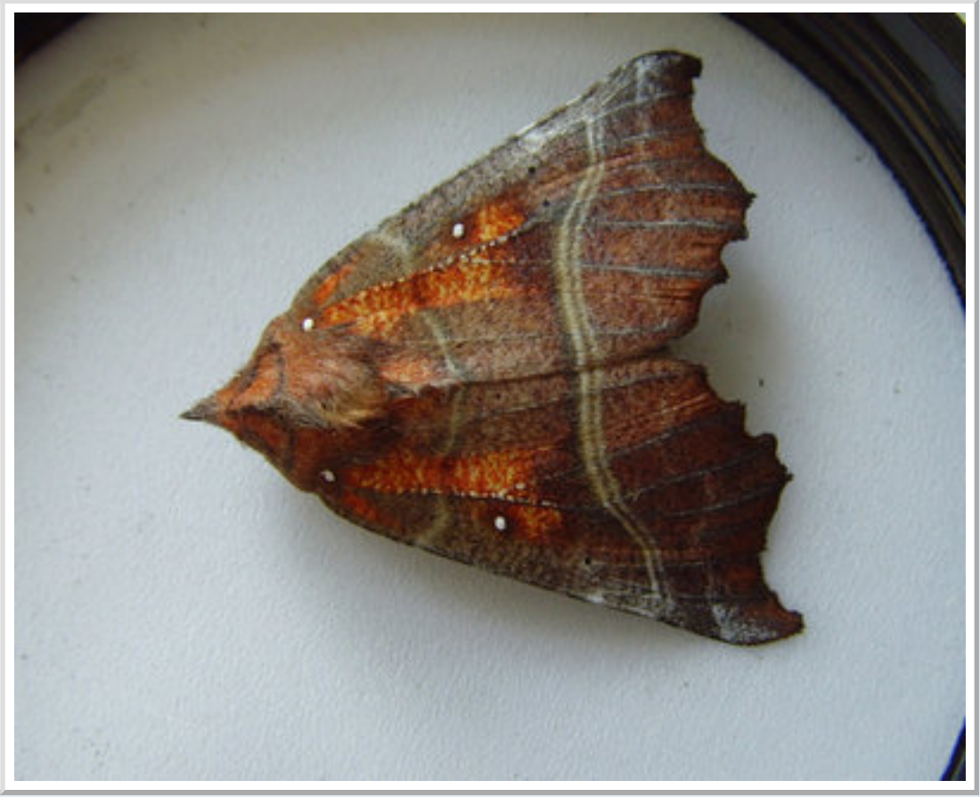
This Herald moth was a nice garden surprise.