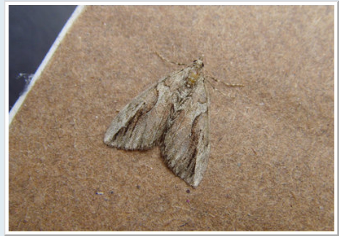
A slightly worn Cypress Carpet at Hamstreet