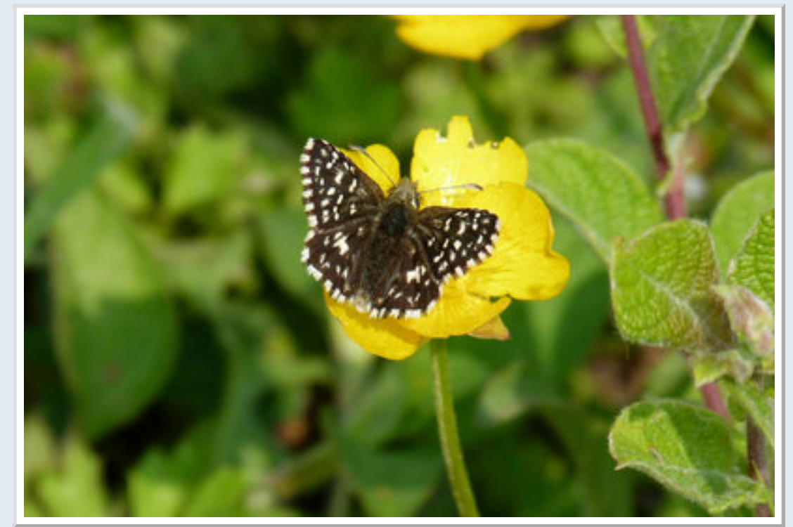
Grizzled Skipper at Hamstreet (Faggs Wood)