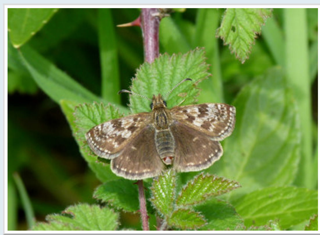
Dingy Skipper at Wye NR.

A much better morning although the cloud and cold returned after mid-day. We visited Wye NR again and this time we had reasonable numbers of butterflies. 7 Dingy Skipper, 4 Wall Bronws, 1 Small Copper, 1 Green Hairstreak, a Treble Bar moth, 5 Early Purple Orchids and a good number of Cowslips. A much more enjoyable day all round.