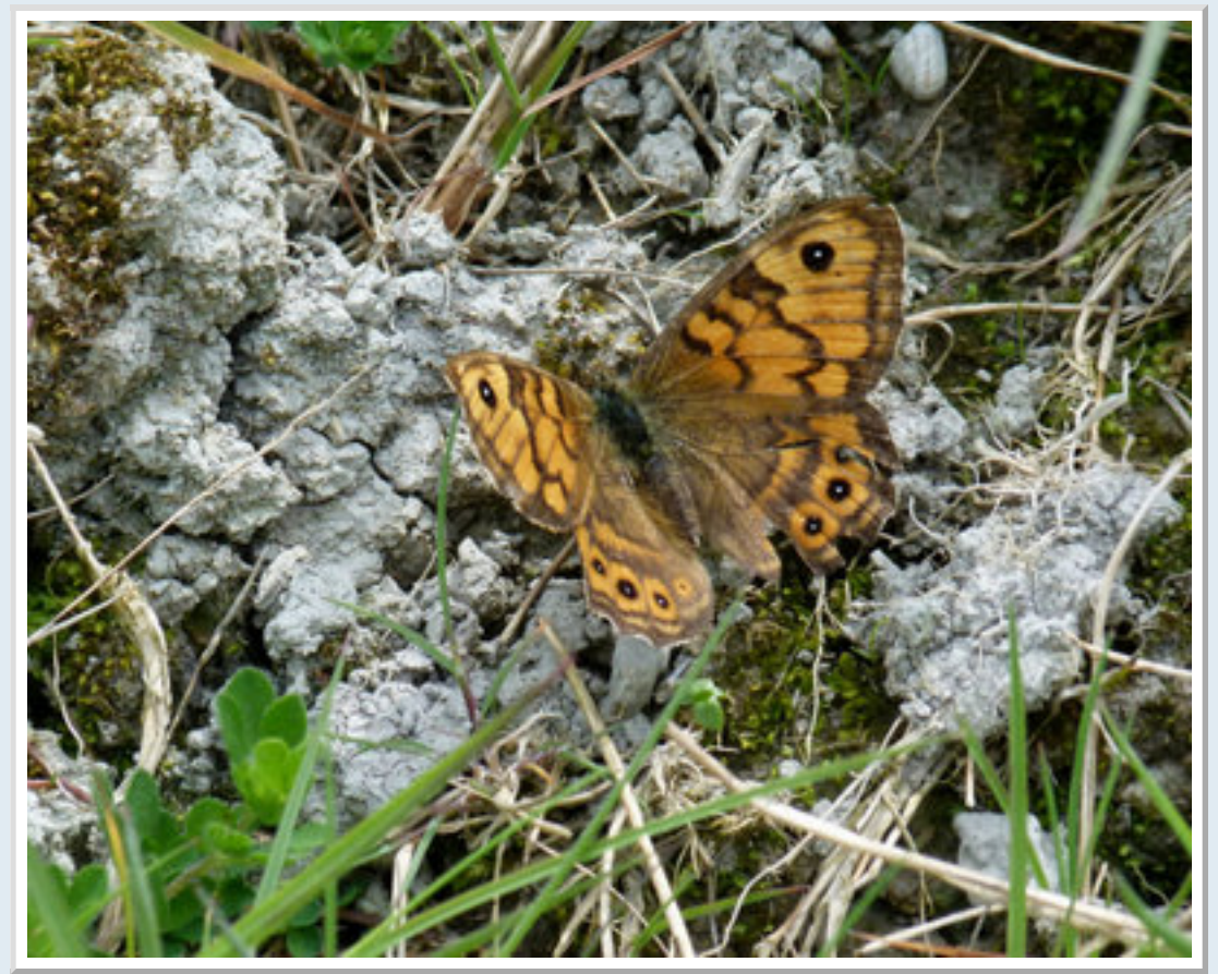
Wall Brown at Samphire Hoe.