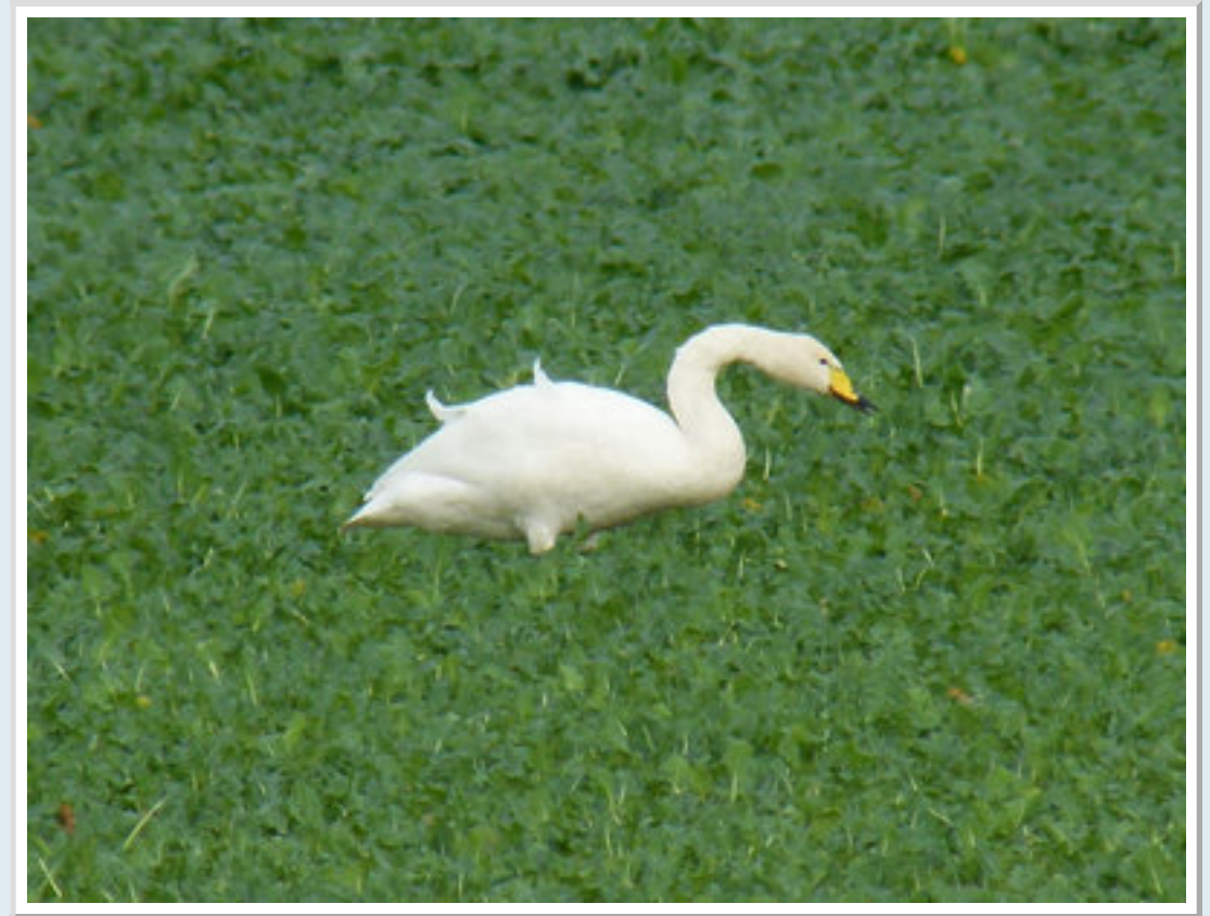
One of two Whooper Swans present near Midley Cottages on Walland Marsh.