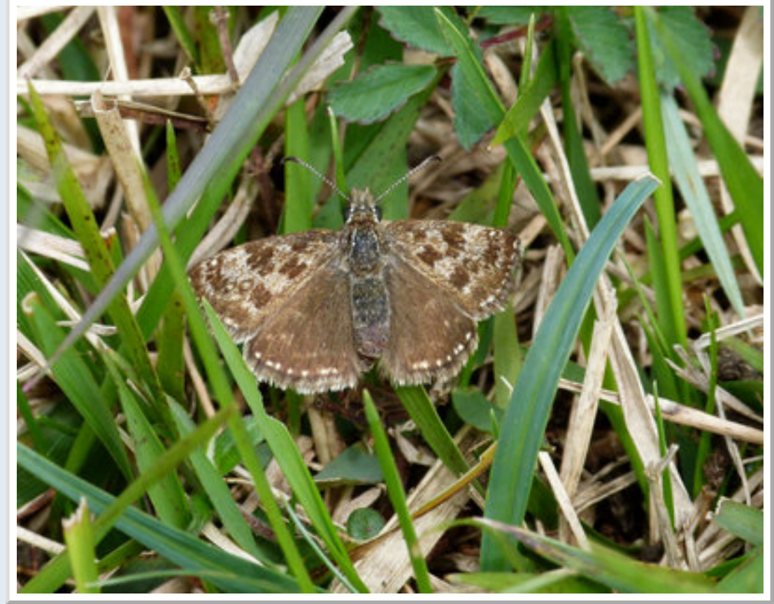
Dingy Skipper at WYE NNR