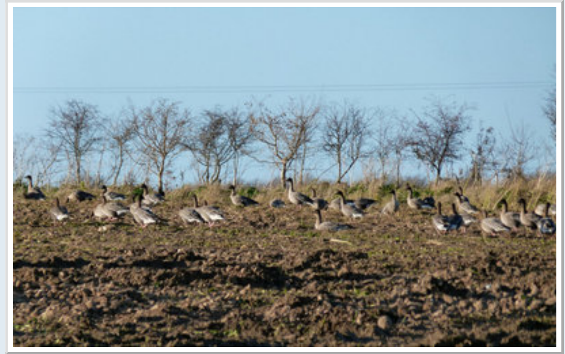
Part of one of the flocks of Pink Footed Geese near Cley, Norfolk