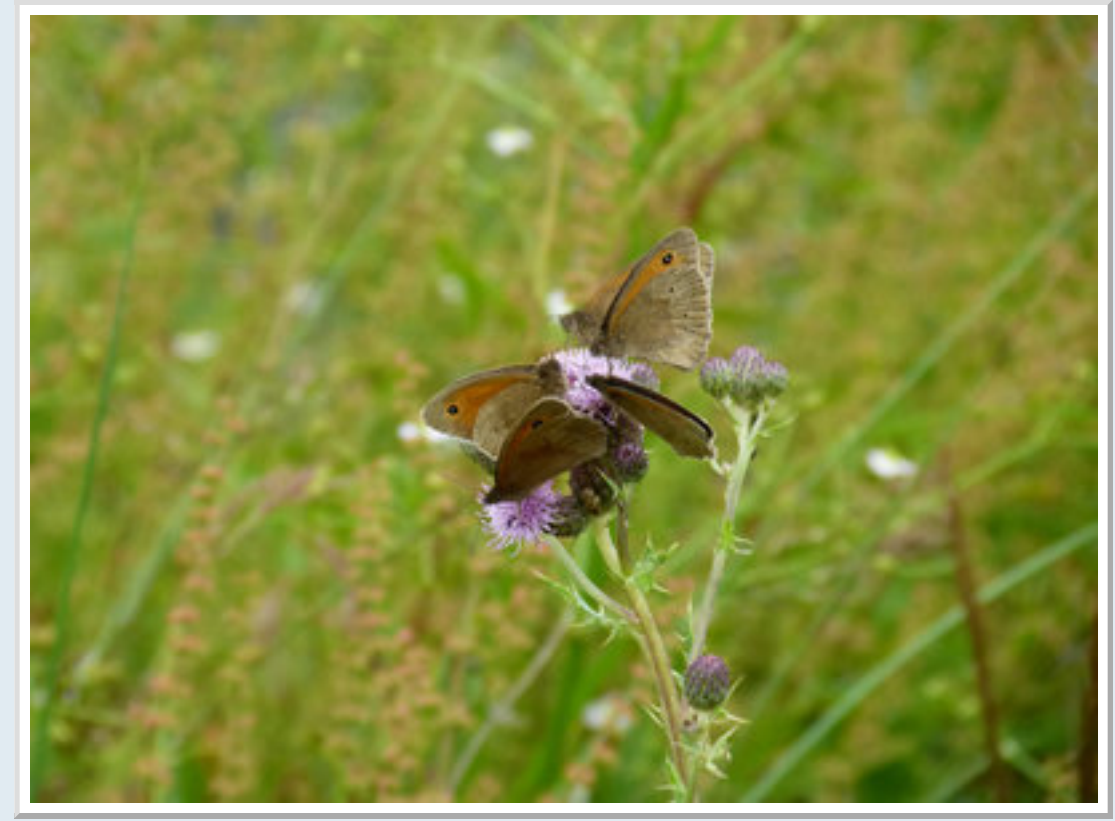
Just how many can you get on one plant?