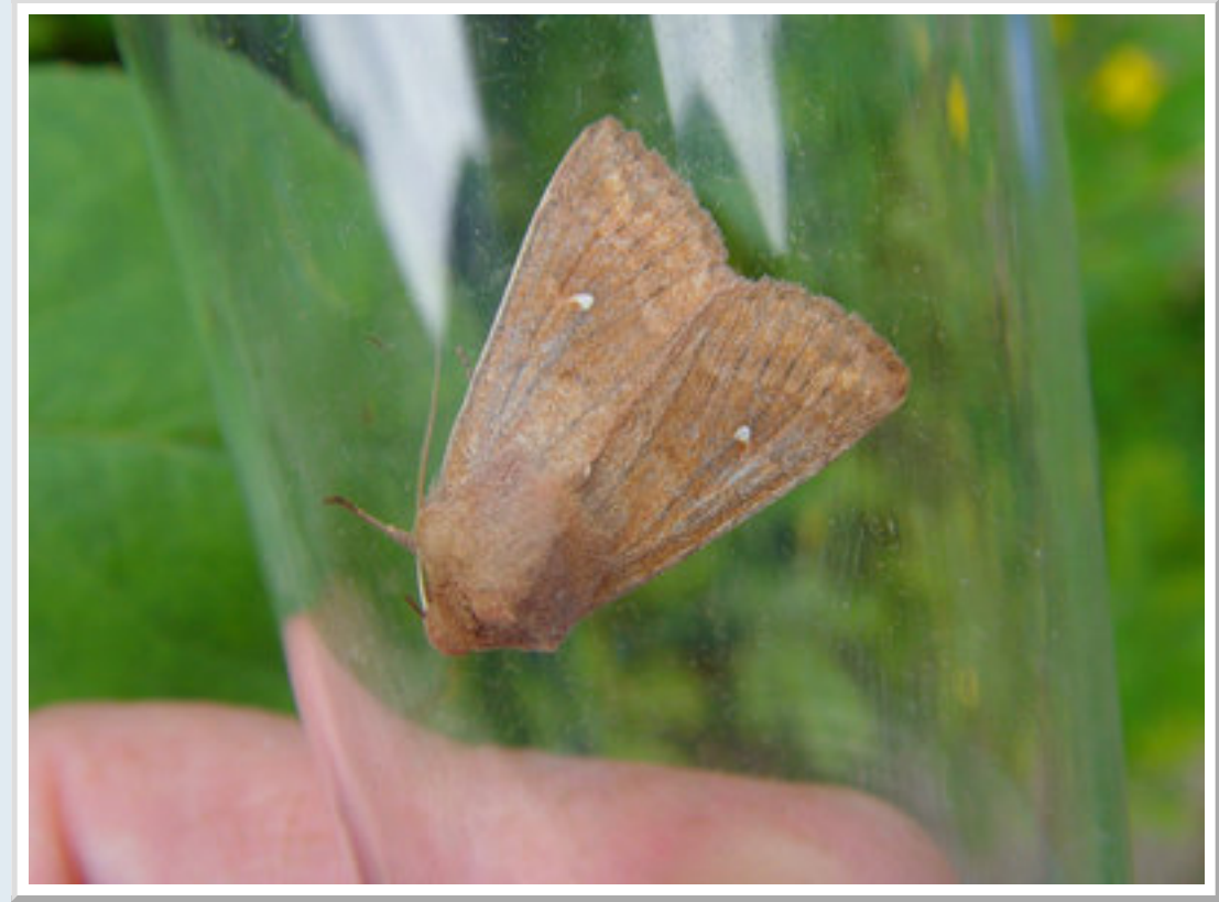
White Point moth in our garden moth trap.