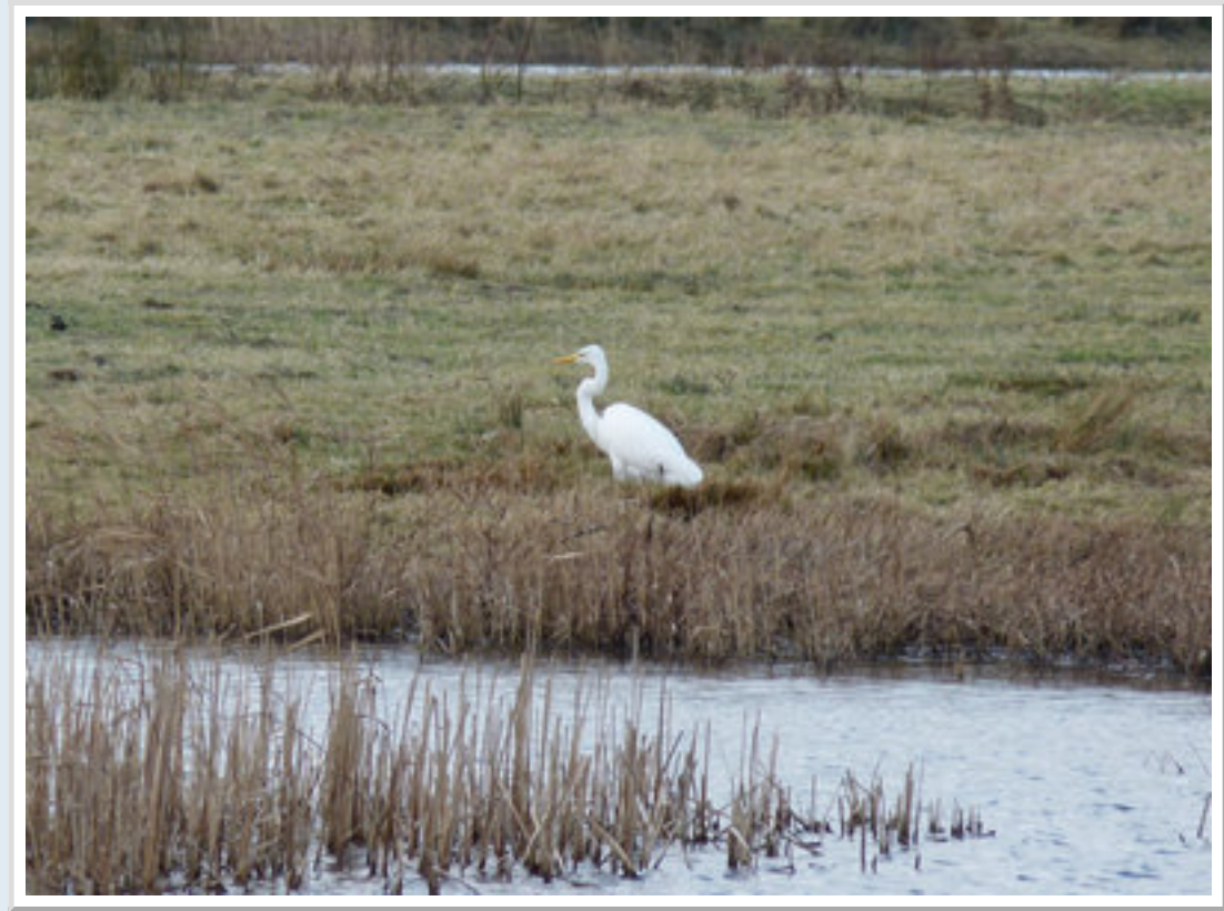
The regular Dungeness Great White Egret