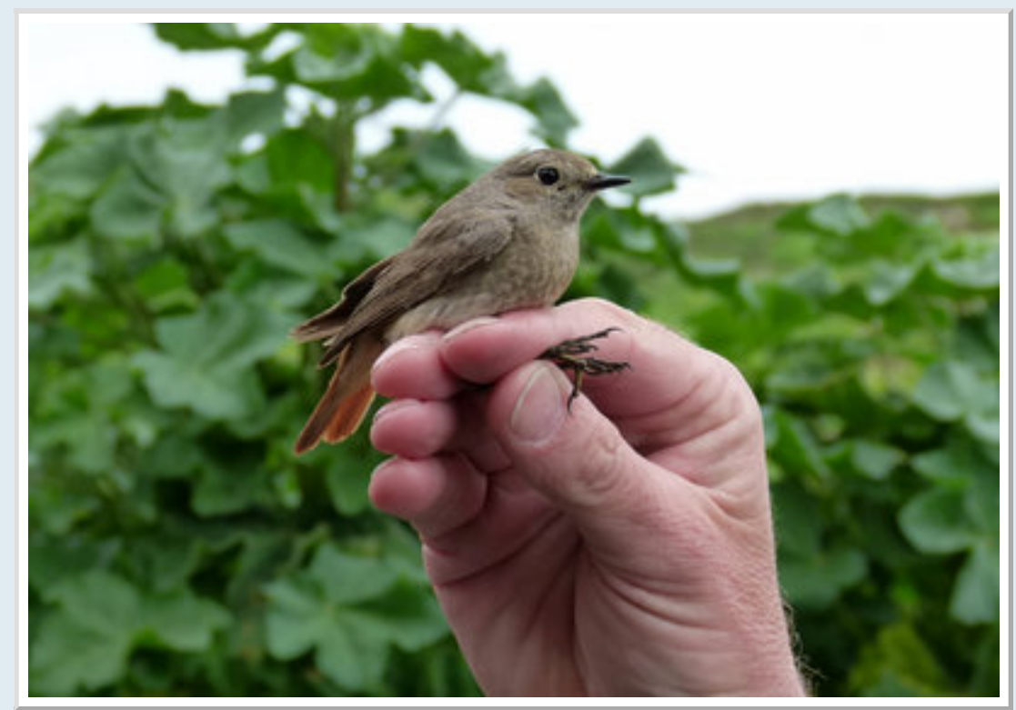
This female Redstart was one of several seen during the day.