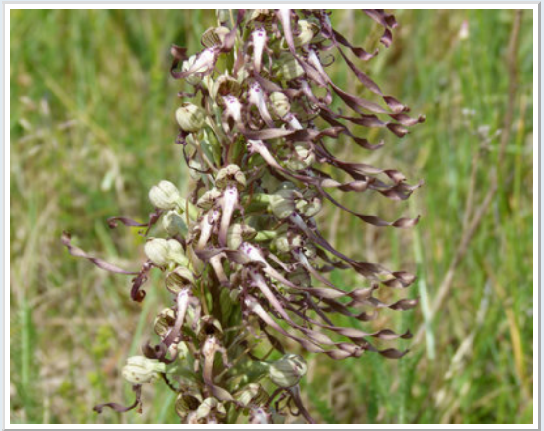
Lizard Orchid Sandwich Bay

This was a really enjoyable day out at a lovelly location. Dave