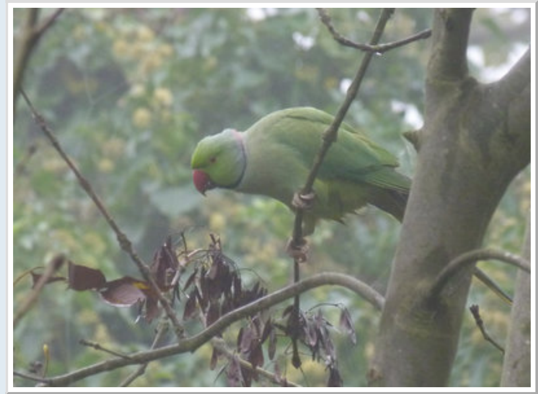
In the mist a Ringed Necked Parakeet at Margate enjoys the feast.