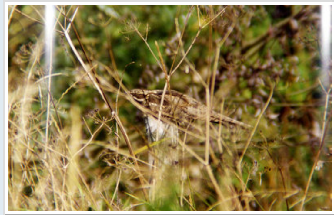
A Nightjar on autumn migration on Walland Marsh