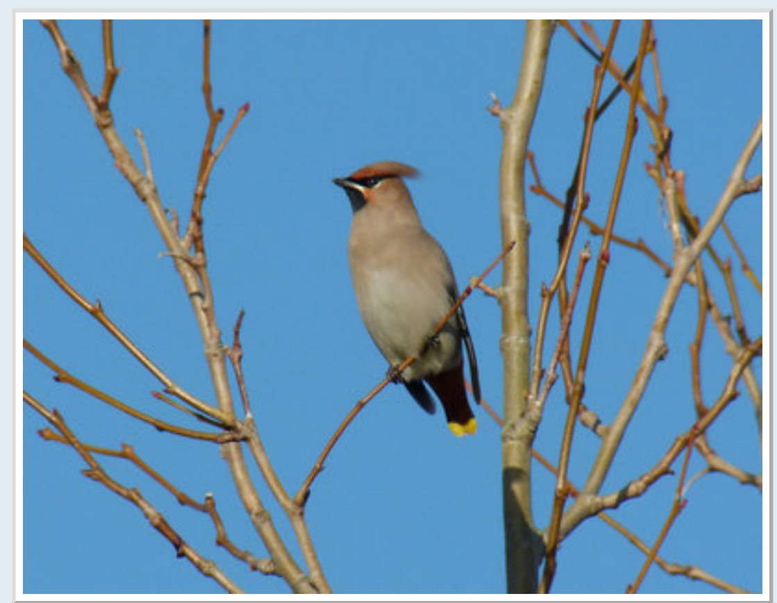
One of the 3 Waxwings at Hersden.