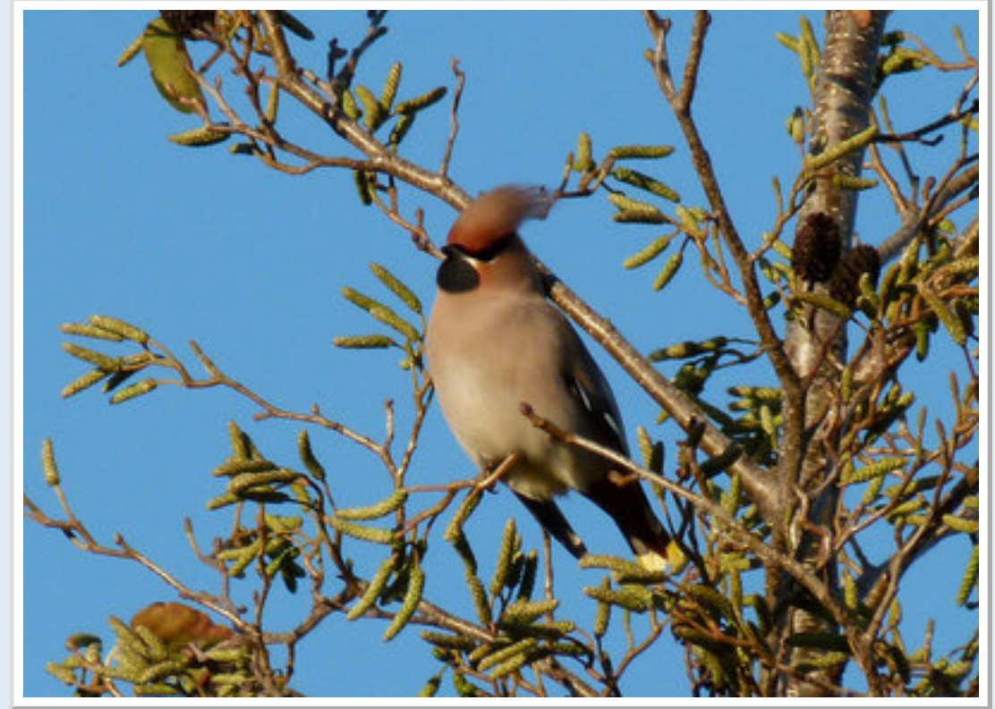
One of a group of 38 Waxwings present at Ashford Kent.