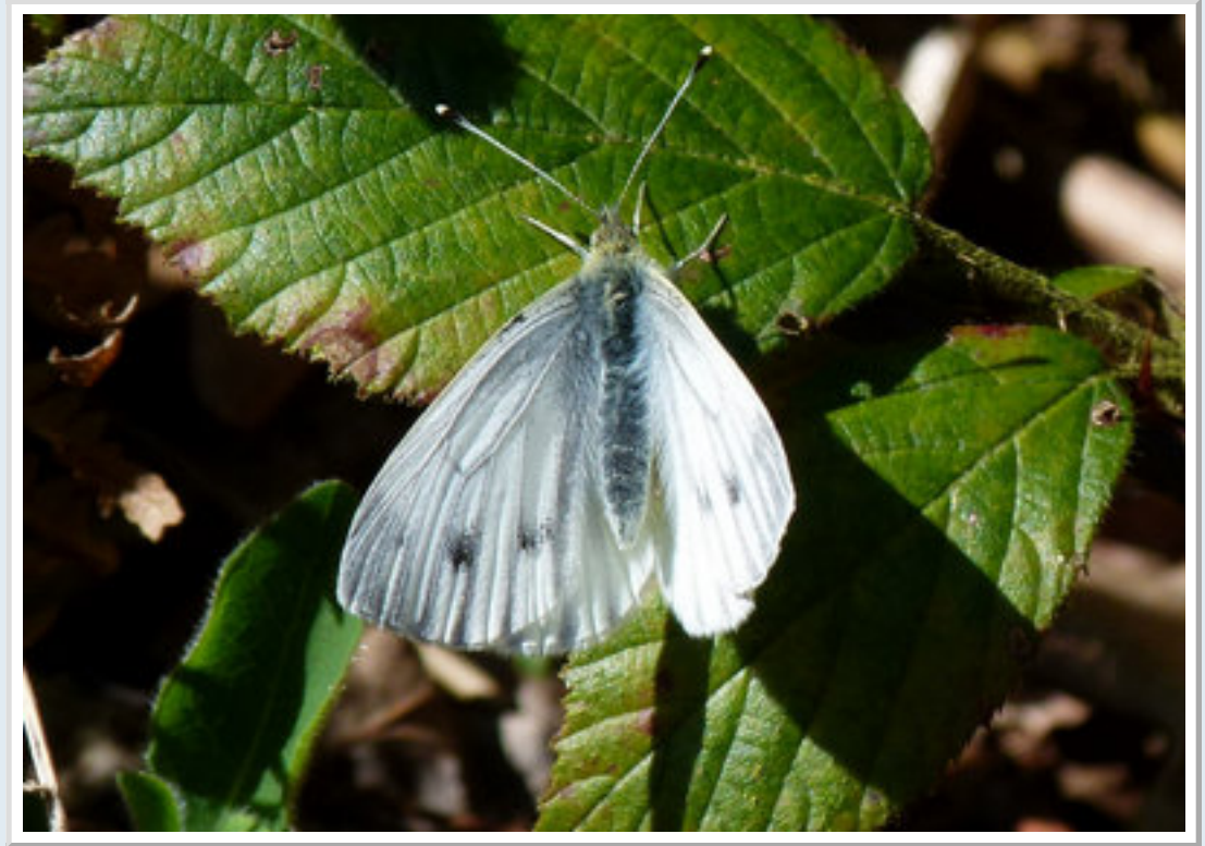
Green Veined White at Hamstreet Woods.