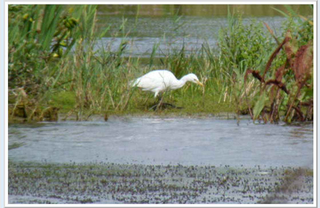
Cattle Egret on Dungeness RSPB reserve, along Dengemarsh Road.