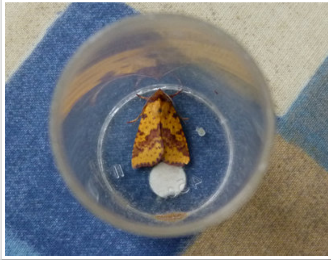
Pink Barred Sallow (sorry about the glass reflection).