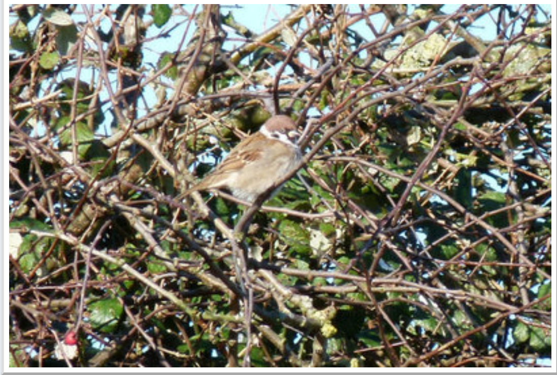
Tree Sparrow trying to hide in the brambles near Cheyne Court, Walland Marsh.