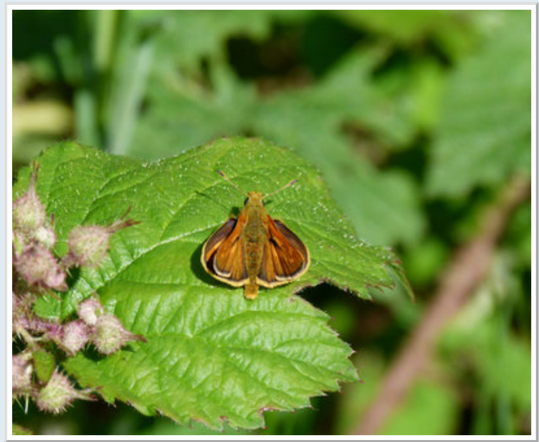
Large Skipper at Parkgate.