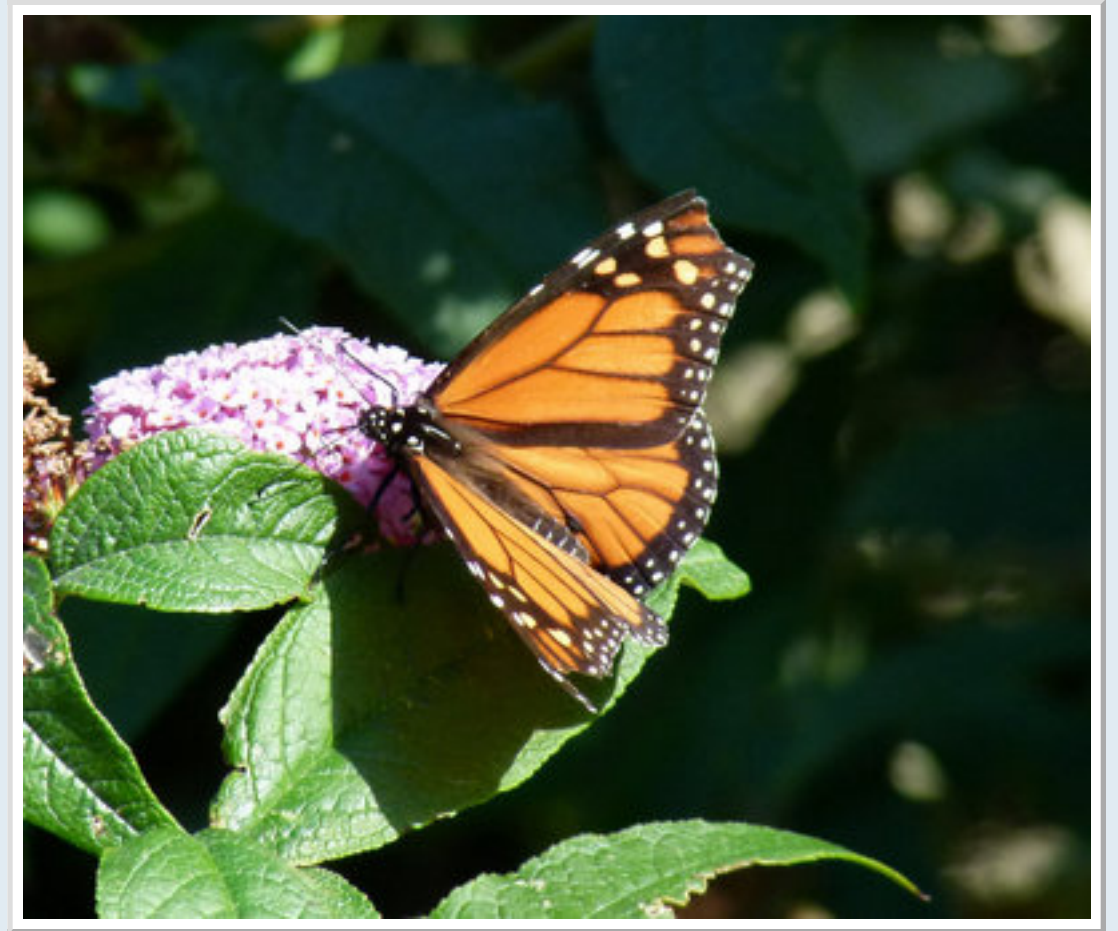
Our butterfly of the year. The Monarch present for a week on Portland.