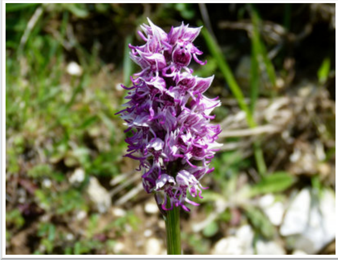
Monkey Orchid at Parkgate NR (Kent).