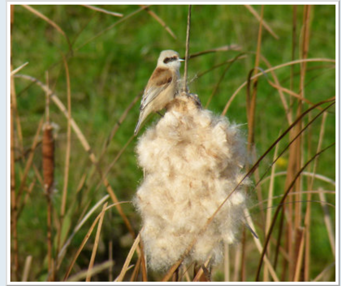
Penduline Tit at Oare Marsh.