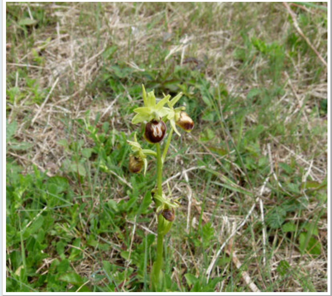
Late Spider Orchid at WYE NNR. One of 33 present this year.