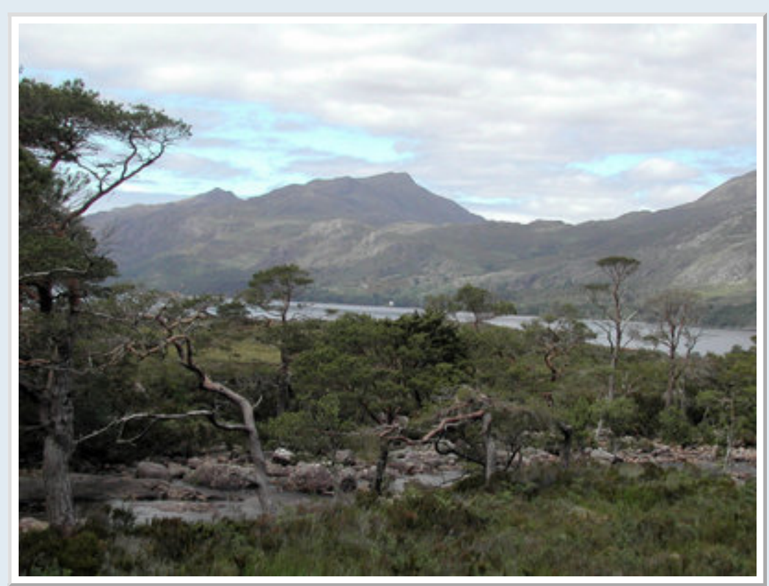
The north side of the Bridge of Grudie looking from the A832.

PS. This site and all this information is in the public domain, including several Site Guide books. However, it is remote and visitor numbers to the Bridge of Grudie are very low. The most we have seen is 3 others when we visited in early July 2006.