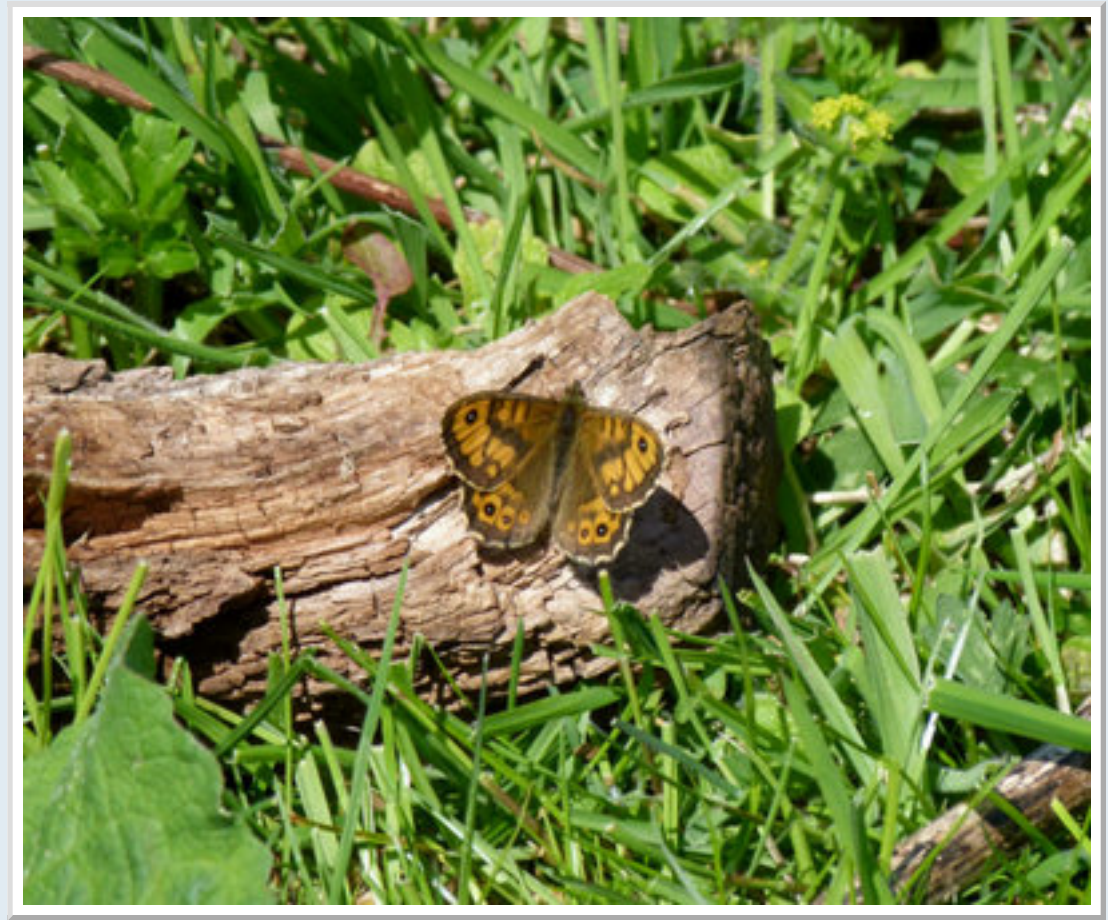
Wall Brown at Wye NR.