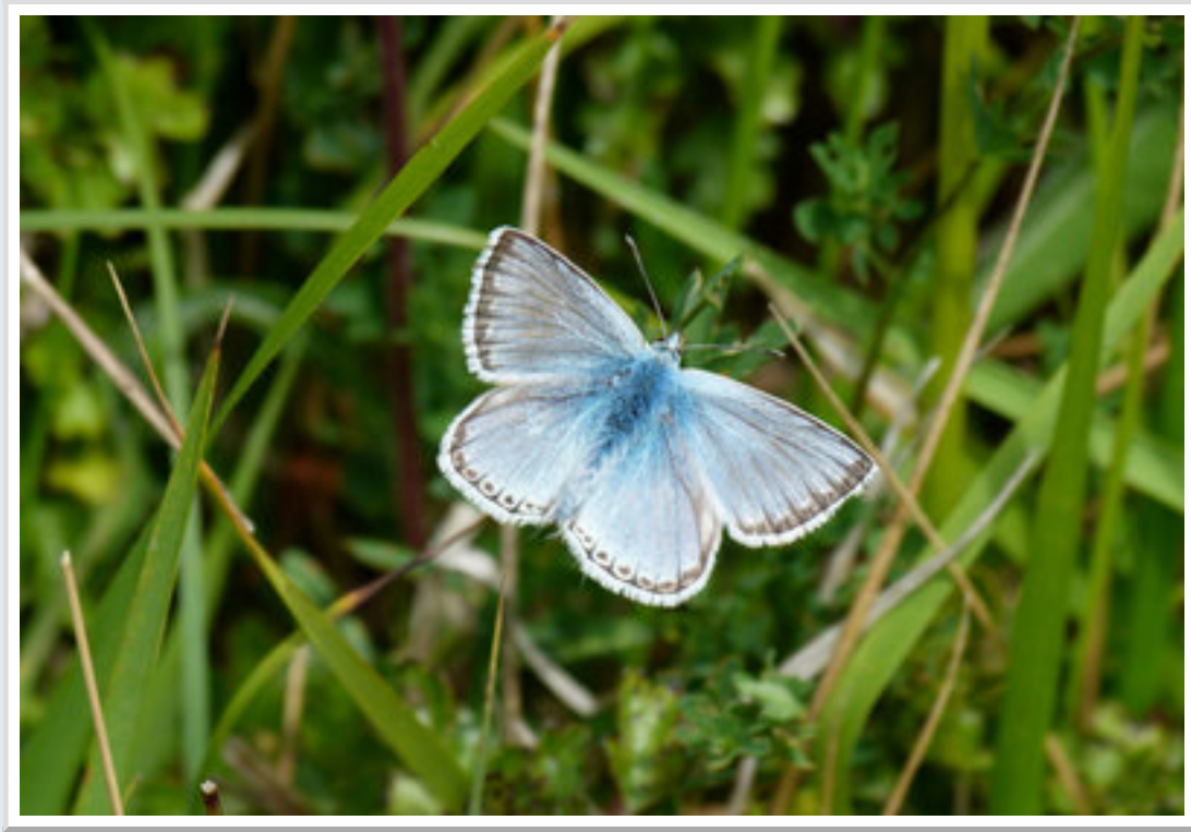
Chalkhill Blues are still at Lydden and Wye NR in good numbers.