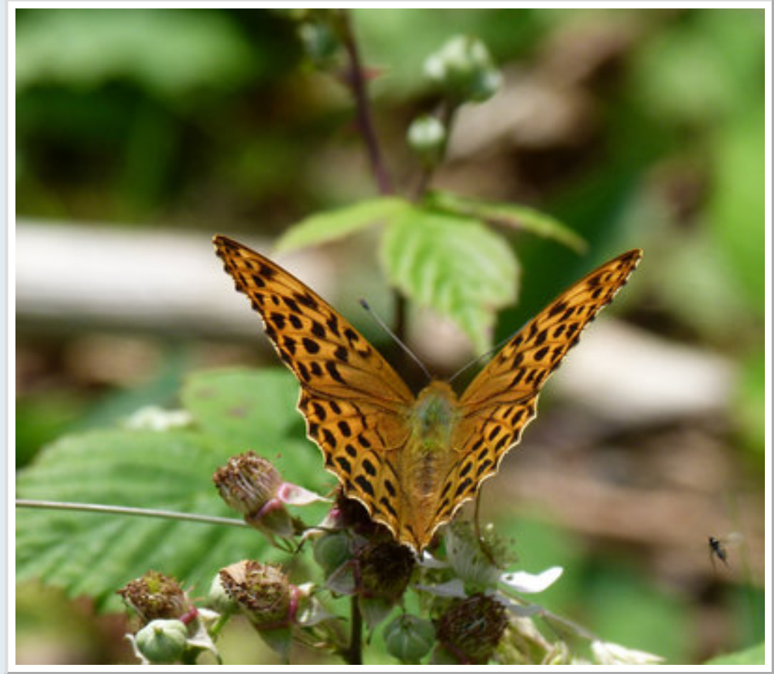
Silver Washed Fritillary at Beckley Woods.