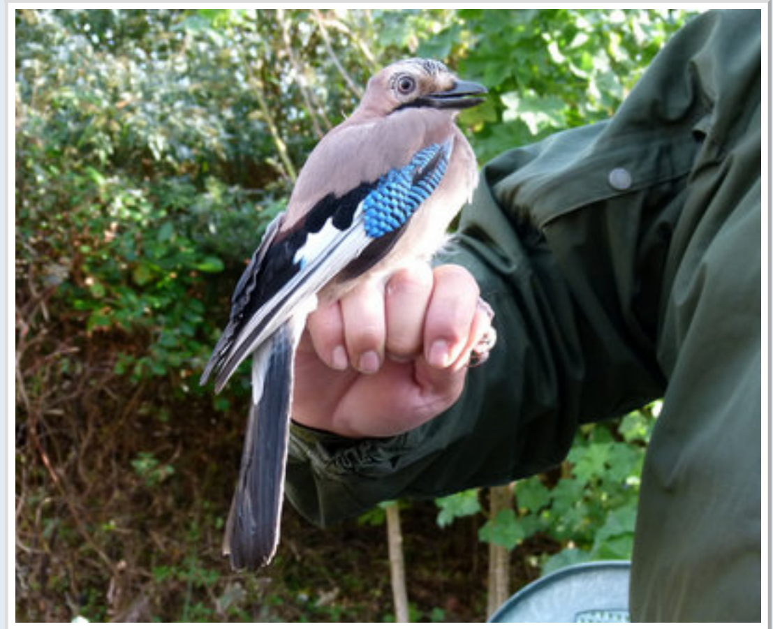
This Jay was trapped at Dungeness. One of many appearing in the country at present following a failure of the acorn crop in Europe.