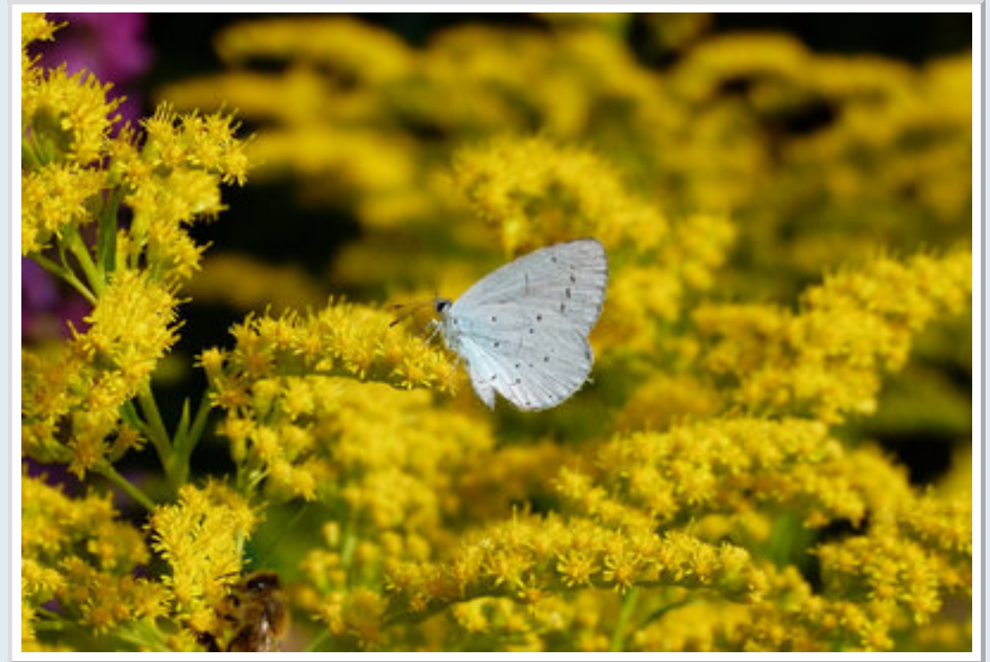
This Holly Blue had taken a liking to Golden Rod.