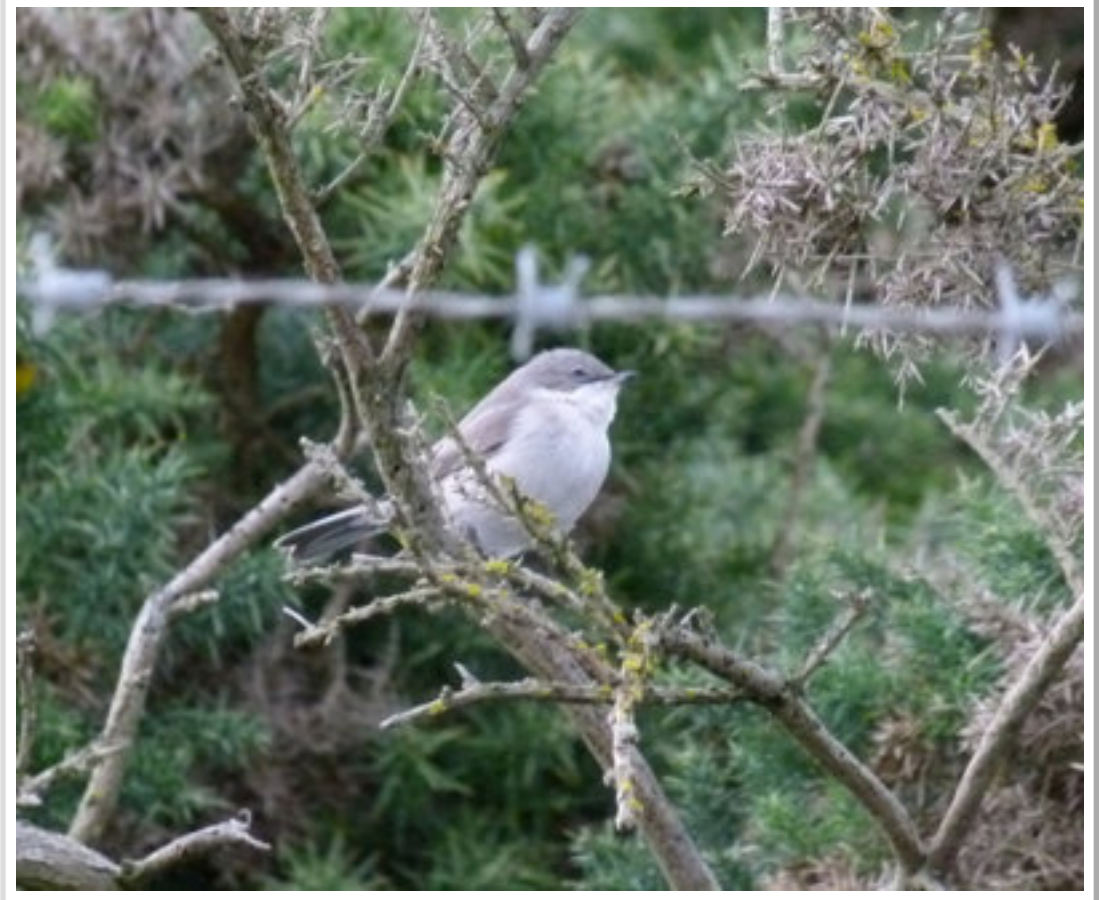
This late Lesser Whitethroat was at Dungeness. Poor light affected the quality of the photo.