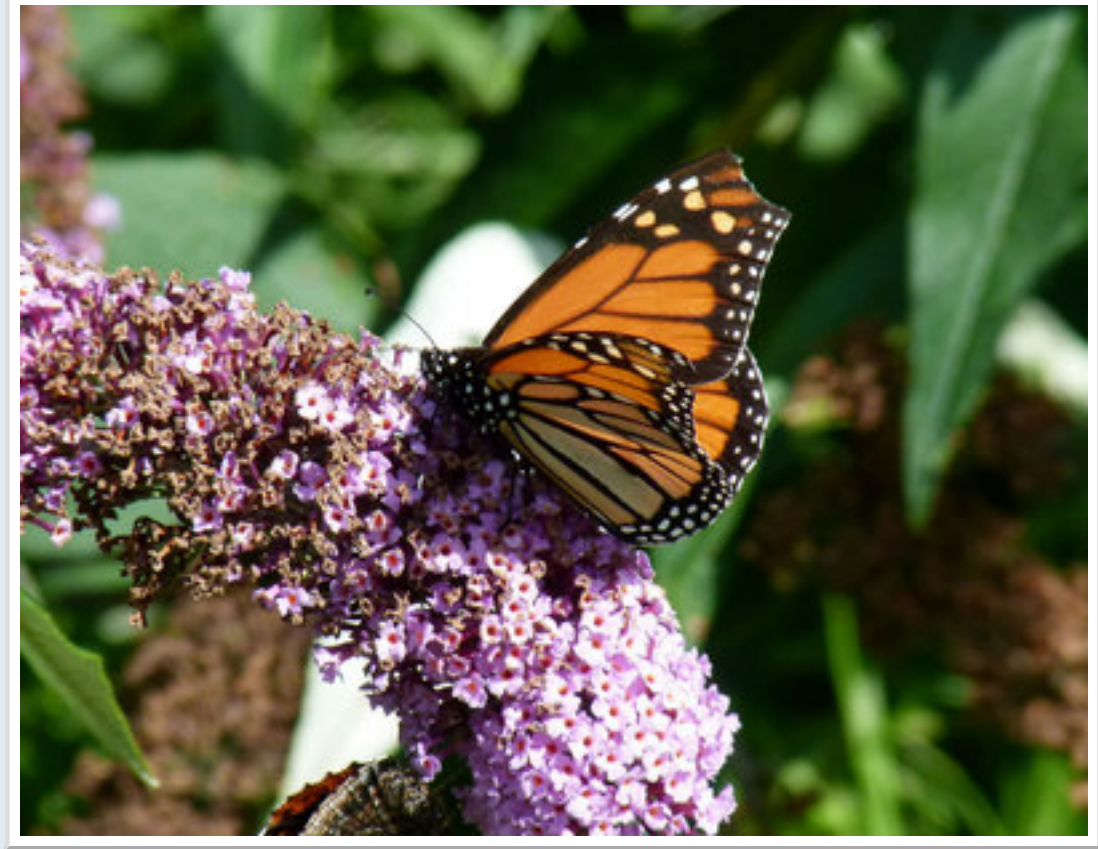
Monarch Butterfly at Easton (Portland).