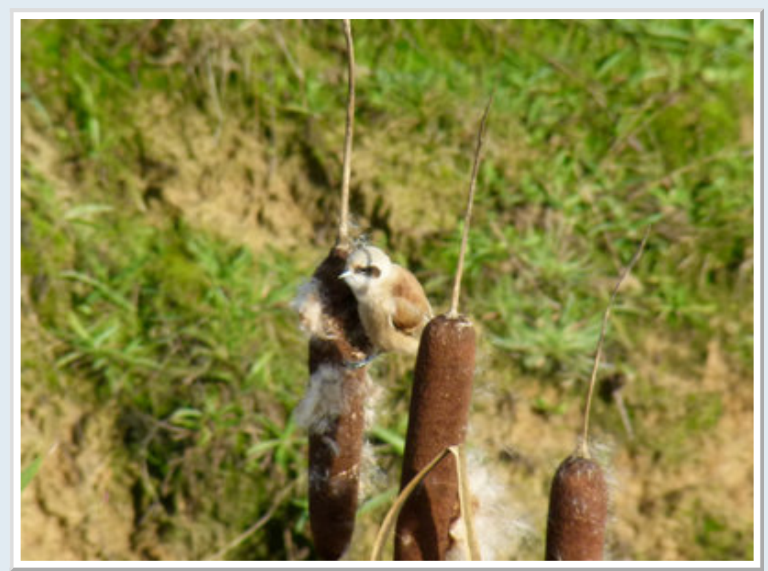
Penduline Tit at Oare Marsh.