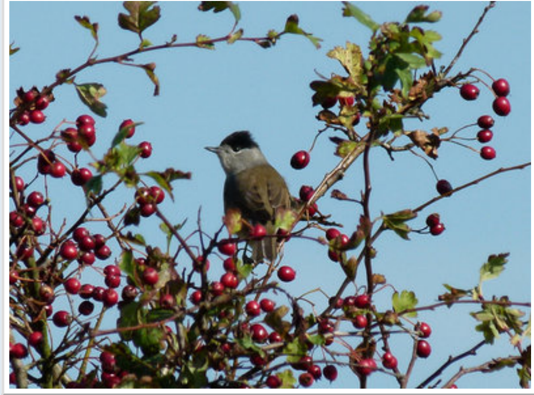
This male Blackcap was one of 6 enjoying the berries on offer at St Margarets.