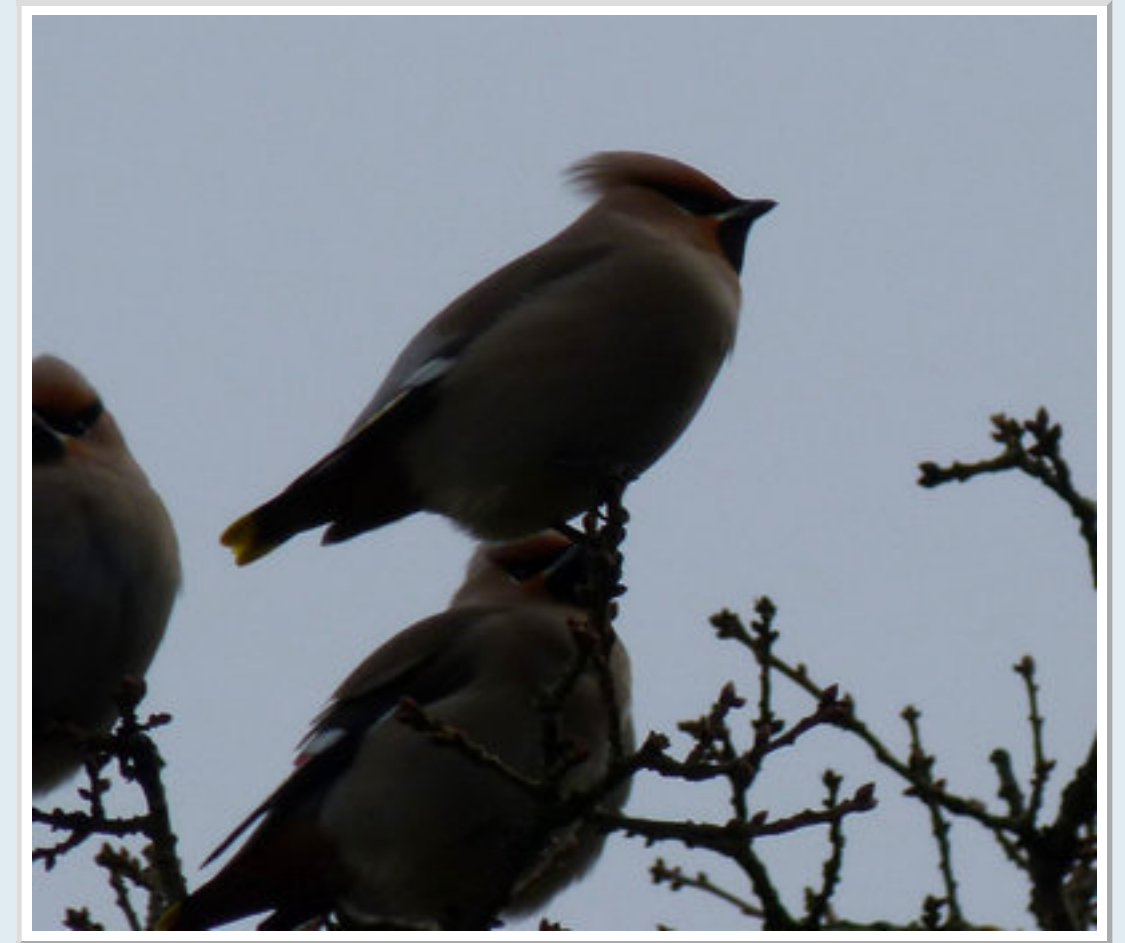
Waxwing at Shadoxhurst near Ashford. Picture taken in poor light due to showers.