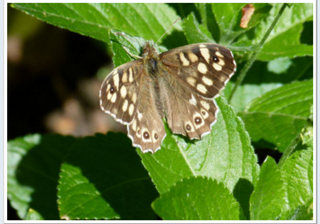
Speckled Wood near Chilham