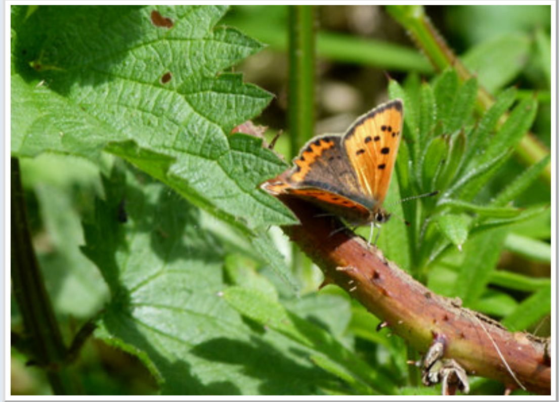
Small Copper at Wye NR. Trying to hide in the Brambles.