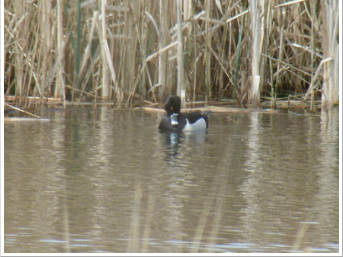
Another view of the Ringed Necked Duck