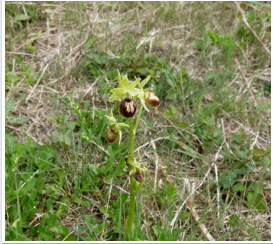
Early Spider Orchid at Samphie Hoe.