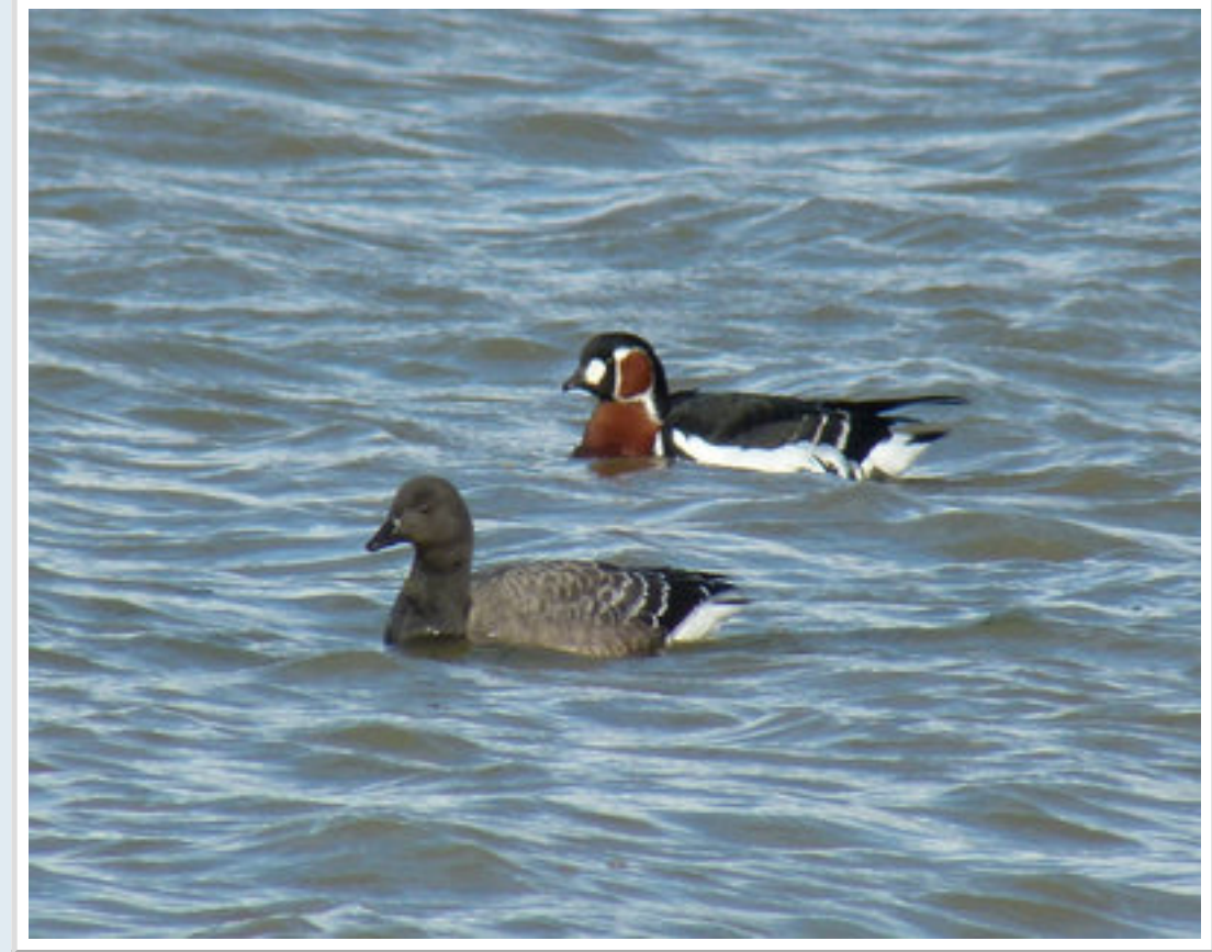
Red Breasted Goose at the West end of Seasalter.