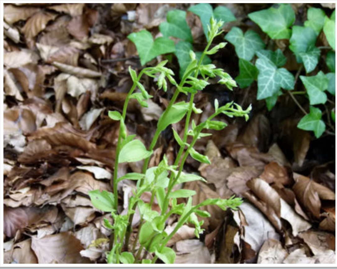
Green Flowered Helleborine well past their best near Eynsford. Kents only site.