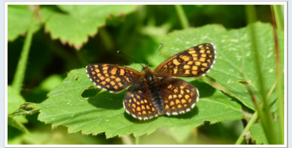
Heath Fritillary at East Blean Wood