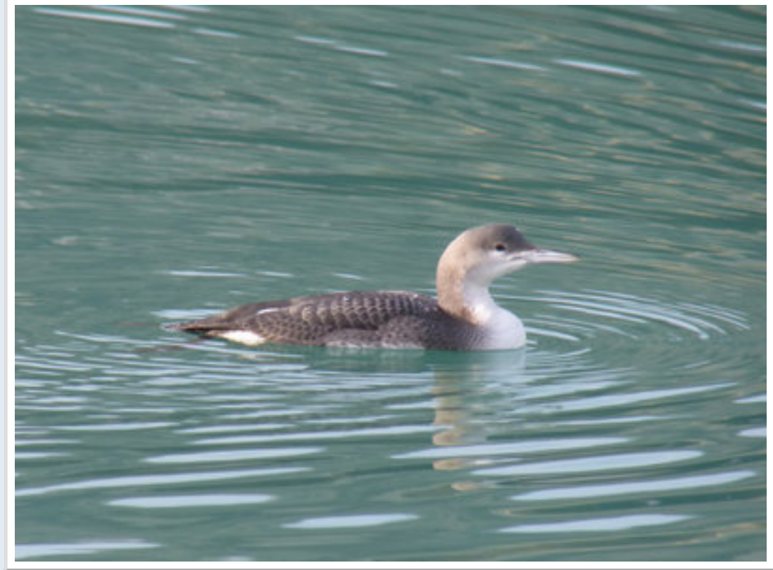
Black Throated Diver in Dover Granville Docks.