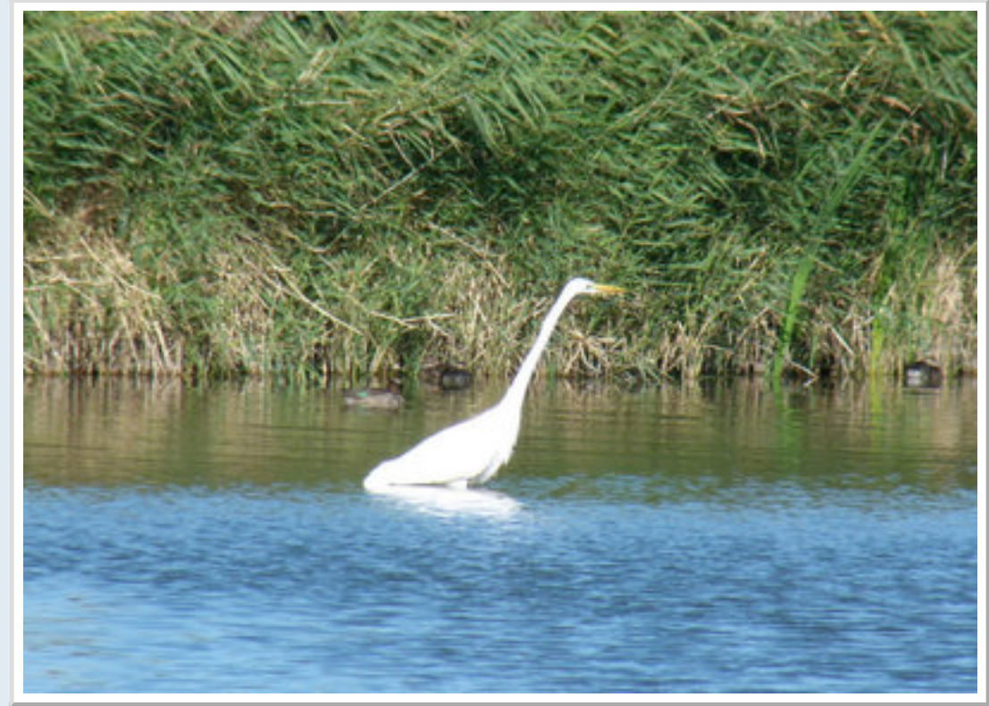
One of the two Great White Egrets present at Stodmarsh.