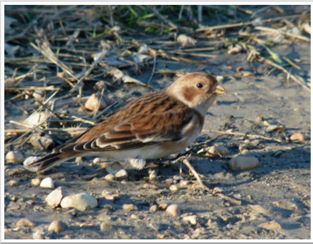
Snow Bunting at Littlestone