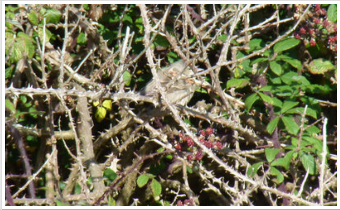
Barred Warbler trying to hide in the bramble bushes around Dungeness Moat.

Depending on the traffic we were at least an hour away, but this is a good Kent bird so we headed south. We arrived at Dungeness just as it reappeared in the Moat following its release and a period of rest. These are always difficult birds to see in the open and today was no exception with the bird remaining in brambles whilst it fed on blackberries. 2 Small Tortoiseshells and a Red Admiral passed as we watched the bird. The only decent moth at the Obs was the Gem and nearby in the gull roost at the fishing boats was the adult Yellow Legged Herring Gull. A really enjoyable sunny day at a couple of good locations.