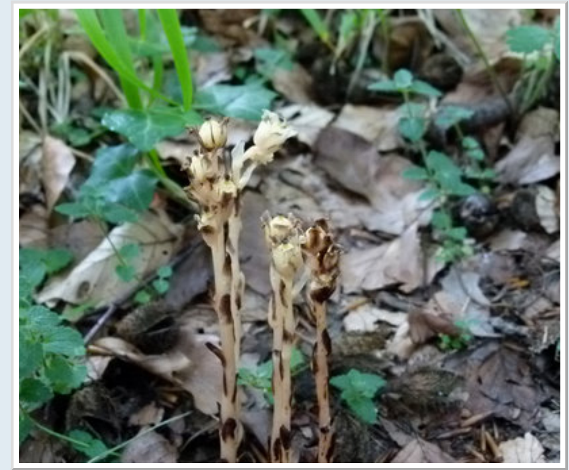
5 plants of Yellow Birds Nest near Eynsford, just past their best.