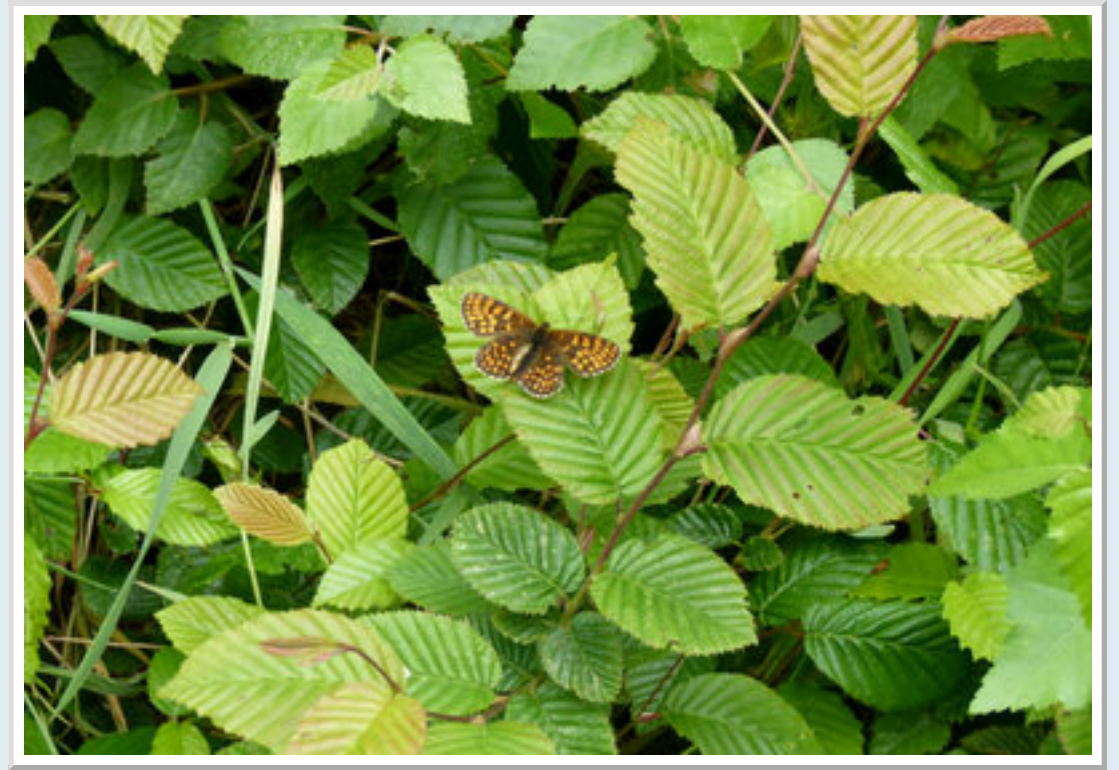
Heath Fritillary Butterfly at East Blean.