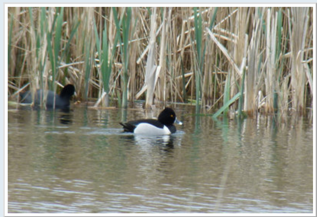
Male Ringed Necked Duck near Hookers Pit at Dungeness