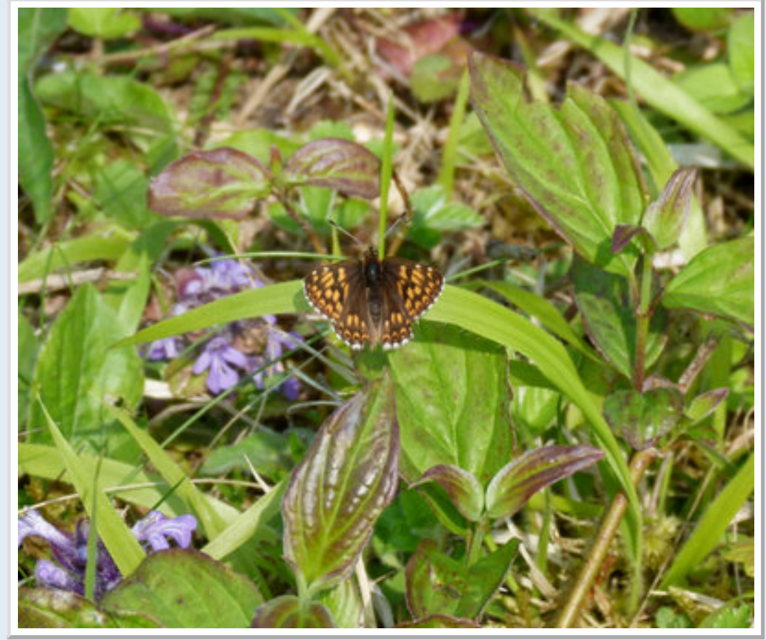
Duke of Burgundy at Bonsai Bank (Kent).