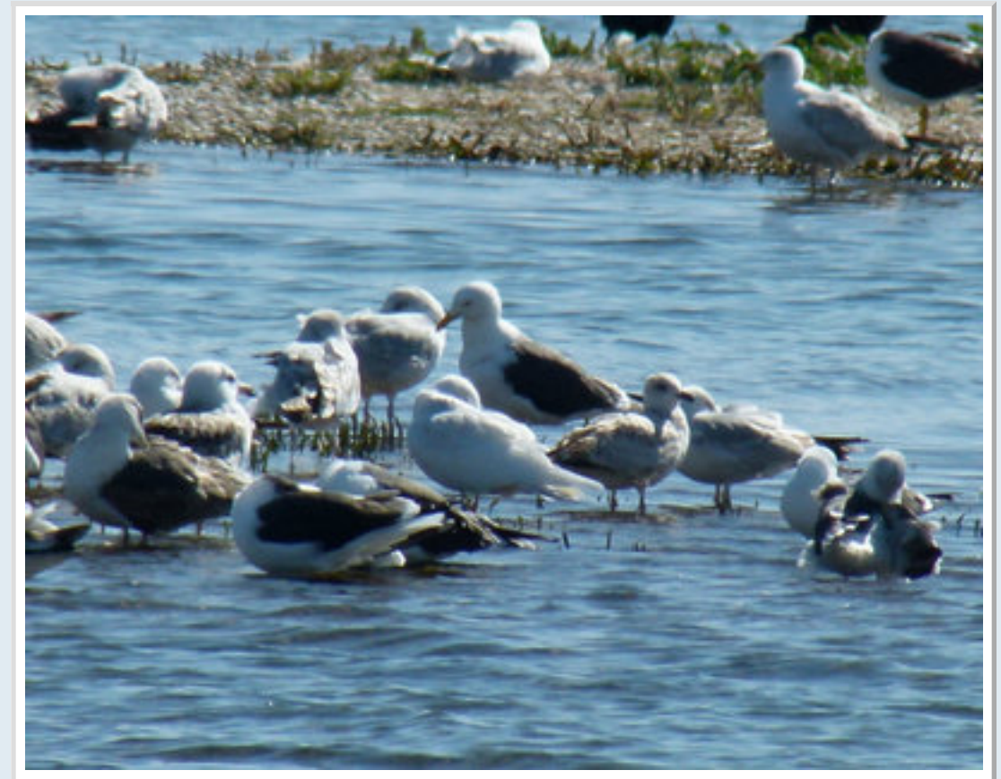
The second winter Iceland Gull at Dungeness. Sorry about the light. The sun was behind, but it was a case of press the shutter before the bird woke up and flew off.