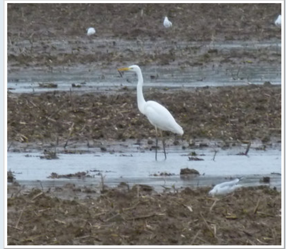
This Great White Egret was present at dusk at Conningbrook Gravel Pits (hence the poor photograph).