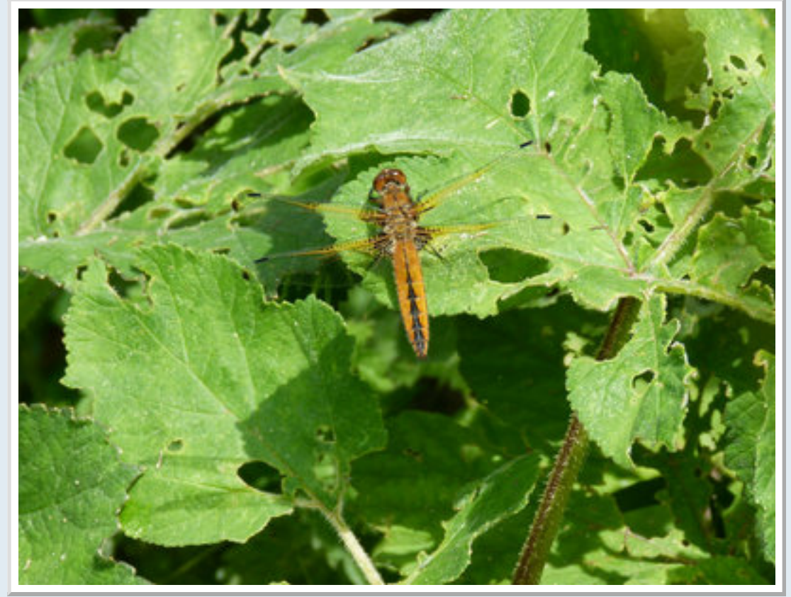
Scarce Chaser along the River Stour at Westbere