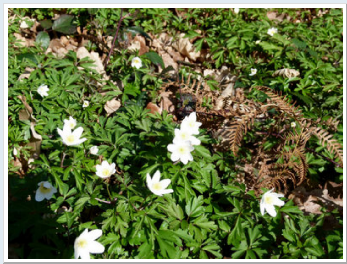
Part of the banks of Wood Anemone in Hamstreet Woods.