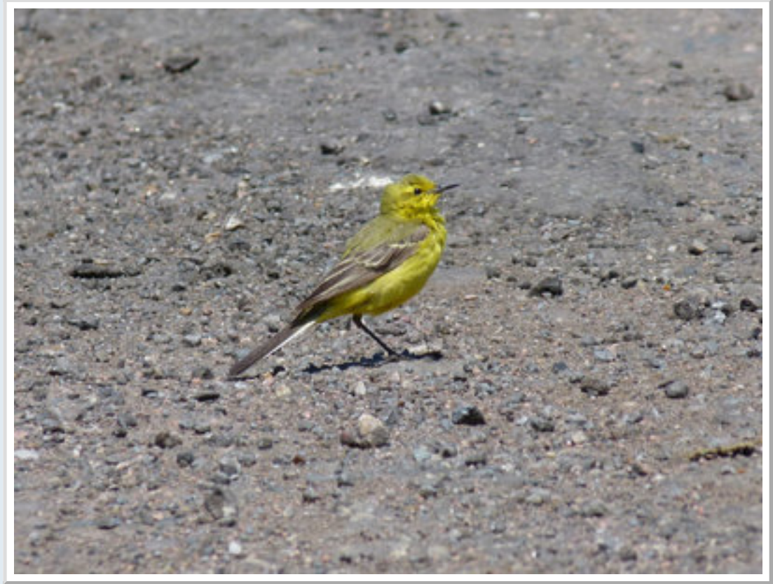
This Yellow Wagtail was near Kingsferry Bridge.