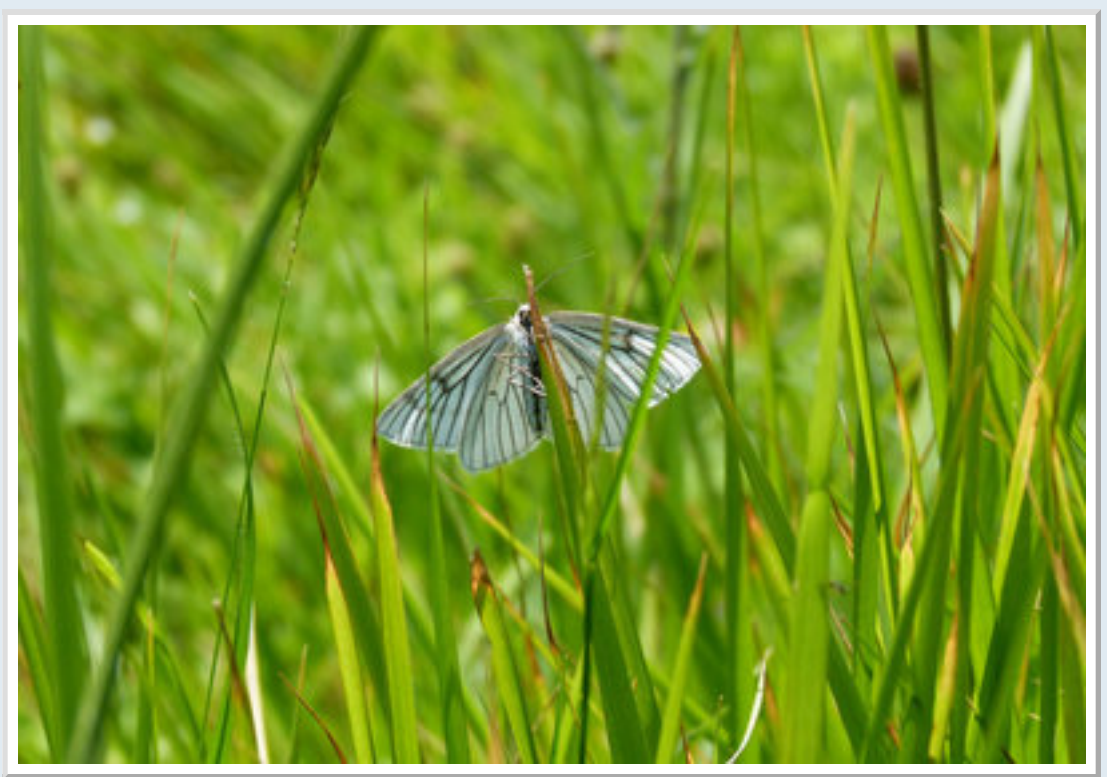
One of only two Black Veined moths we could find this year.