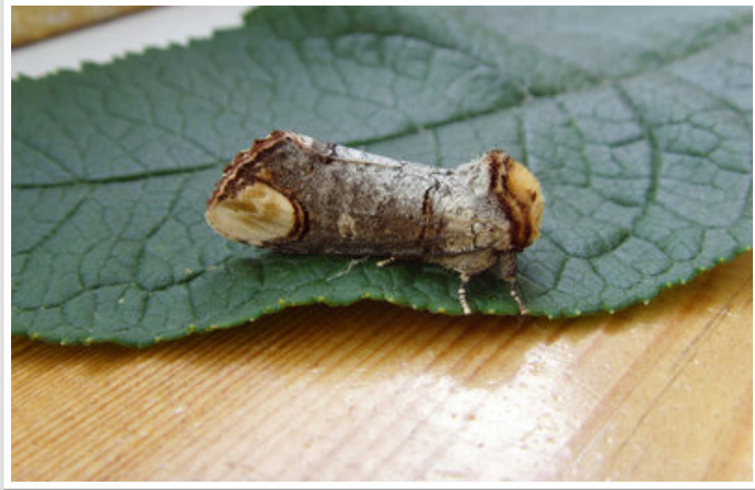
This Buff-tip moth is a master of disguise.