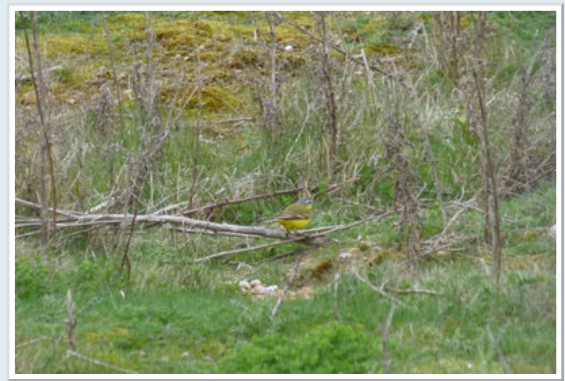
This Blue Headed Wagtail was present on the ARC pit at Dungness from the road.

I have added a few photos taken on visits over the last week or so. Very few Butterflies so far this year. The Blue Headed Wagtail is just a sub species of the Yellow Wagtail and is usually found on the near Continent. There is about 8 or 9 variants of this species and they can be very confusing. I tend to just admire the look of the bird for it is of Britains declining species and no longer a common bird of the countryside.