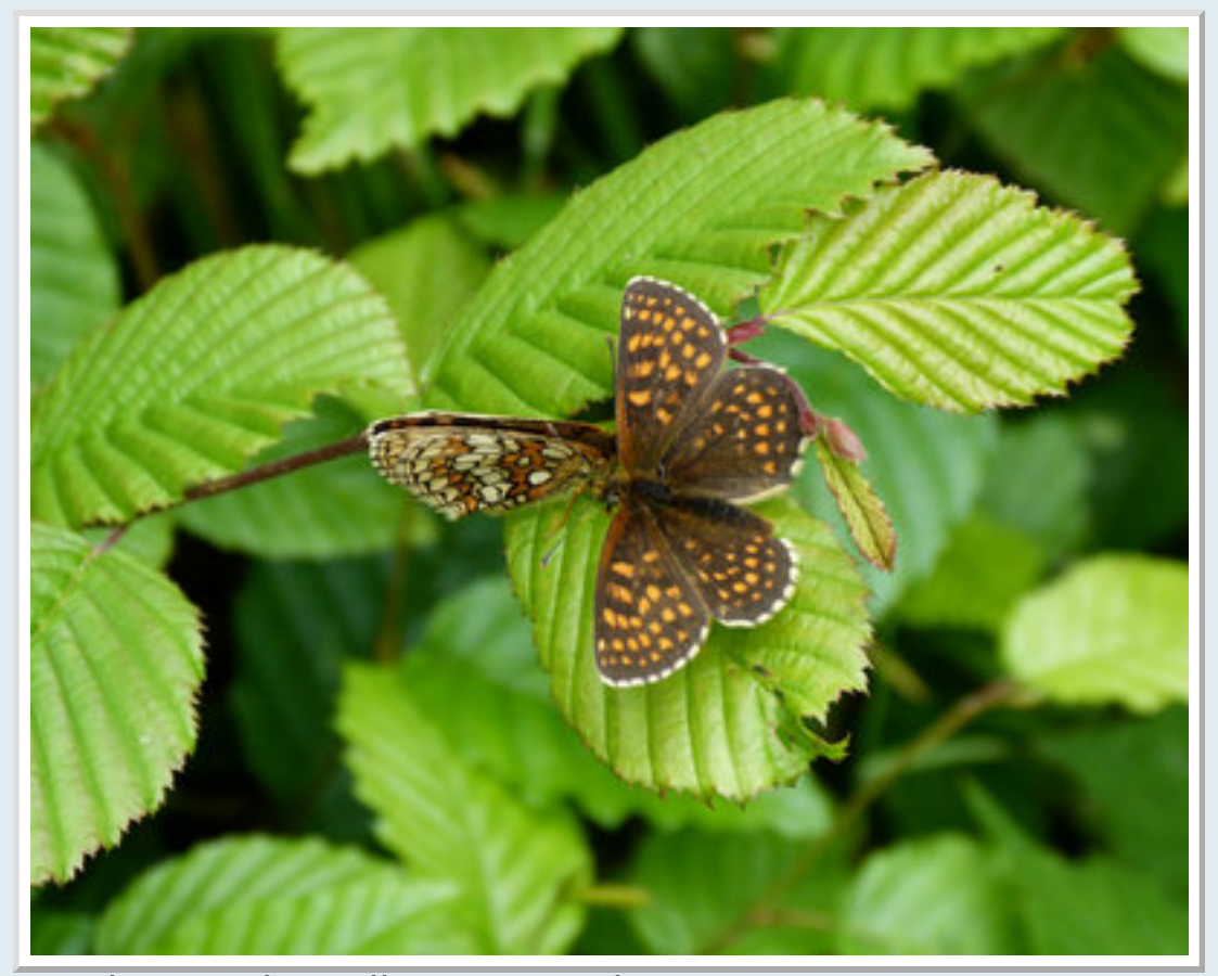
Another Heath Fritillary at East Blean.

No real chance of any butterflies around here today although a Holly Blue in the garden between the showers and a break in the clouds was a surprise. I have therefore added a few photos from the weekend. The light was poor and photography was difficult.