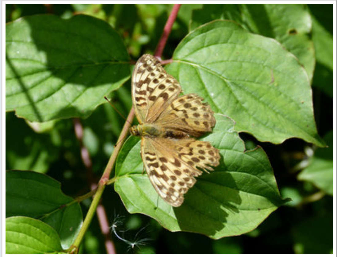
This faded Silver Washed Frititillary was a nice find, and our first for a local wood at Chilham.