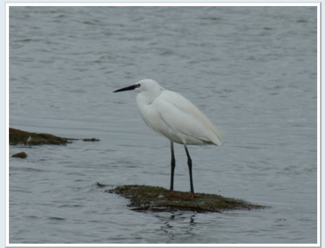
This Little Egret was at Oare Marsh