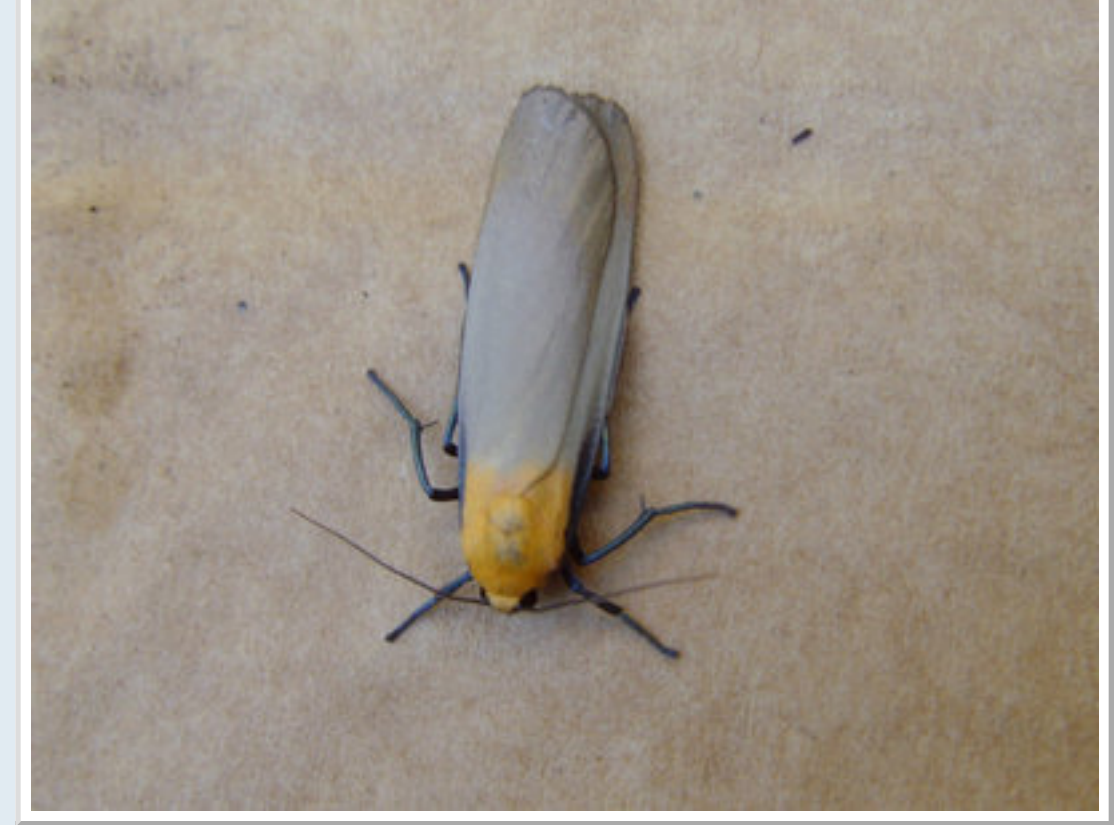
Male Four Spotted Footman caught at Hamstreet on Saturday.

On our way there we had received a text to inform us of a good Kent moth at a friends house. So tea time found us at Hamstreet looking at a male Four Spotted Footman. Although they breed in Devon and Cornwall they are a very rare migrant in Kent. They do migrate from the Continent, but equally this one could have come from Cornwall on the South Westerly winds we have had lately. A brillant end to another good day in Kent.