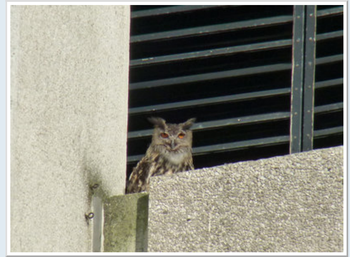
The Eagle Owl in Ashford. Really impressive in size whether its an escape or not. Seen to eat a feral pigeon just before we arrived.