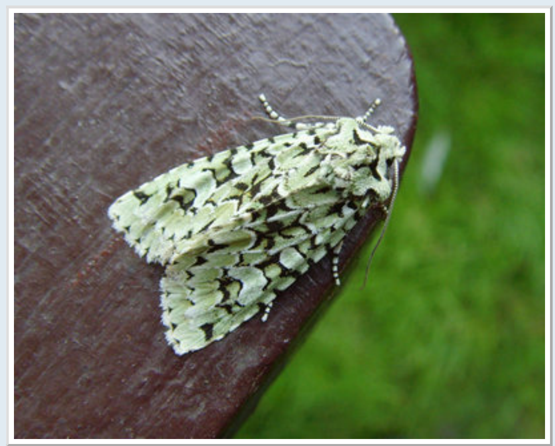
I know I posted one last year but the Merveille du Jour has to be one of Britains best moths.