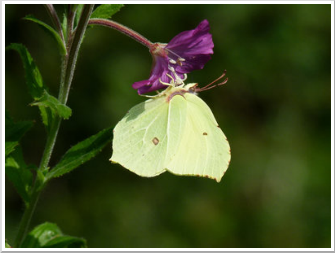
Nice to see the Brimstones in good numbers at Hamstreet.

There appeared to be a big emergence of Peacocks in Hamstreet Woods.