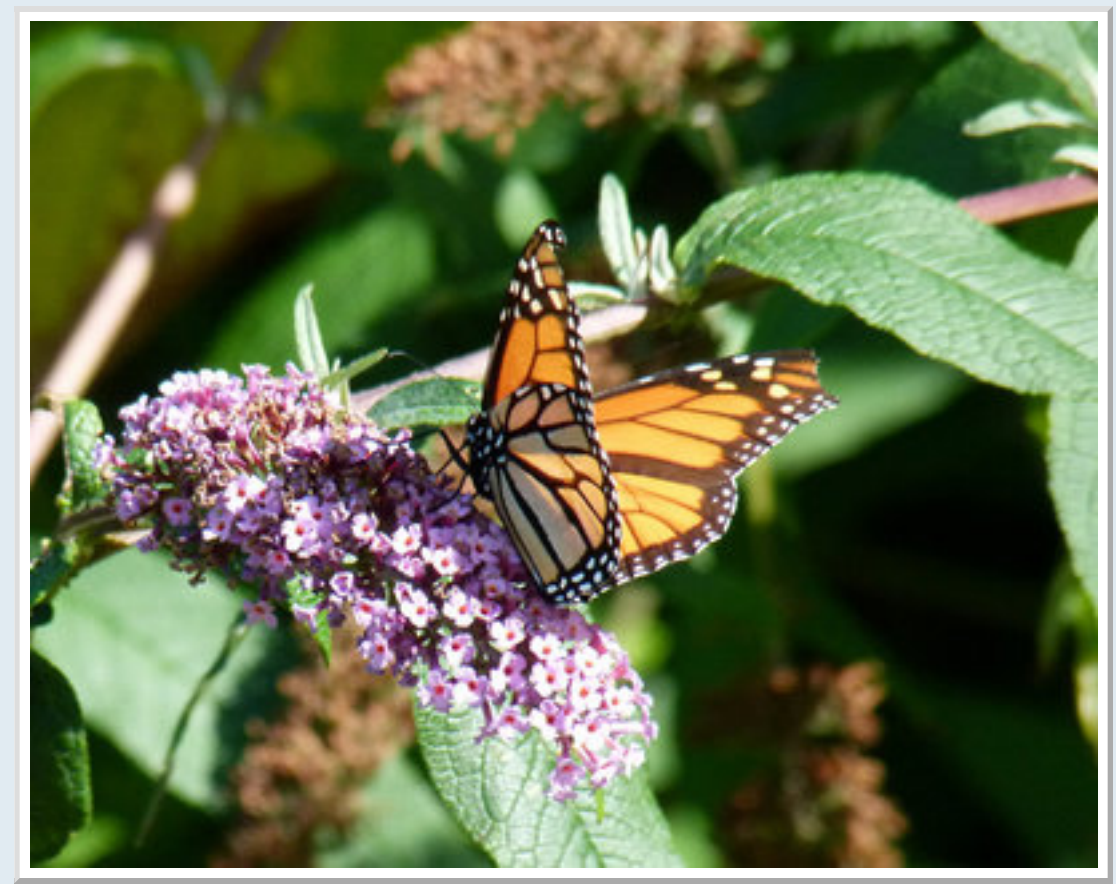
Monarch Butterfly at Easton (Portland).