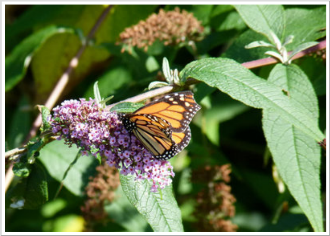
Monarch Butterfly at Easton (Portland).