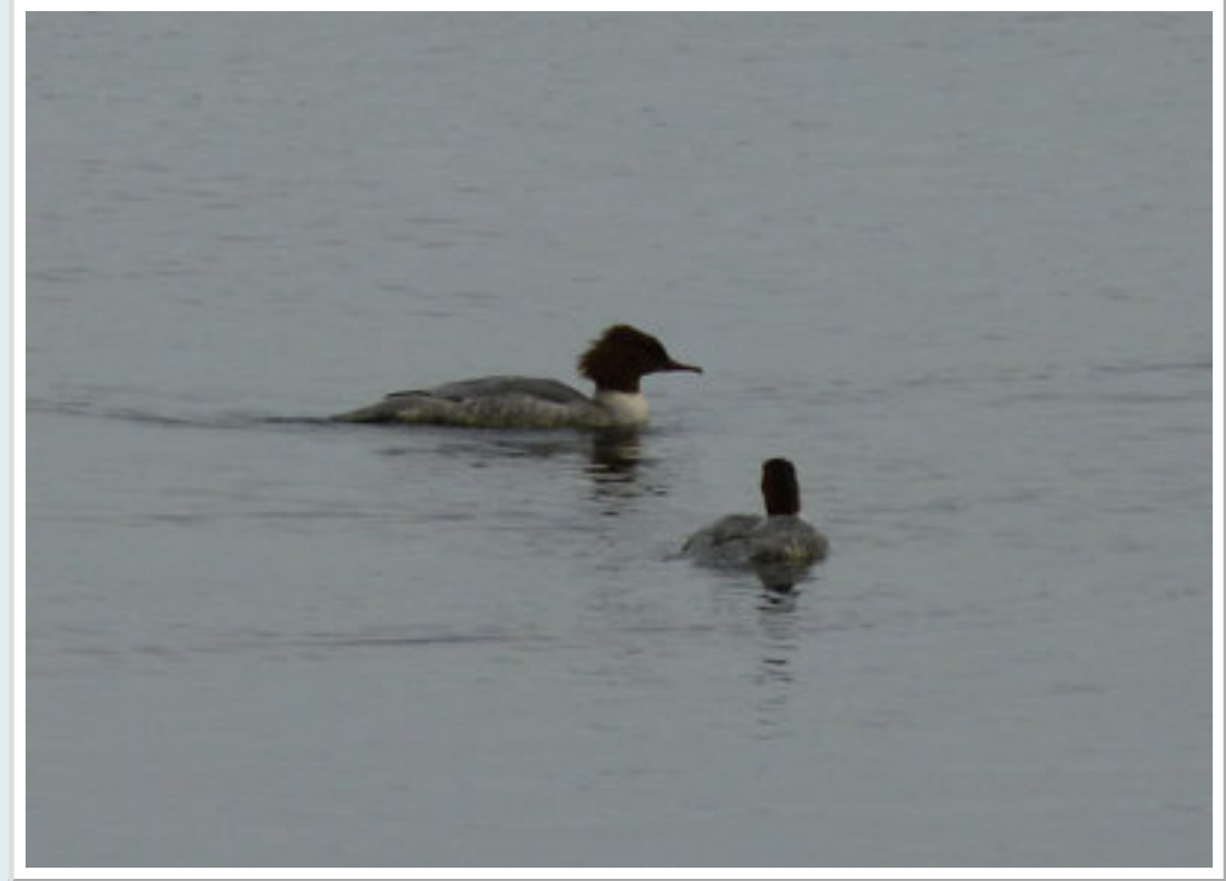
Female Goosander on Burrowes Plt, Dungeness RSPB.