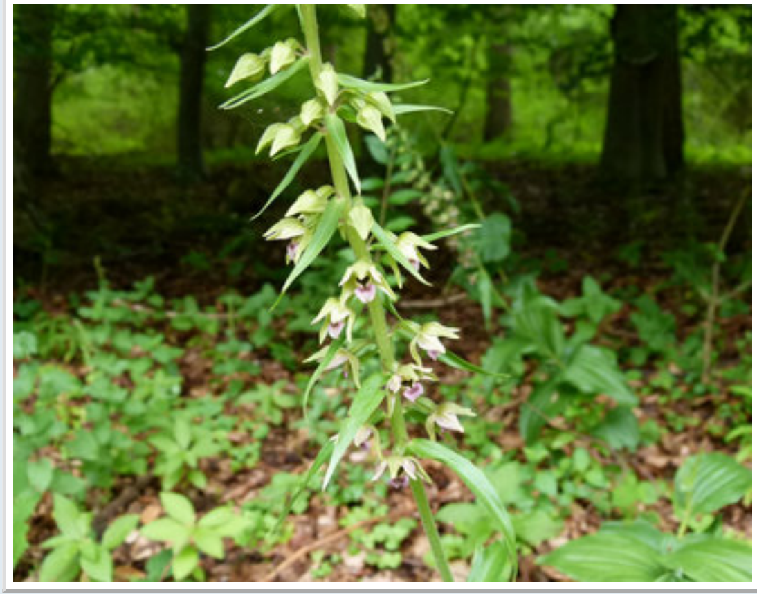
One of 100 Broad Leaved Helleborines near Faversham.