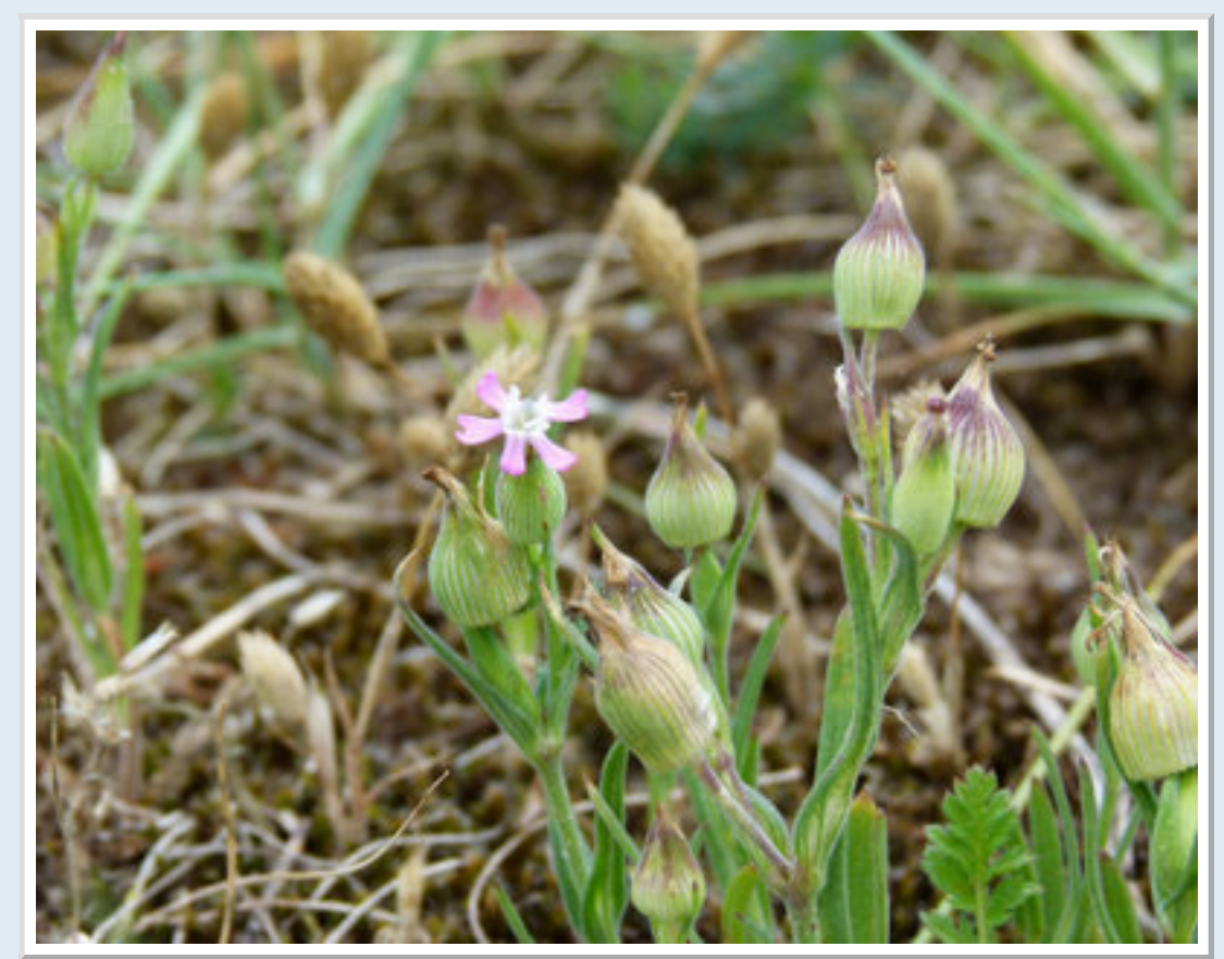
Sand Catchfly at Sandwich Bay sea front.