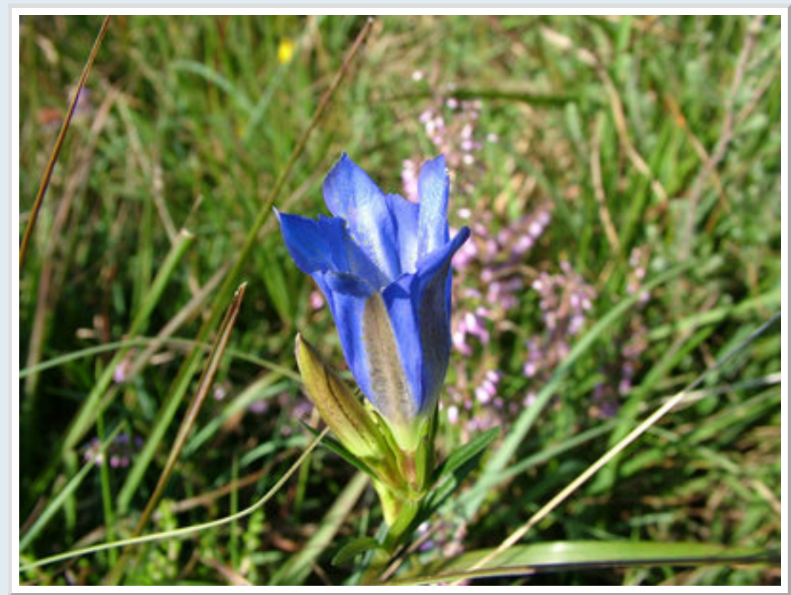
Marsh Gentian, Ashdown Forest, 2007.