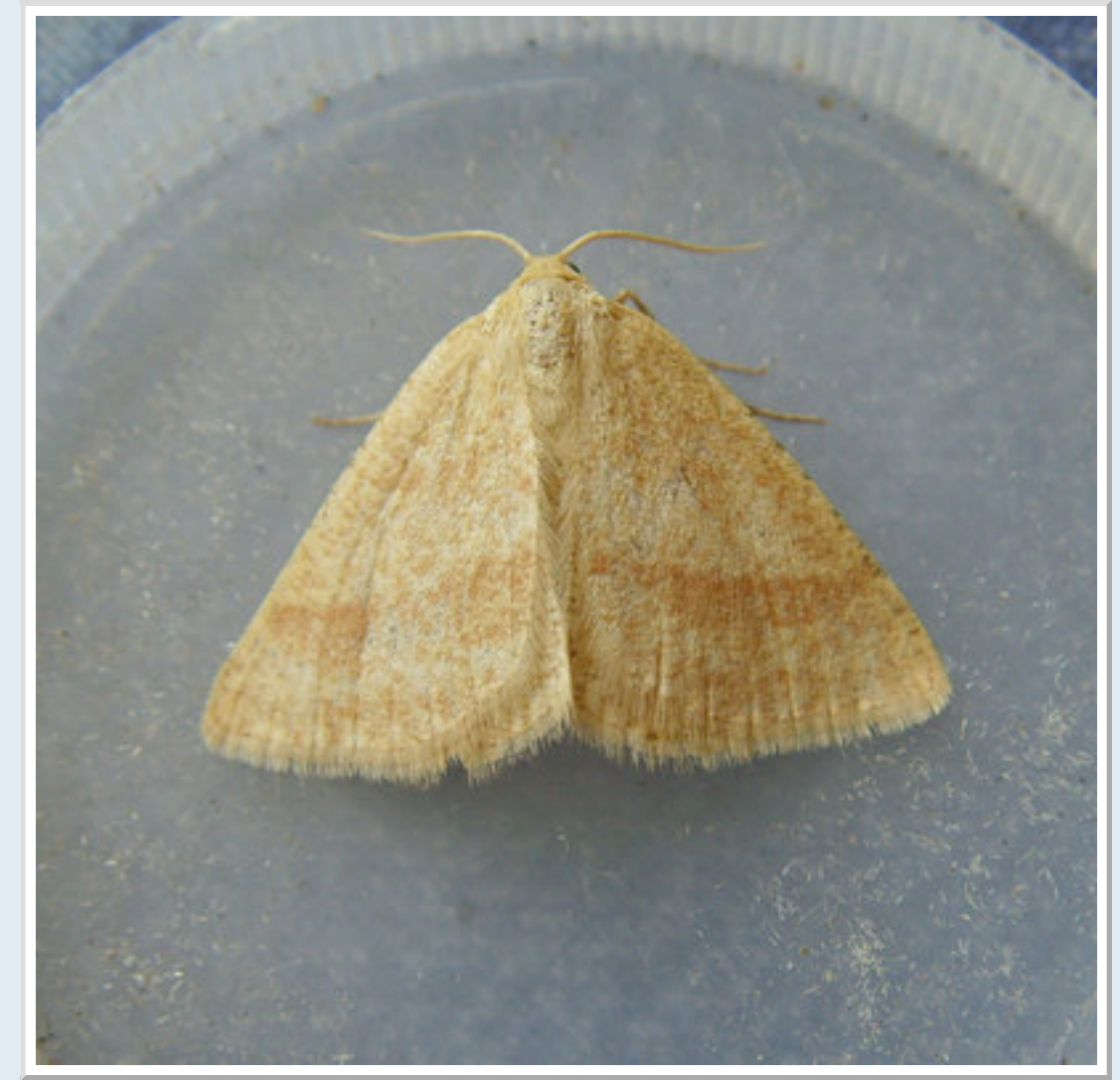
Rest Harrow. This rare moth was trapped at Dungeness