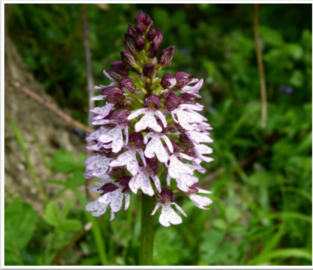
Lady Orchid at Wye NR.