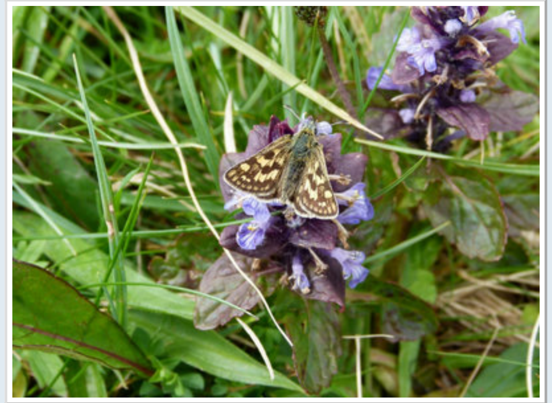
Chequered Skipper June 2011.