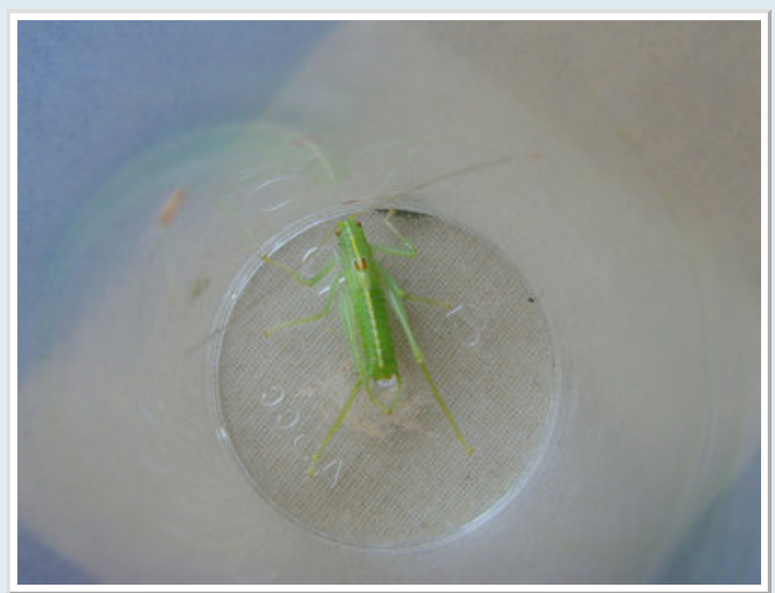
This Southern Oak Bush Cricket was found at Dungeness. Being flightless its appearance is a mystery.