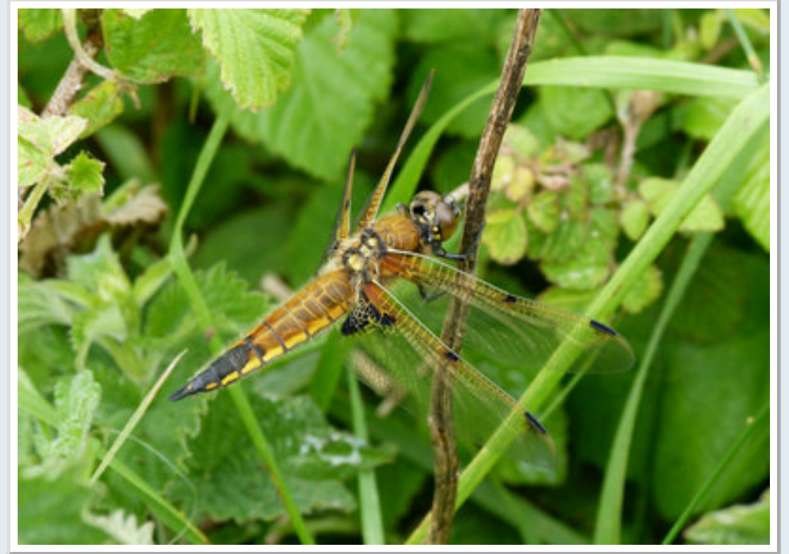
Four Spotted Chaser at Dungeness