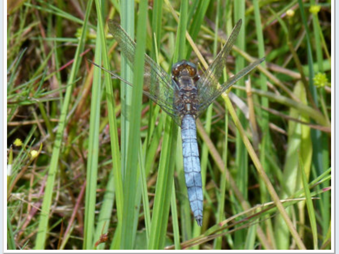
Male Keeled Skimmer at Hothfield Common. Ready to protect his patch from rivals.