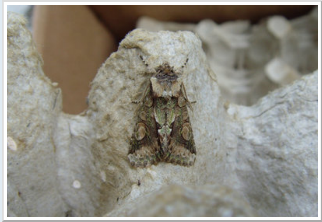
Green Brindled Crescent at Hamstreet