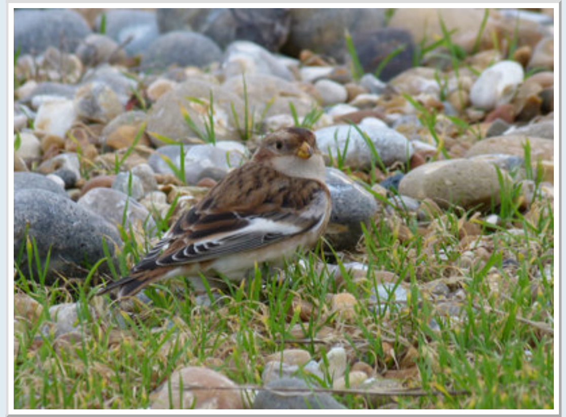
This is the second Snow Bunting at Littlestone