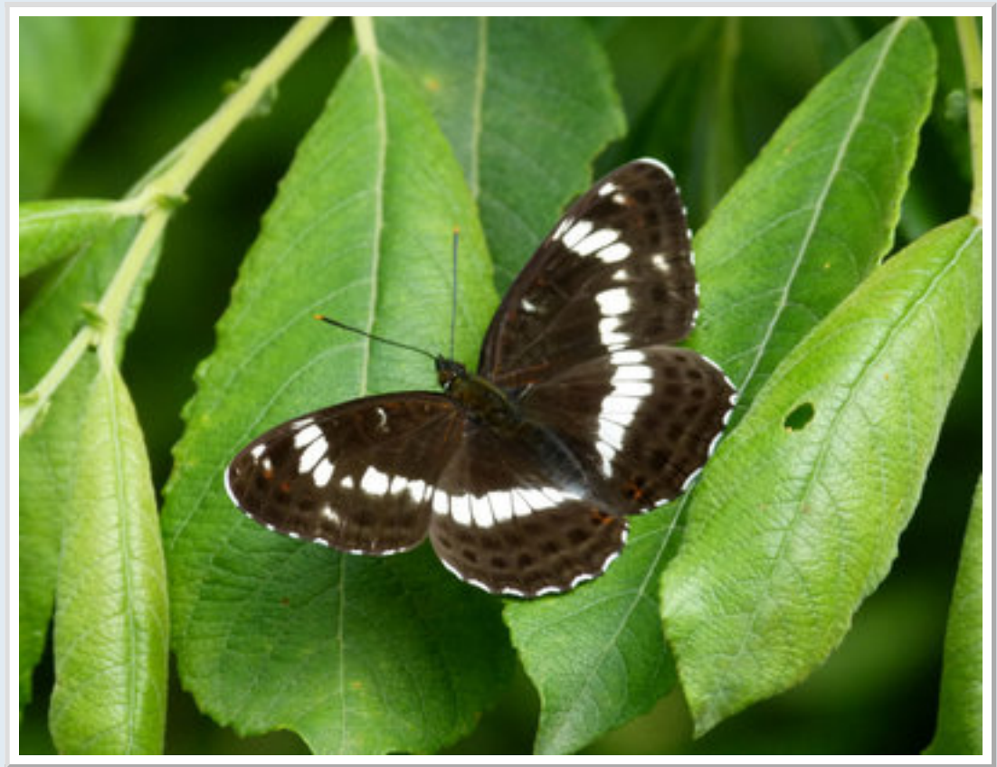
White Admiral at Hamstreet Wood