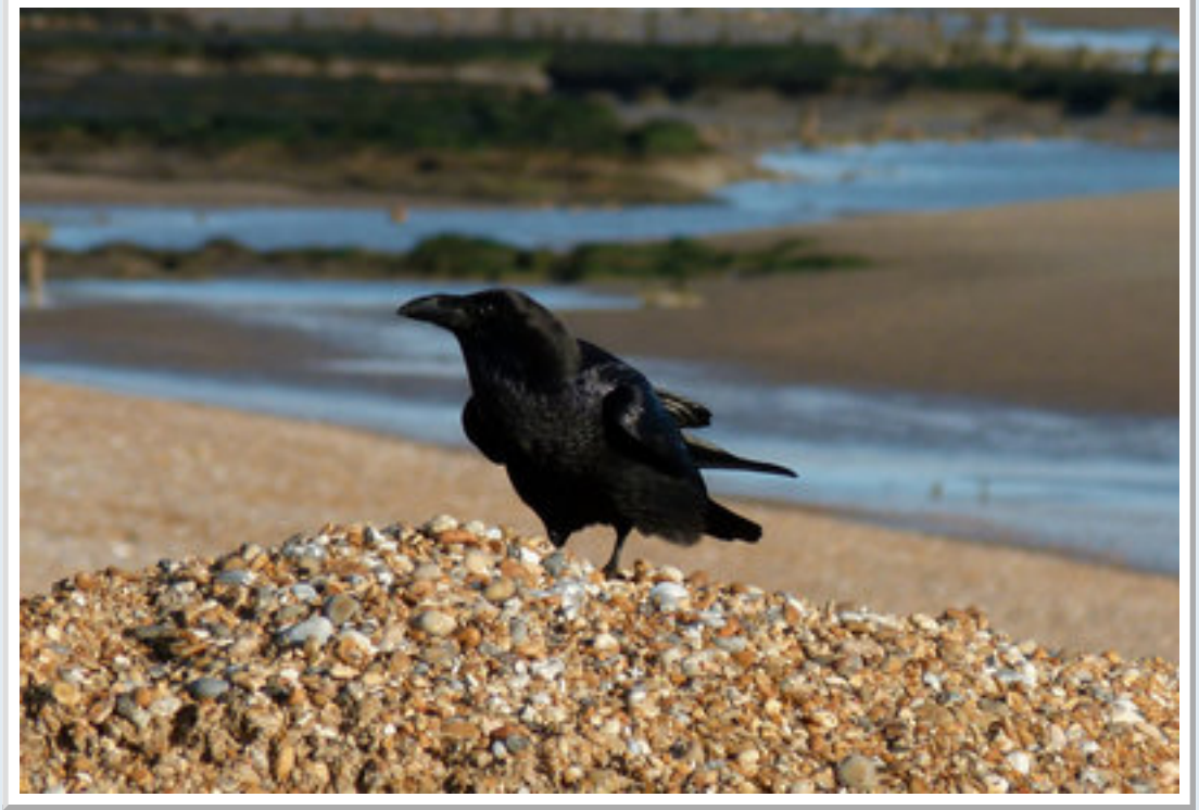
One of two Ravens present on our visit to Pett Level (East Sussex).