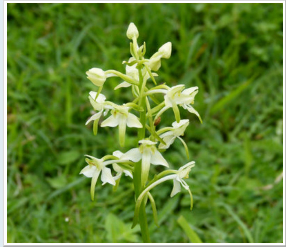
Greater Butterfly Orchid at Parkgate.