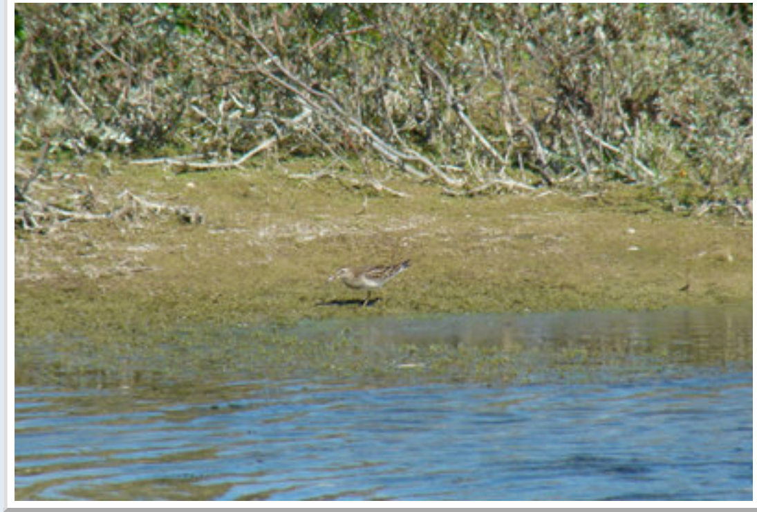
Pectoral Sandpiper on Burrowes Pit (RSPB Reserve) Dungeness