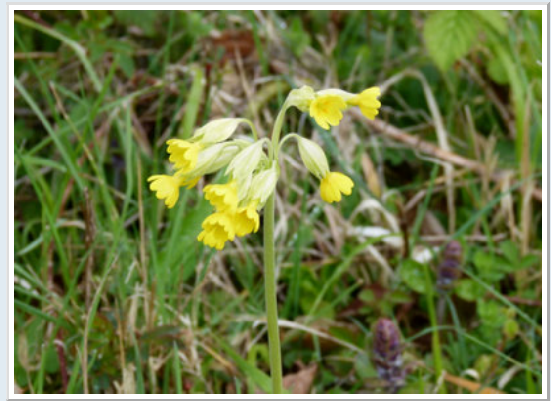
Cowslip about to flower at Wye National Nature Reserve.