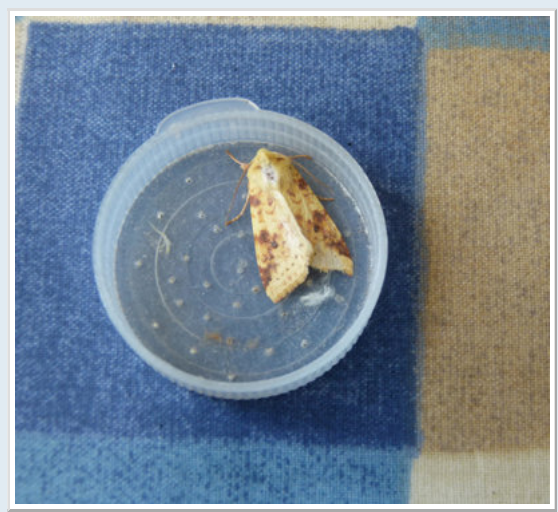
Sallow seen at Dungeness last weekend.