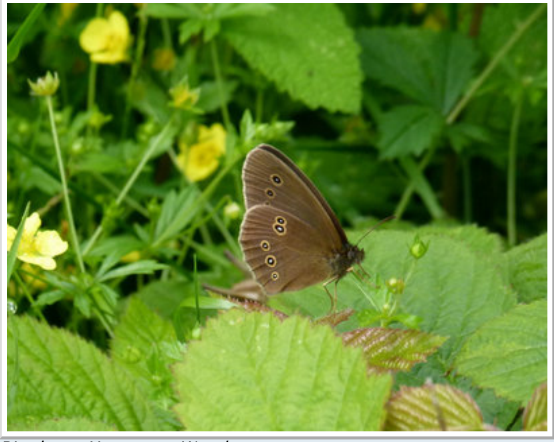
Ringlet at Hamstreet Wood