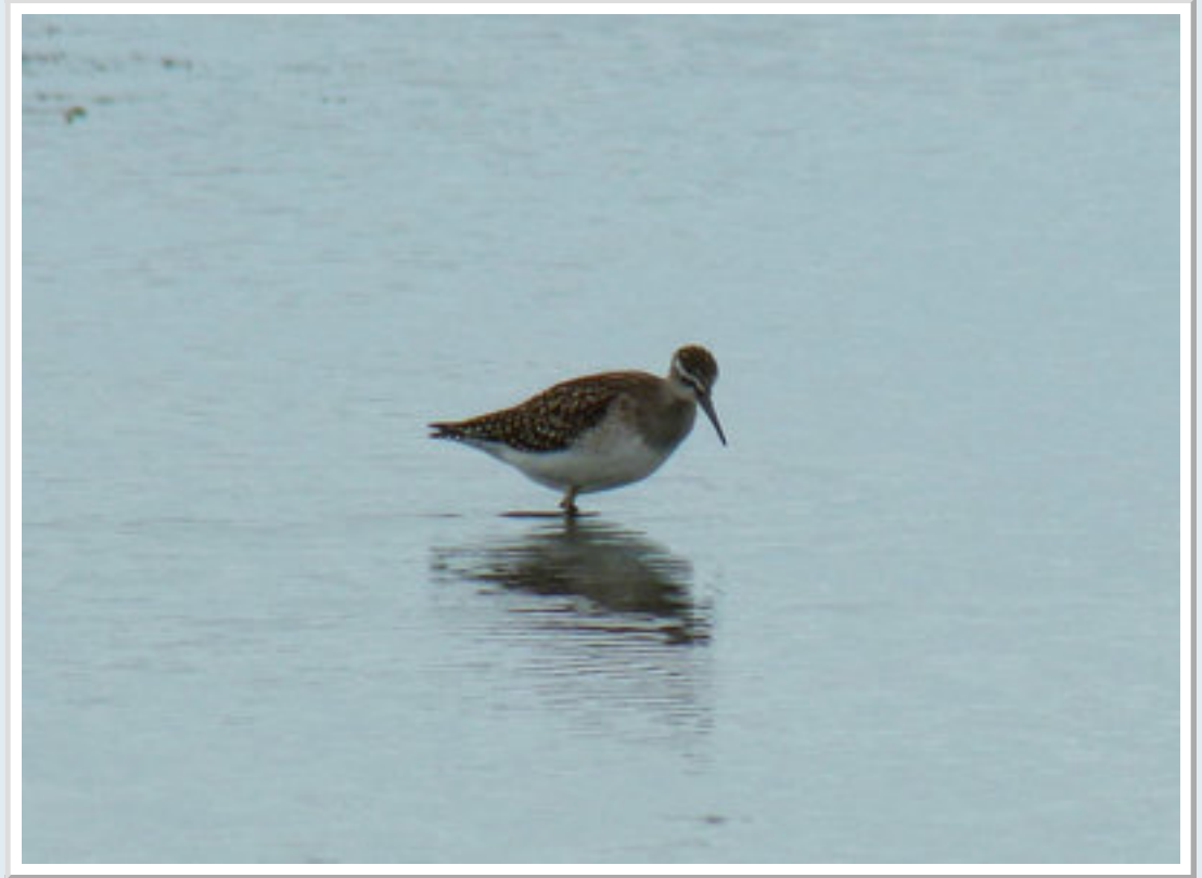
This juvenile Wood Sandpiper was present on the East Flood at Oare Marsh.