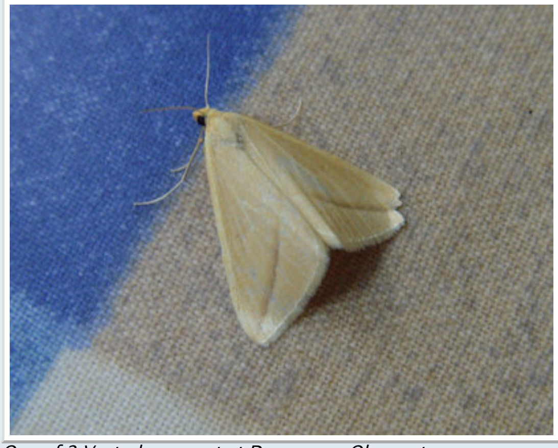
One of 2 Vestrals present at Dungeness Observatory.

Not a bad week although still no sign of any butterfly migration. Surely its too late in the year now.