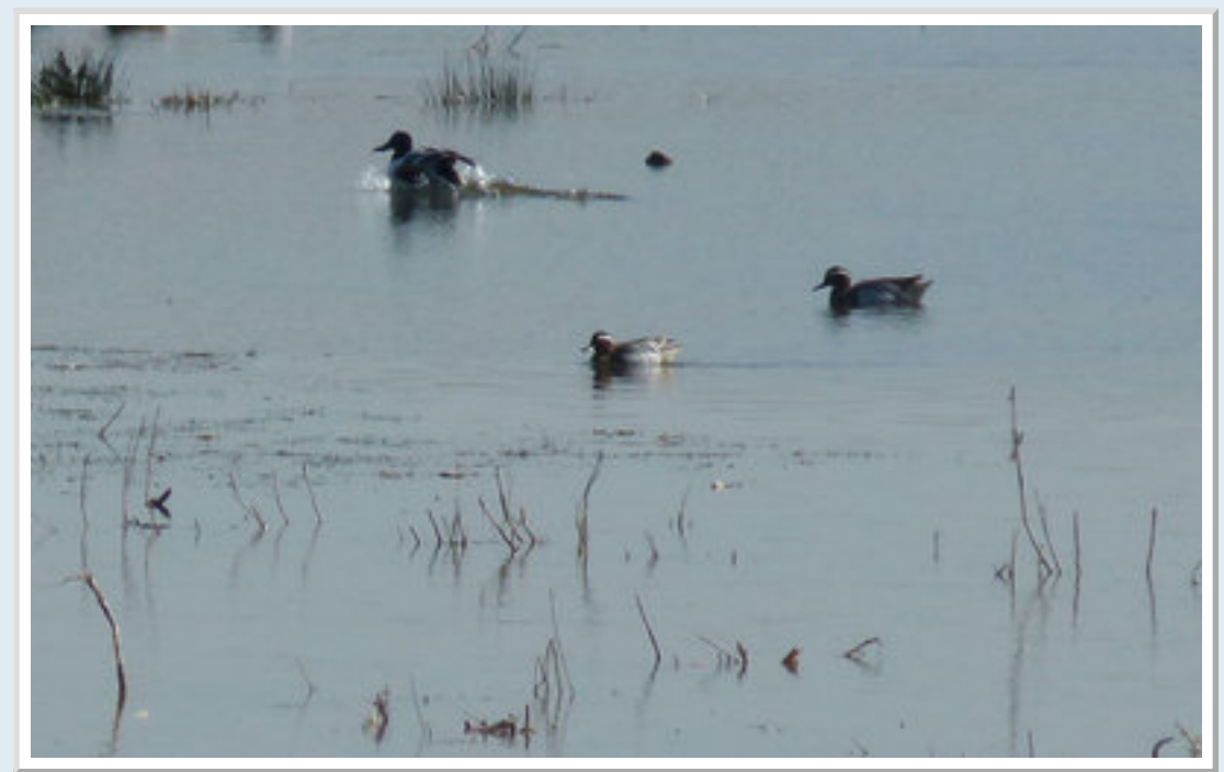
2 Male Gargeney present at Grove Ferry