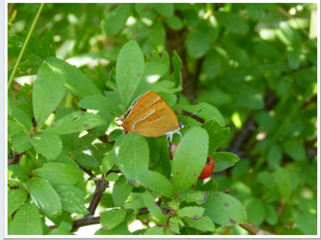
Brown Hairstreak at Steyning Rifle Range

Brown Hairstreak at Steyning Rifle Range. It was actually quite hard to photograph as it worked its way around the bush.