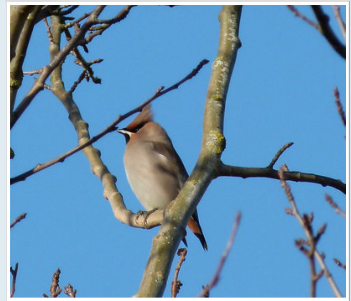
Waxwing at Johnsons Corner, Hamstreet.