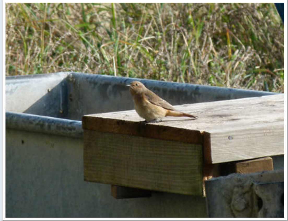
This late Redstart was present at Samphire Hoe.