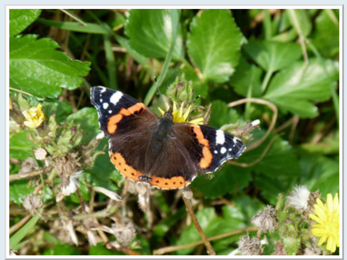
This late Red Admiral was at St Margarets, Kent.