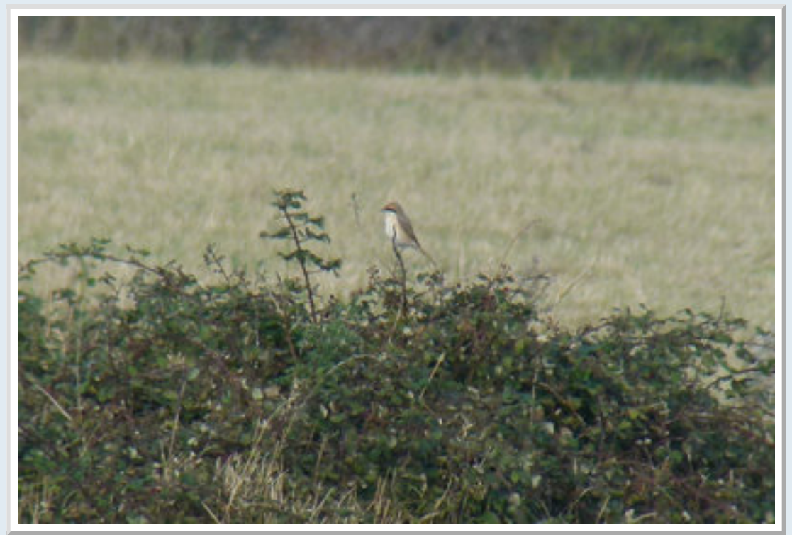
The male Daurian Shrike at Cliffe Pools last weekend.

Today we visited Reculver marshes and caught up with the Rough Legged Buzzard that had been present for a few days. It was quite distant and elusive but we had reasonable views in the morning. We discussed leaving and checking other locations but for some strange reason we carried on looking for migrants, then at 13.15 hrs we picked up a raptor over Minnis Bay. It was clearly a OSPREY and probably the latest we have ever seen. It then flew over Reculver Marsh at 13.20 hrs and headed inland towards Grove Ferry. It was time to track it. Not via the Roy Dennis tracking satellite system but the good old follow that bird in the car. We arrived at Grove Ferry at 13.45 hrs just in time to see it pass over, then over Stodmarsh at 13.50 hrs still heading south. Other birds at Reculver were Peregrine, Marsh Harrier and Sparrowhawk. In good weather we saw a Red Admiral and Large White plus a Migrant Darter and Common Darter. So not quite over yet.