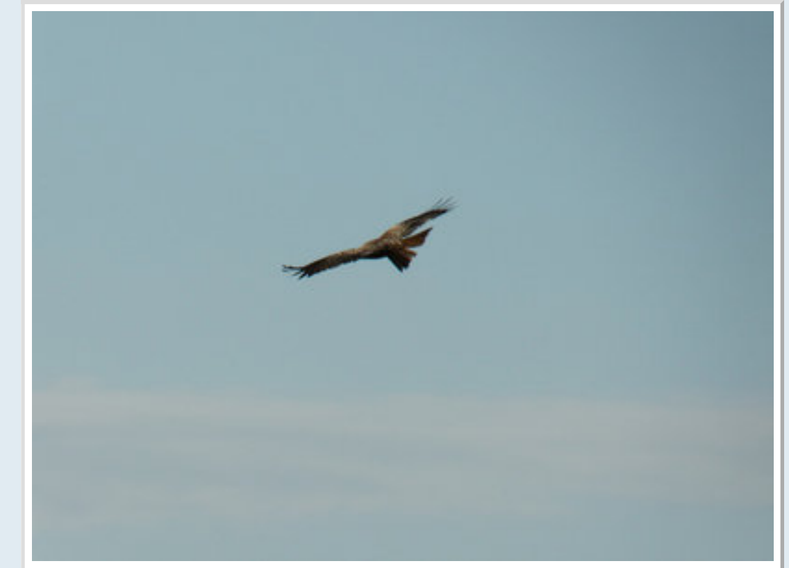
Not the best of photos, but one of the two present near Ashford. A beautiful bird and an increasing visitor to Kent.