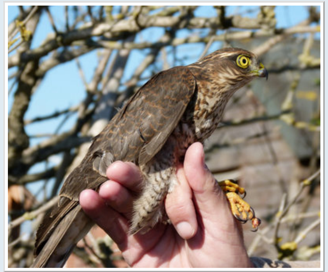
This Sparrowhawk was aged as a Young Male due to its in hand measurements

Another warm day with easterly winds so a visit to Dungeness was on the cards. We arrived at the Observatory just as they were about to release a PALLAS'S WARBLER in front of about 60 people. Its a few years since we have seen such a crowd there to witness this event. About half the crowd were visitors from the RSPB on one of their migration watch days. For many this must have been their first rarity and what better way than to see it close in the hand. This was supported by a fine Sparrowhawk and a number of Redpolls in a variety of different attire. Some of which were suggestive of Mealy (or Common) Redpoll with a fairly whiteish and lightly streaked rump. A Firecrest was seen in the moat and the PECTORAL SANDPIPER was on Hookers Pit. For a change the number of species of Butterflies seen increased with 2 Peacocks, 5 Red Admirals, Large White and 4 Speckled Woods. Another good period of nature watching.