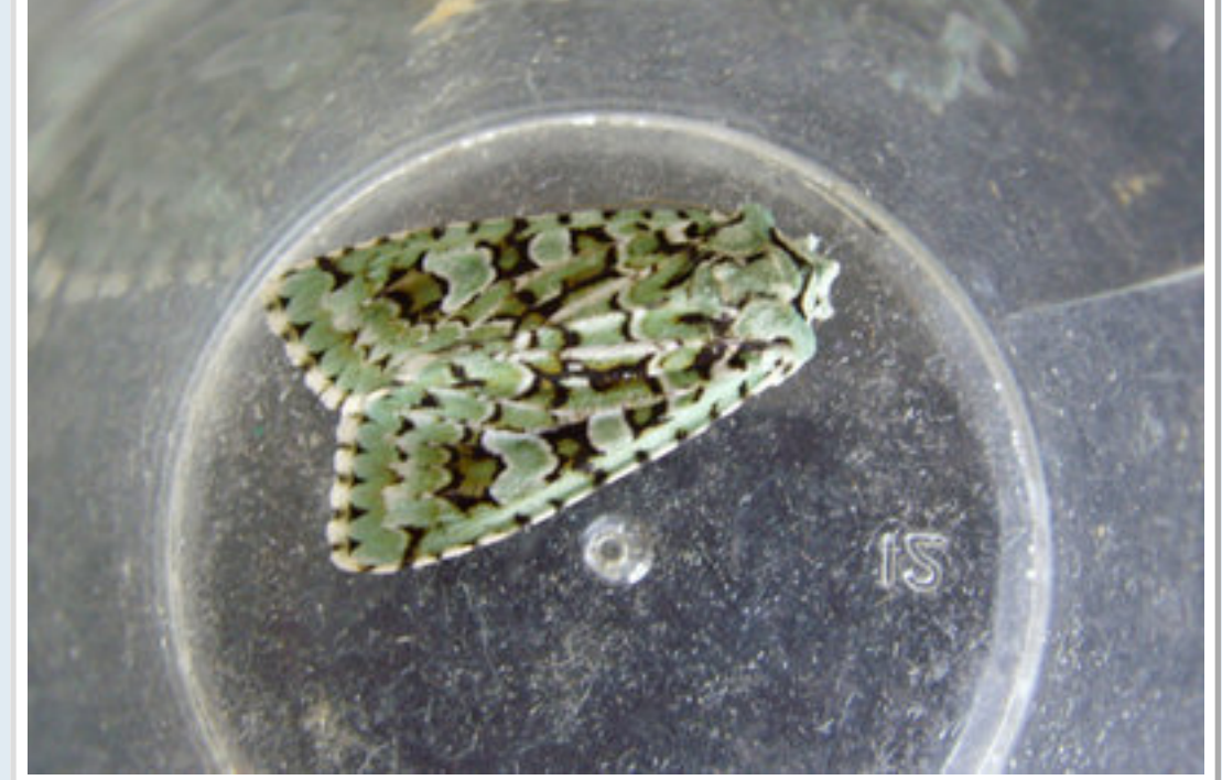
What a stunning moth the Melvelle du Jour moth is.