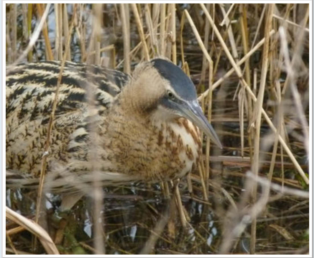
The best sighting we have had of a normally very shy bird.