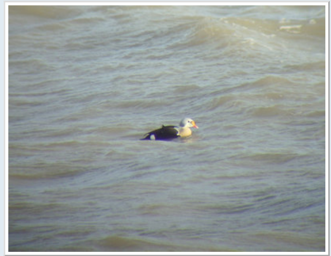
King Eider off Pett Level during January 2009.