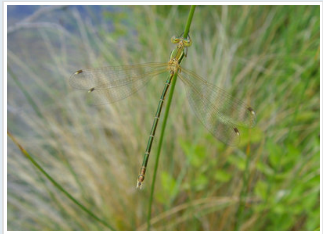
Southern Emerald Damselfly at Cliffe