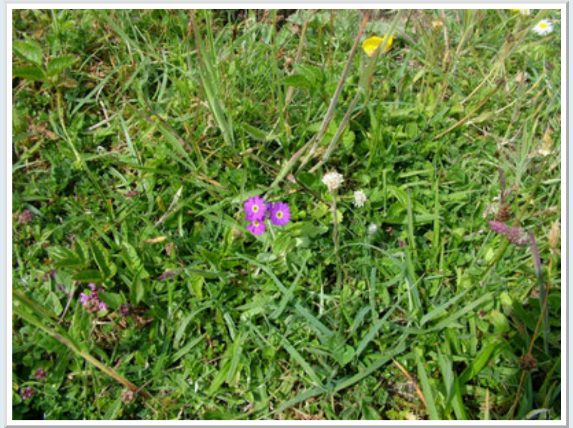
Scottish Primrose at Dunnet Bay in June 2006