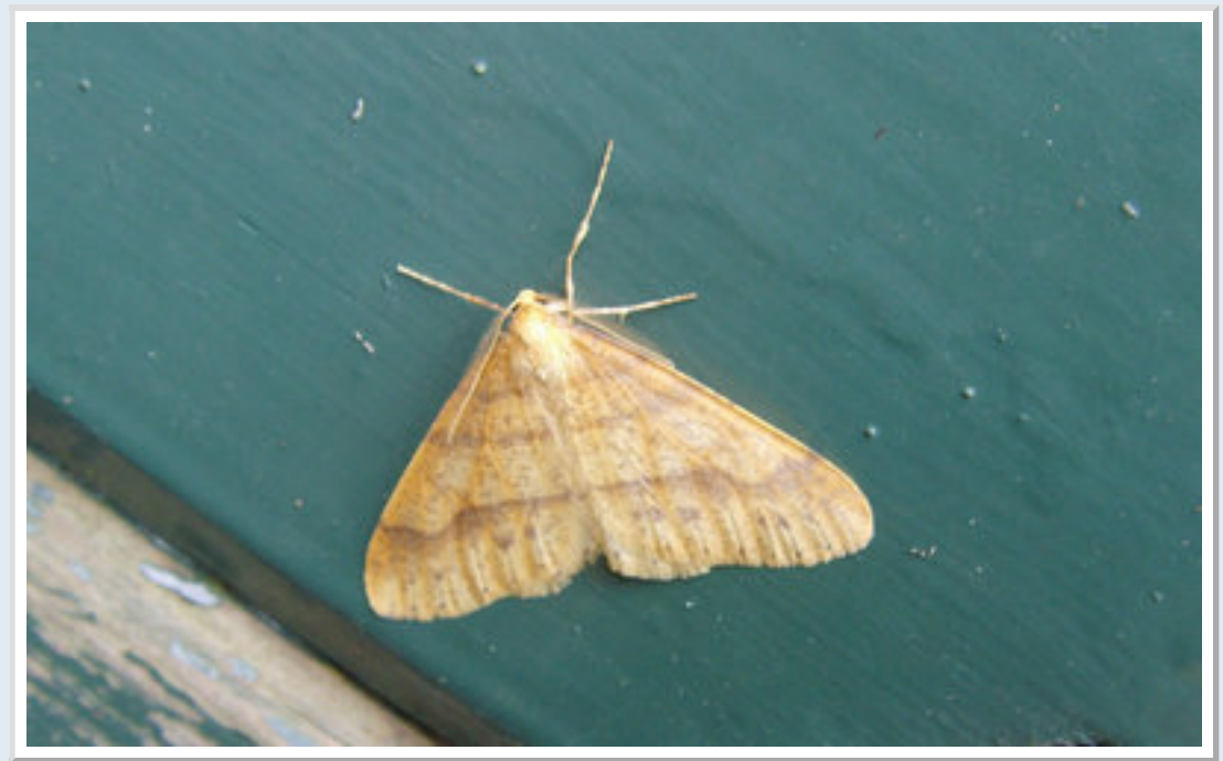
This is Scarce Umber. Not a rare moth but quite local, so nice to see.