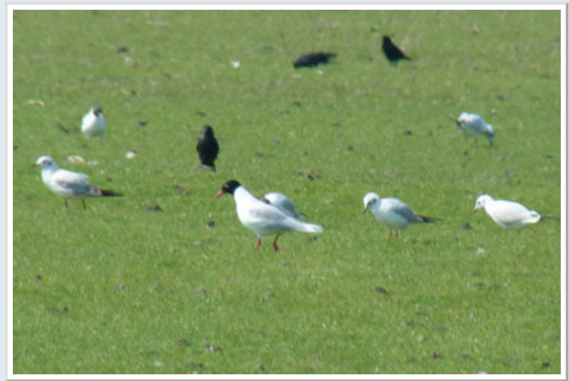
Med Gull @ Fairlfield.