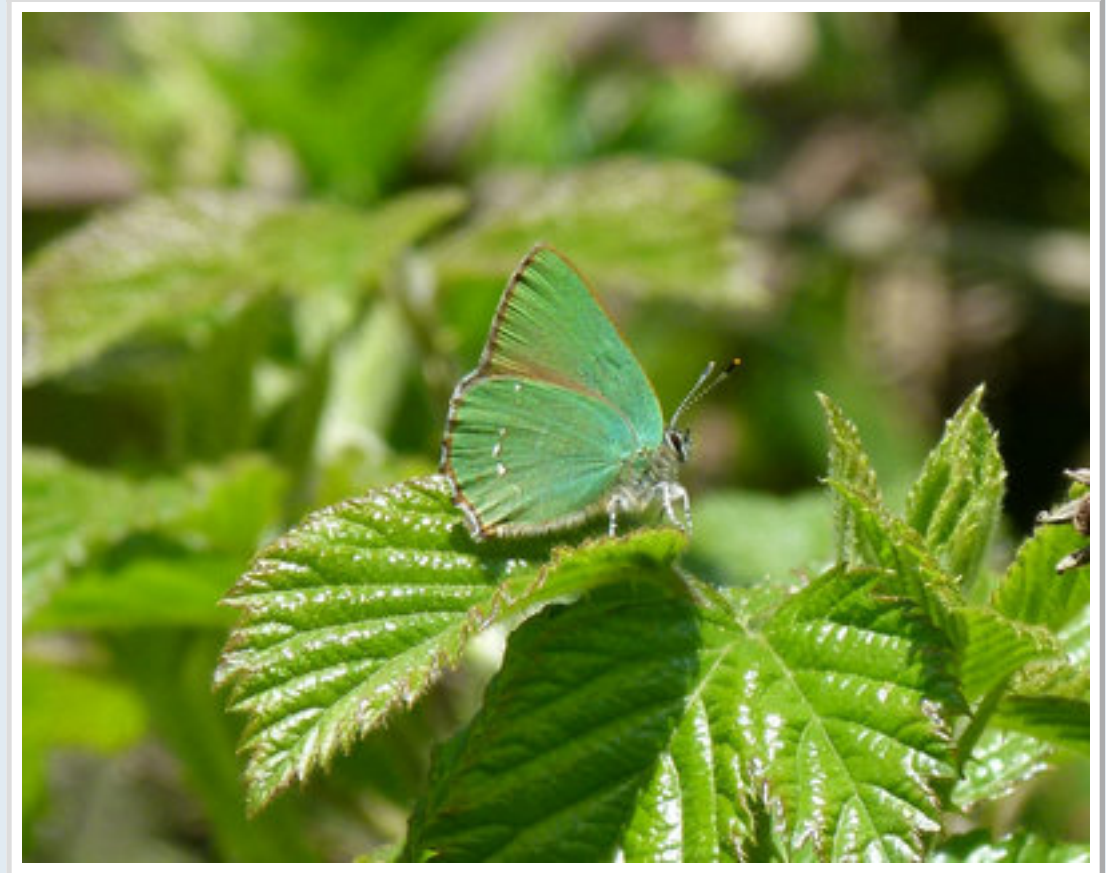
One of 6 Green Hairstreaks present. Our first of the year.