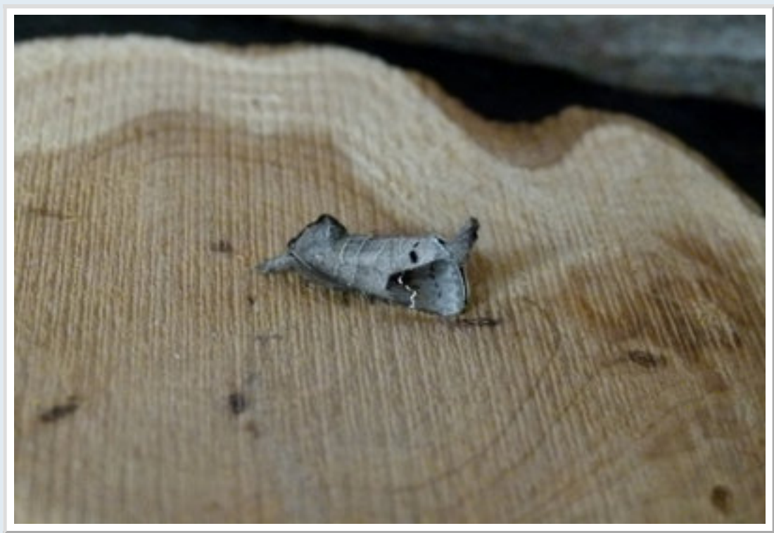
Scarce Chocolate Tip at Dungeness