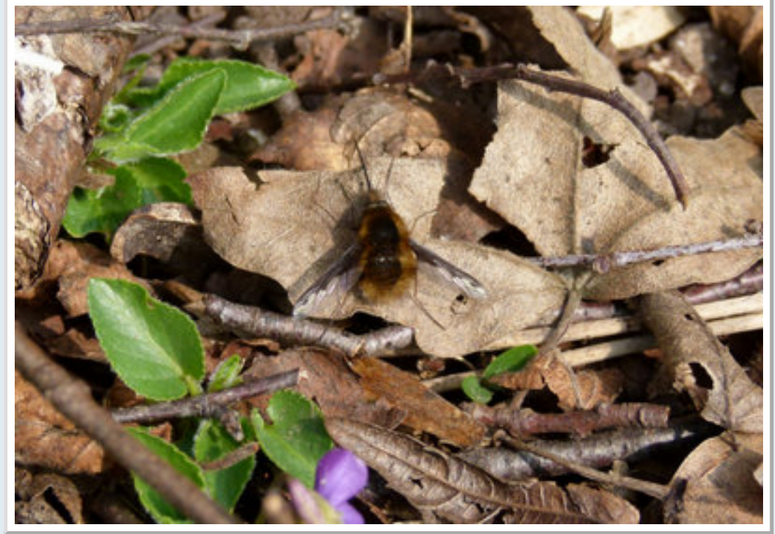
Beefly present in a local wood.