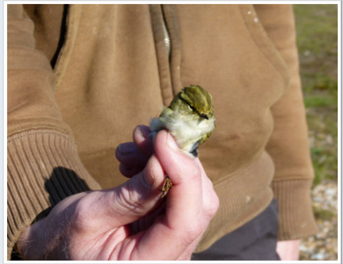
This was a very poorly defined Pallas's Warbler but still a cracking bird to see.