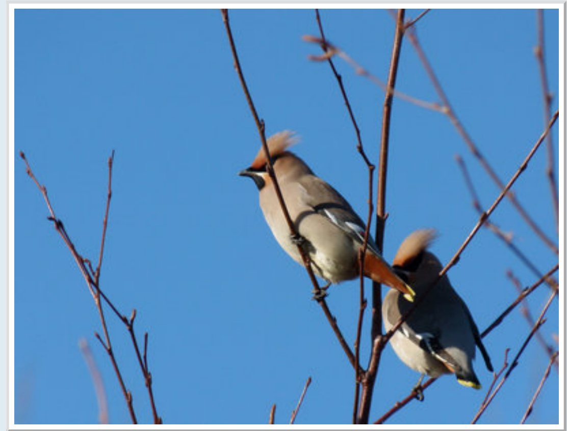
This Waxwing was one of 15 present in the Fowlmead CP car park.