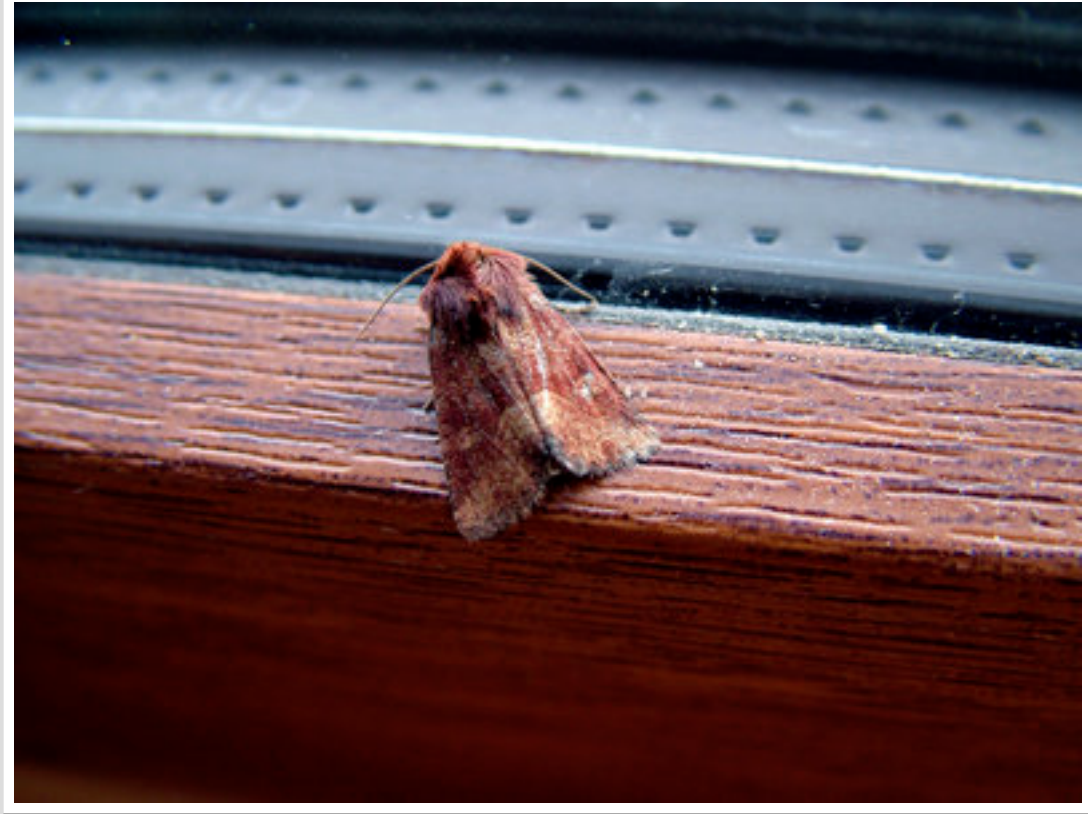
This photo of a Middle Barred Minor was taken in July 2006. Its colours were even better in real life.