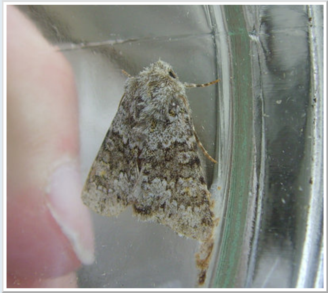
Small Ranunculus moth (garden moth trap)