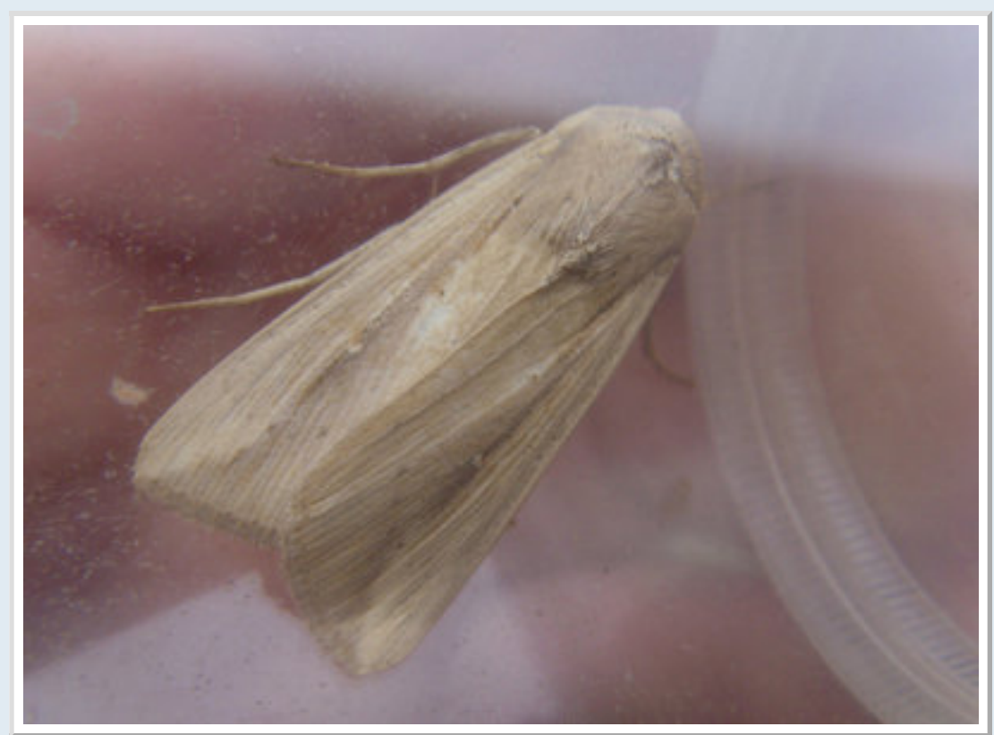
Cosmopolitan. This rare migrant moth was trapped at Dungeness Observatory.