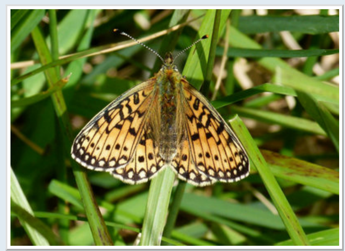
Small Pearl Bordered seen at Glenborrodale

Seen at Glenborrodale. Sorry, not a Scottish Crossbill just a Common.