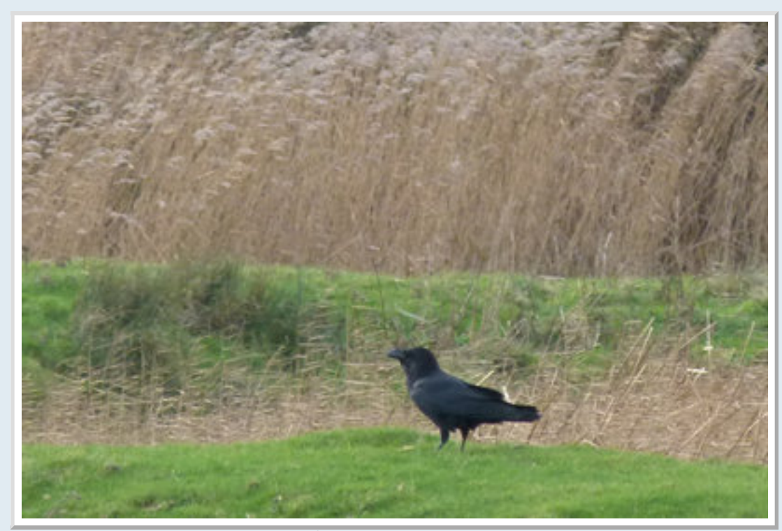
This Raven was seen briefly on Pett Level