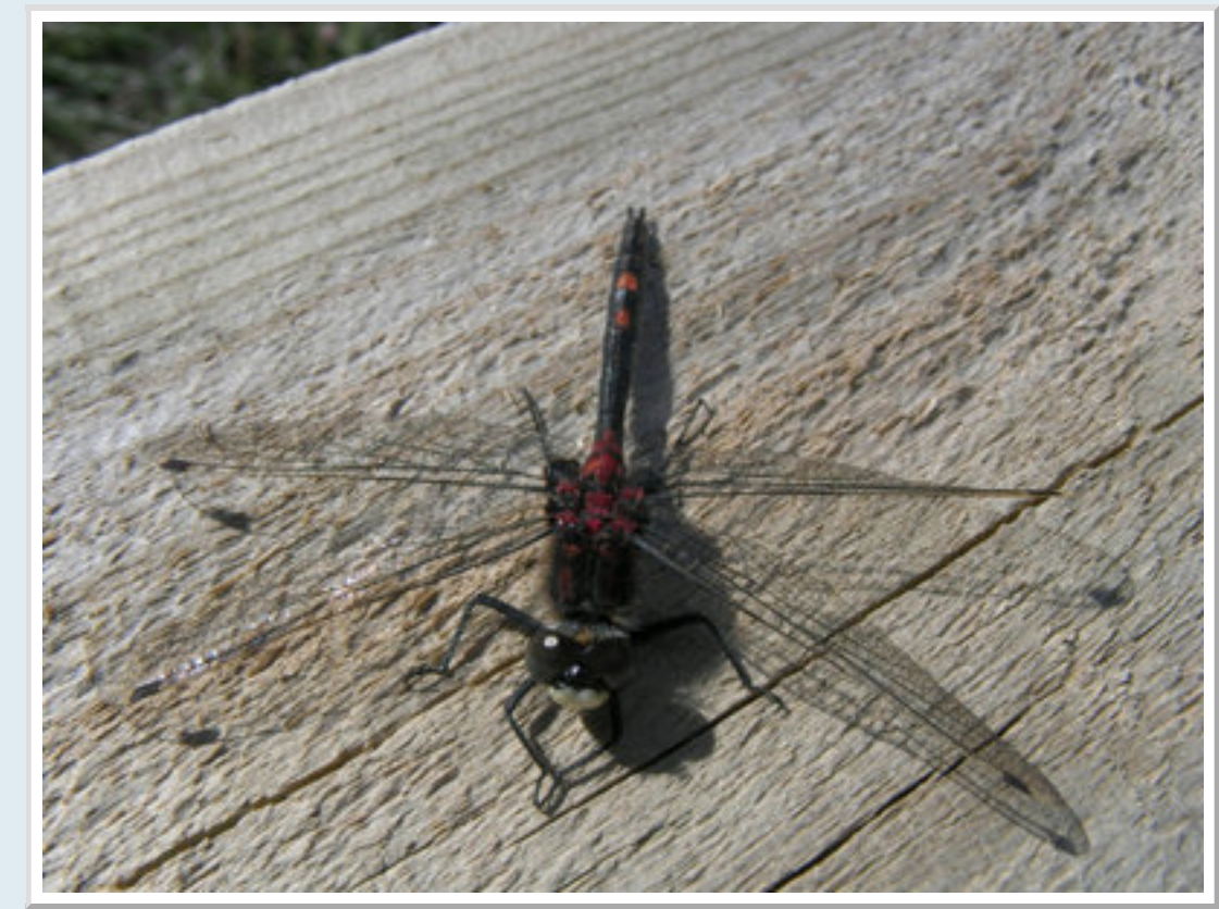
White Faced Darter on a small pool in Abernethy, June 2008