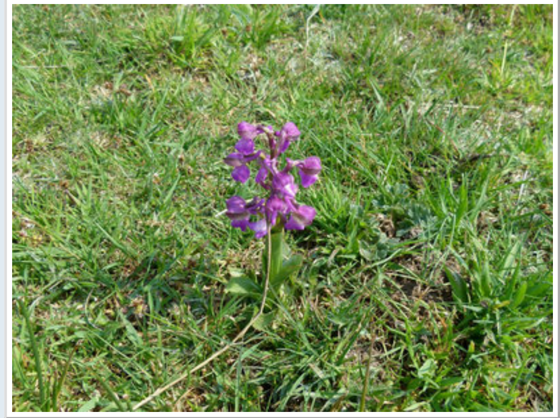
Green Winged Orchid on Walland Marsh