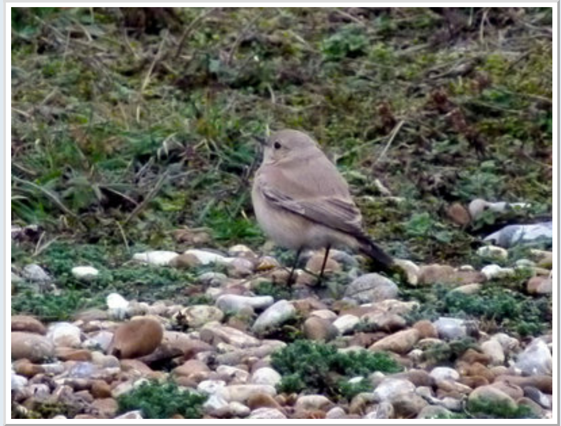
1st winter Desert Wheatear in the late afternoon gloom at Dungeness.