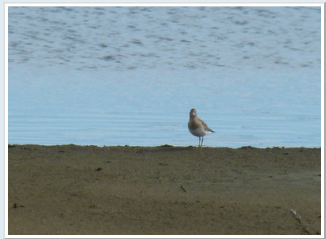
Record photo of the Pectoral Sandpiper on Dungeness RSPB