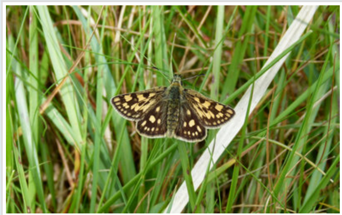
Chequered Skipper Seen at Ariundle Wood.

Overall the birdlife was great with many Grasshopper and Wood Warblers, with other goodies not normally seen by us here in the South East. I shall produce a full trip report later.