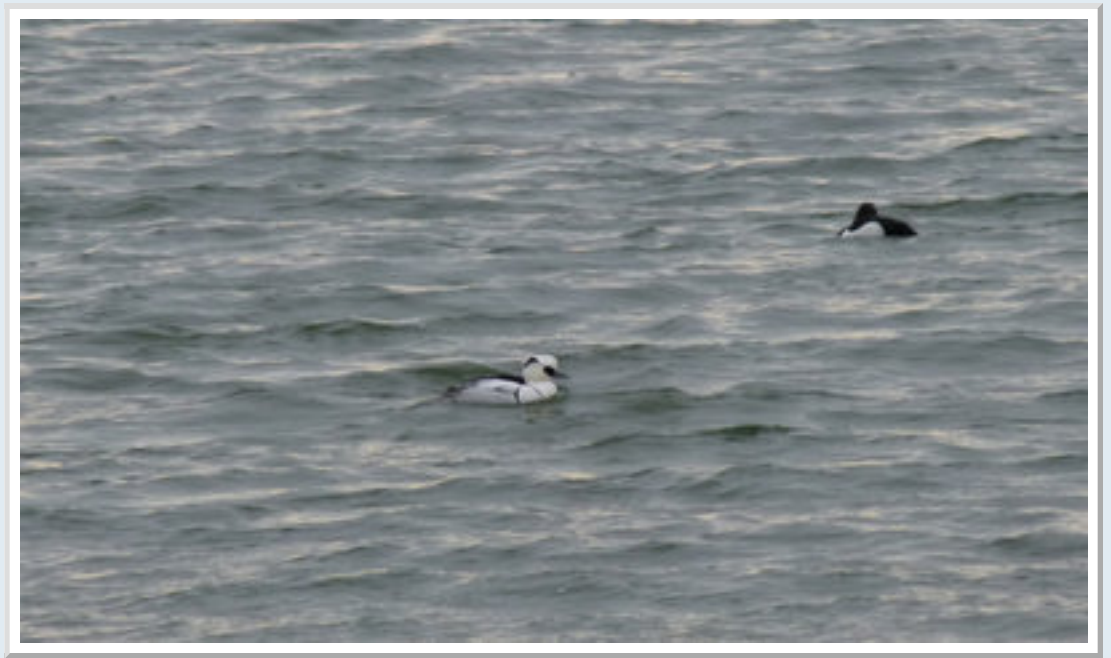
This stunning male Smew has been present at Dungeness for over two weeks.

Birdwise it has been a little harder this week with very little new on offer. On the 5th we visited Dungeness and saw 1 male and 6 female Smew, 2 Goldeneye, Little Egret, Marsh Harrier and 4 Ruddy Ducks (don't tell the RSPB- they allow Ruddy culling on the reserve). Pett Level produced Black Brant, 11 Pale and 25 Dark Bellied Brent Geese. 2 Ravens were present by the road and on the sea wall. On the 7th we did the Ashford area seeing 1 Long Eared Owl and 6 Common Buzzards with at least 400 Fieldfares in a orchard. The 8th saw the 1st winter Glaucous Gull again by the fishing boats at Dungeness and a Ringtail Hen Harrier around the reserve. 45 Bewick Swans and 100 plus Whitefronts were on Walland Marsh, but otherwise much the same as on previous visits. Today we saw a female Scaup in Dover Harbour (a scarce bird in Kent these days), 15 Waxwings in the car park at Fowlmead Country Park (near Deal), Sandwich Bay was very quiet so we ended the day at the Hawfinch site near Canterbury. Here we saw at least 7 birds in really nice weather for a change. Present today was a number of other well known Kent birders also enjoying the birds on offer. Hawfinch is an increasingly scarce bird in Kent. The well known Kent hot spot at Bedgebury no longer attracts the Hawfinch in the numbers of the eighties when it was possible to see 50 plus.