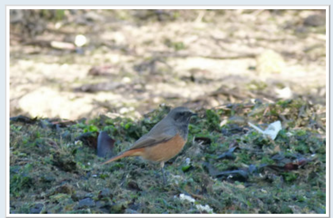
This very attractive Eastern Black Redstart was enjoying the sunshine on Margate beach.