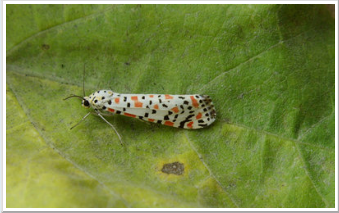
Crimson Speckled at Dungeness. What a good looking moth.