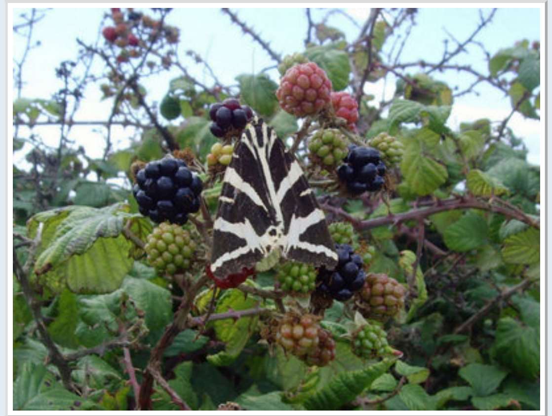
This rare for Kent, Jersey Tiger Moth, was present for the afternoon on the RSPB.