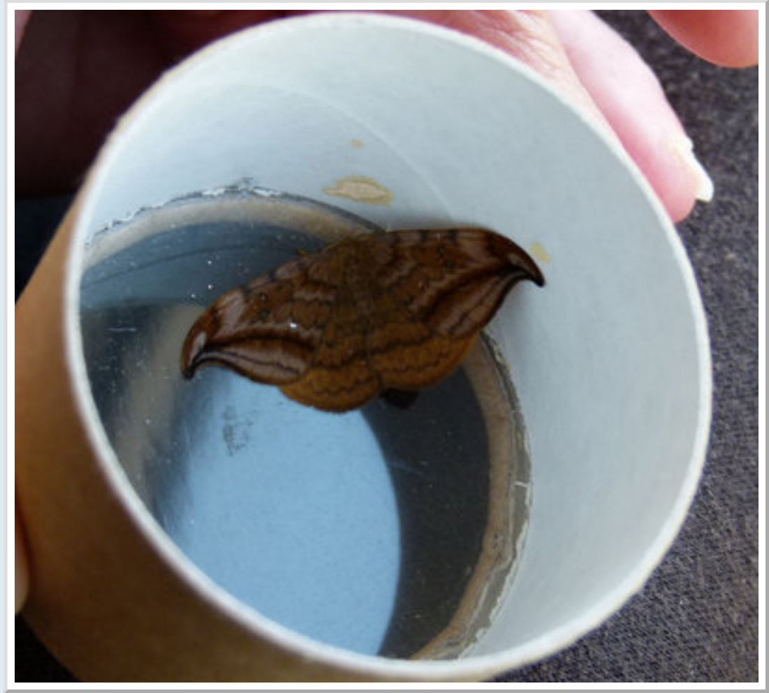
The photo probably does not do this Dusky Hooktip moth justice. It had been trapped overnight in a Dungeness private garden but was available for viewing thanks to the finder.