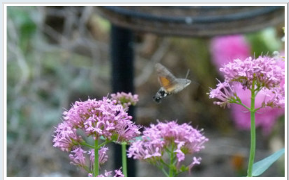
A poor quality photo, but the best I could get of the very active Hummingbird Hawkmoth