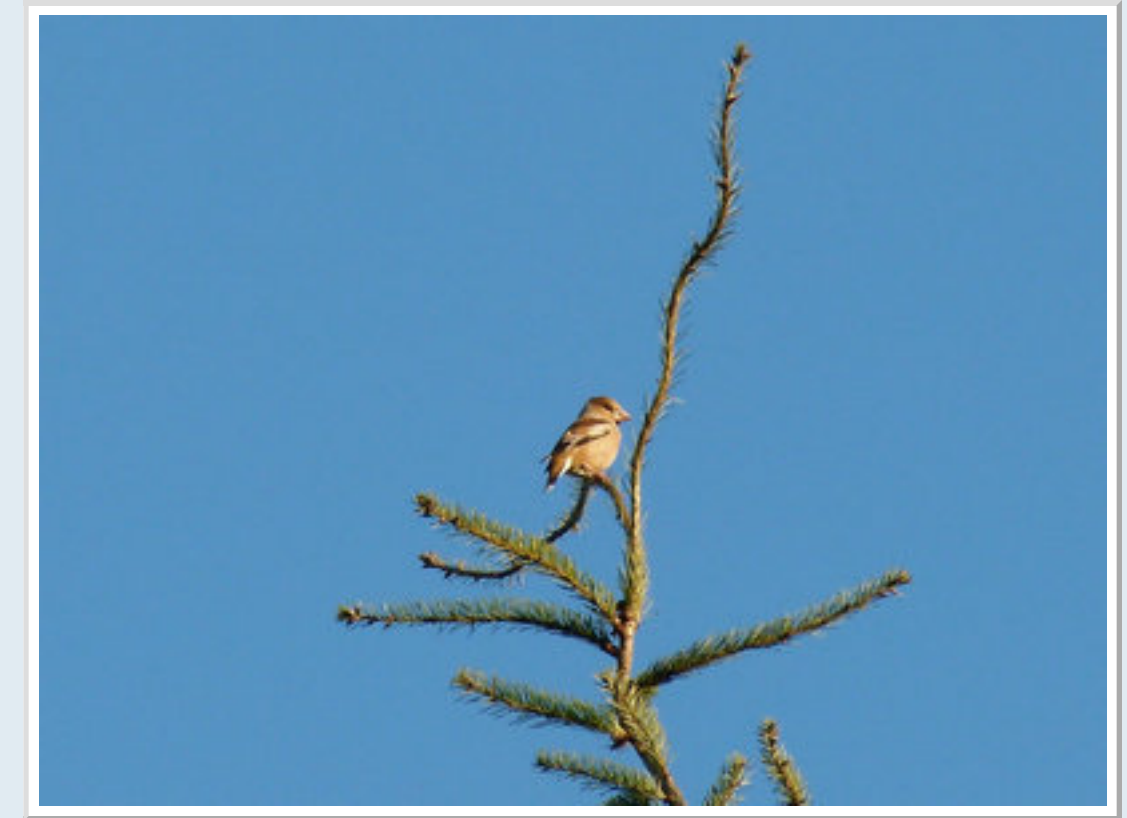
This bird sat on top of a distant tall conifer for all to see but almost at the maximum range for my small camera.