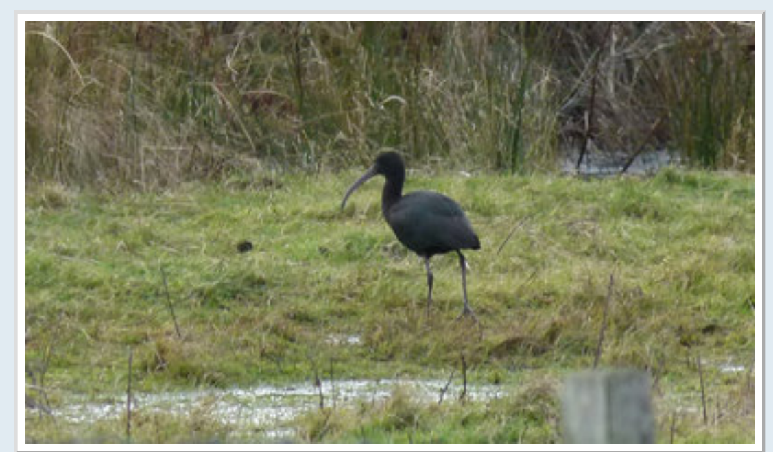
This Glossy Ibis was a surprise visitor in the field to the right of the RSPB entrance track