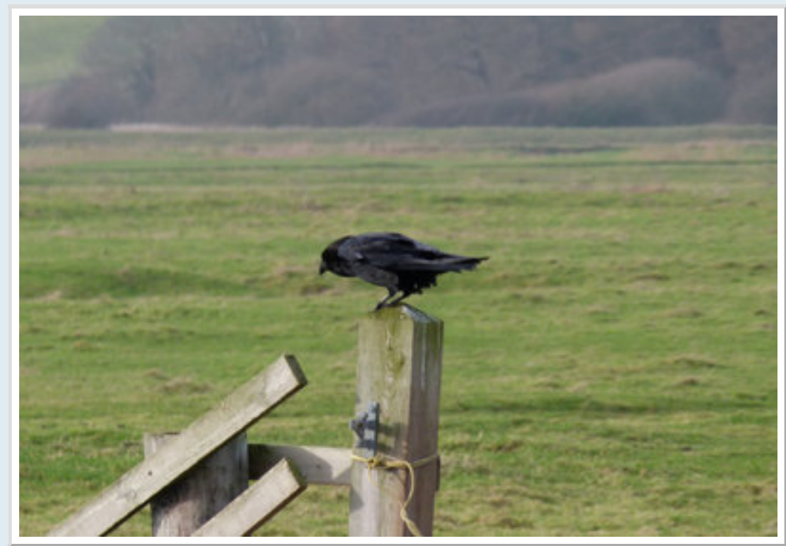
This bird was one of the pair close to the main road along Pett Level (Sussex).