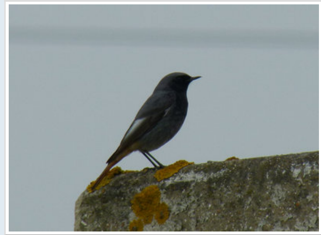
One of the male Black Restarts present at Dungness