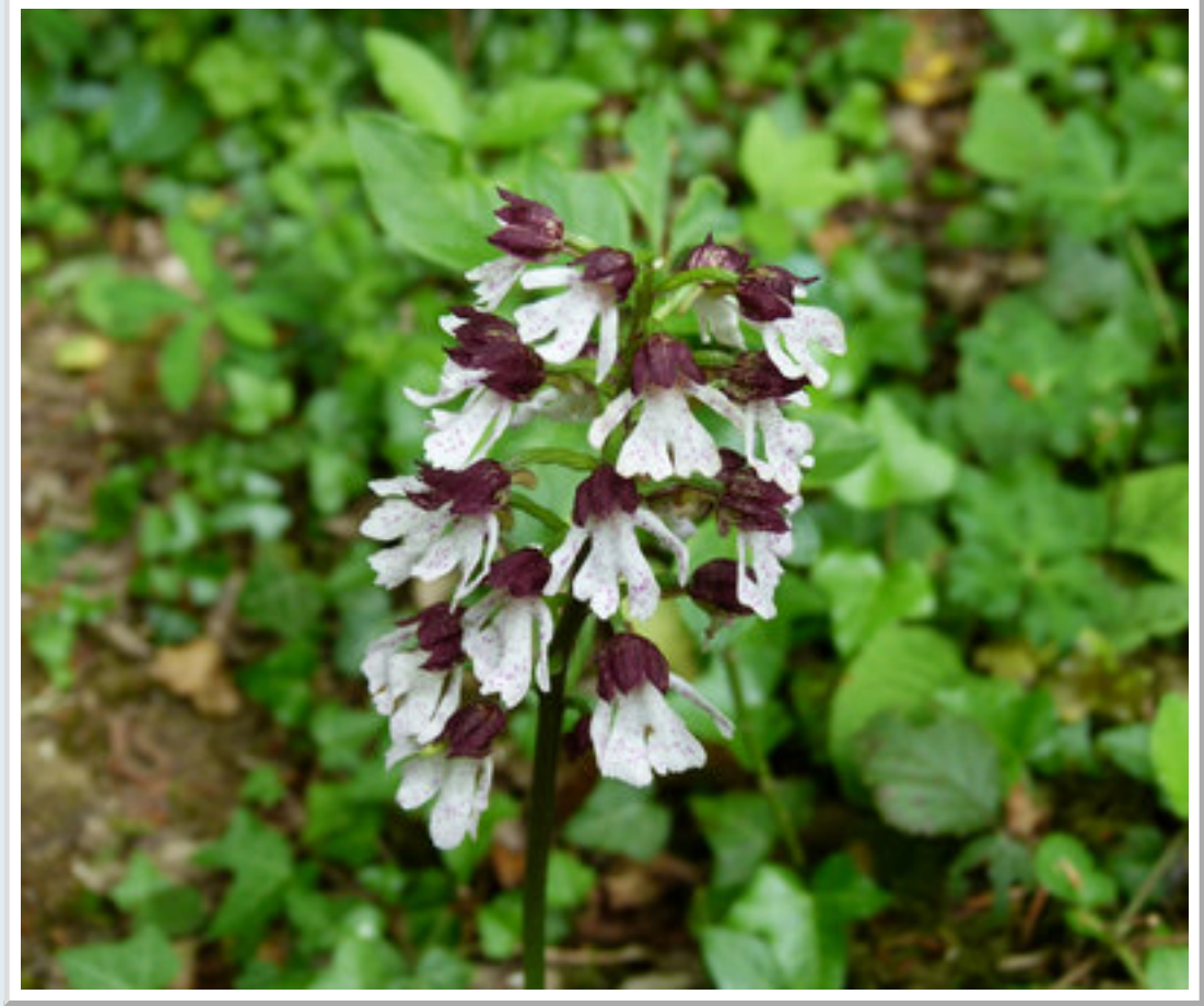
Lady Orchid at Yocklets Bank