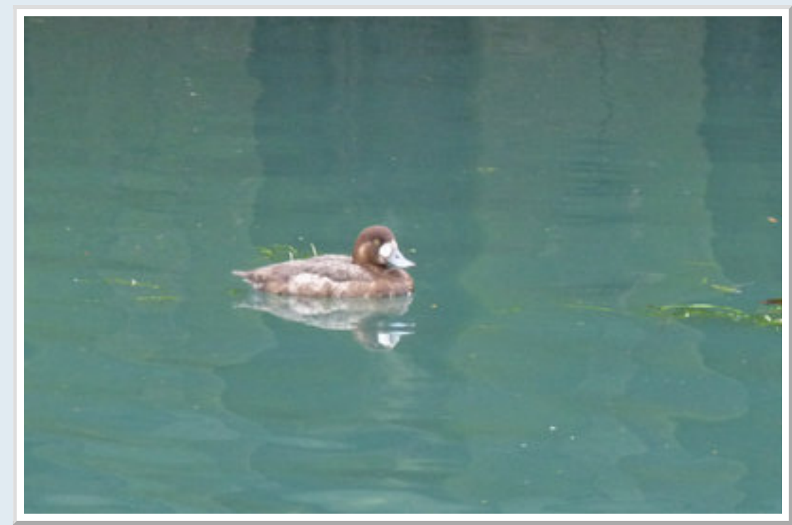
This female Scaup is enjoying an extended stay in Dover Docks