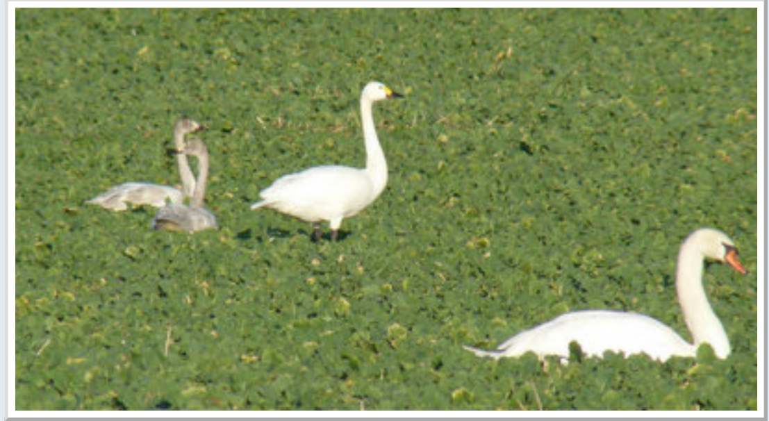
One of the two adult Bewick Swans with their young near Wye.