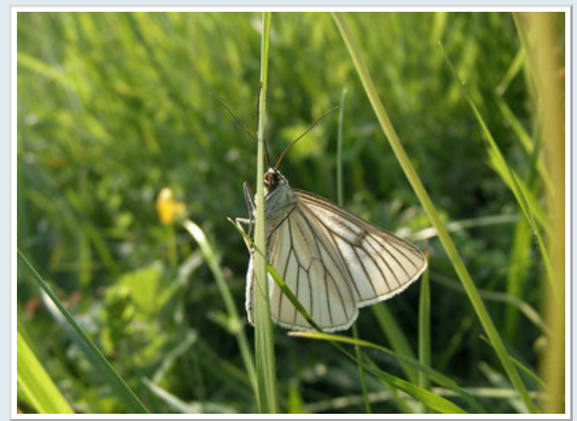
Black-veined Moth at a location near Wye