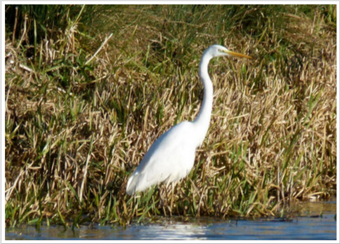
This is one of the Great White Egrets at Hamstreet along the Military Canal.