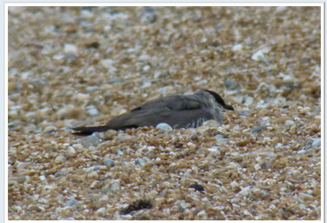
Long Tailed Skua (Second Summer) Dungeness beach by the fishing boats