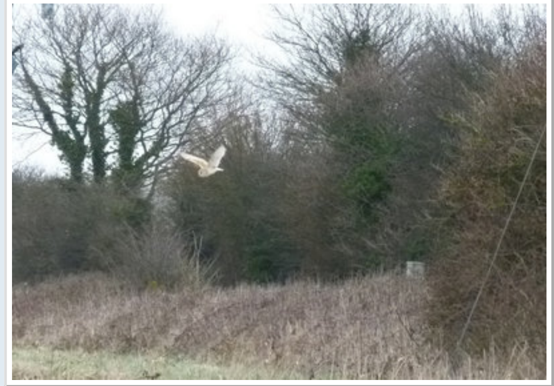
This distant Barn Owl was hunting along the railway line at Winchelsea during the middle of the day.