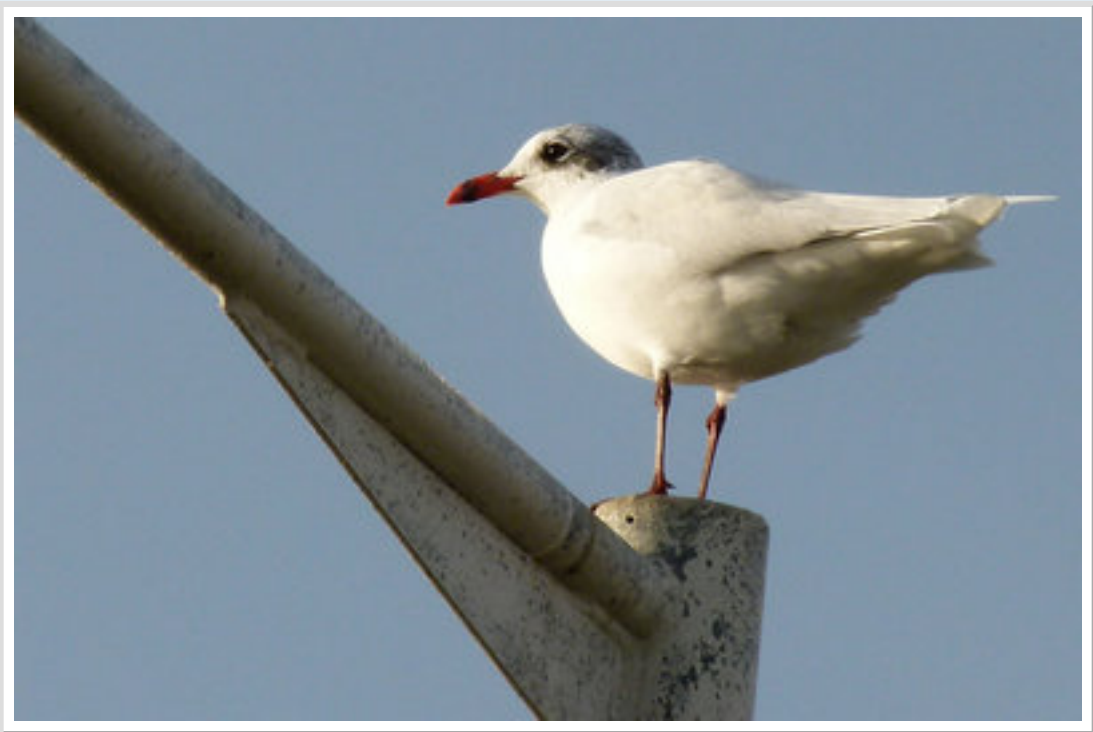
The Gulls at Copt Point like to sit on the street lighting or wander around grass playing field.