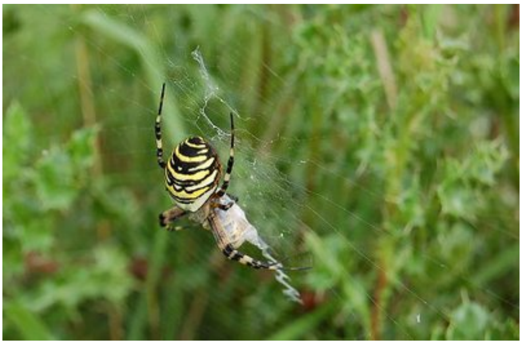
Wasp Spider at Vange....a real brute of a spider