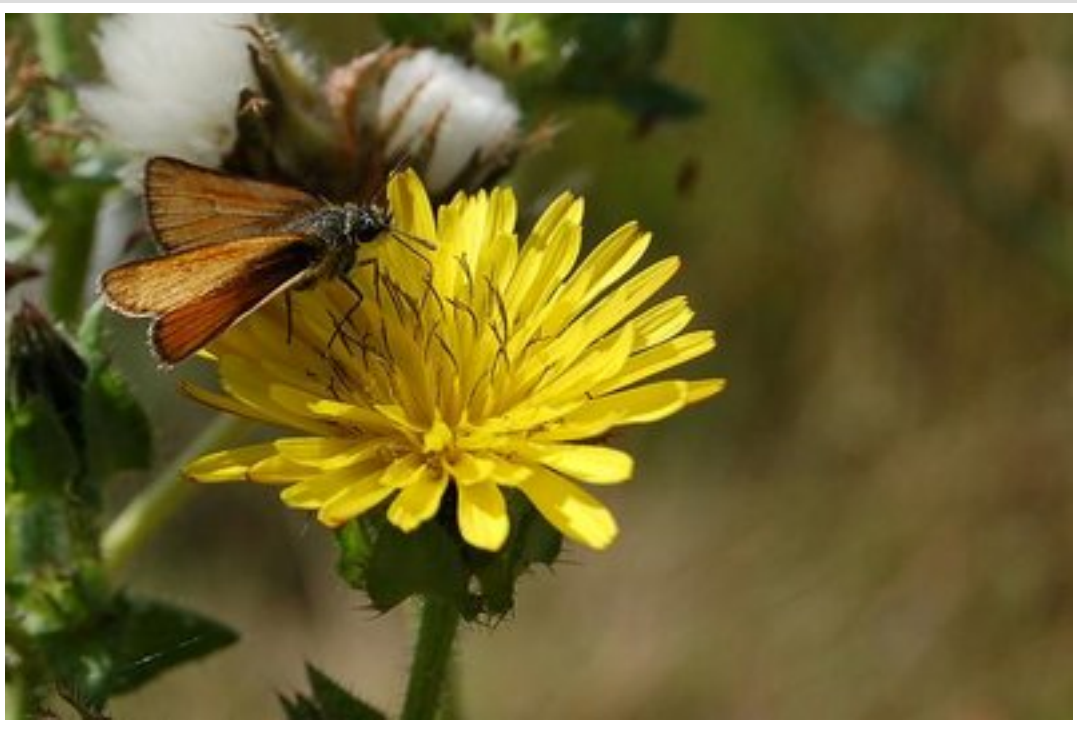
Small Skipper i think...put me right guys if i'm wrong

Another early birding trip..down to Cliffe Pools (Kent) first thing and it was freezing....well really cold anyway. Good birding with Greenshank/Redshank/Ruff/Avocet etc all showing well. Only caught a few whites/small heath and red admiral there.(Also took the picture below of what i think is a gatekeeper but it was tiny and at the time looked like and behaved like a small heath) Moved on to Tilbury Fort and caught a few Dunlin and ringed plover there with a single wheatear. (Not great timing today as the tide was just about in when I arrived) As for butterflies I picked up more whites, small heaths and red admirals along with the single skipper pictured which i'm guessing is a small. Rain stopped play again....Still i'm told September is the new August and i have two weeks off so here's to getting a little sun sometime soon.