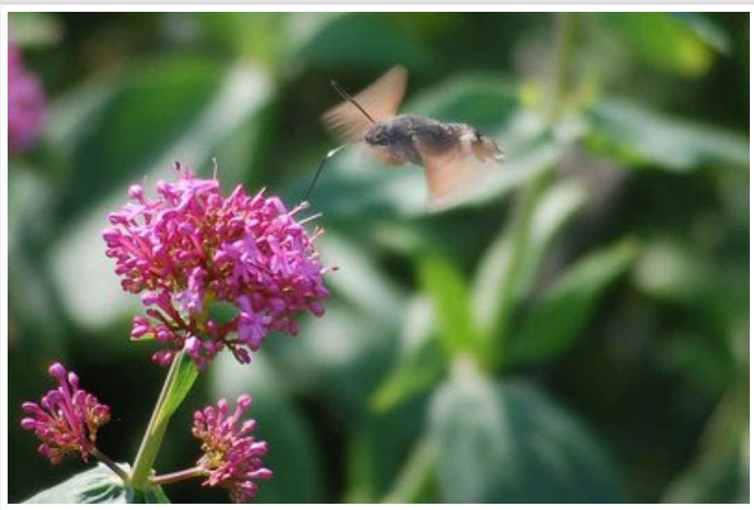
Hummingbird Hawk Moth