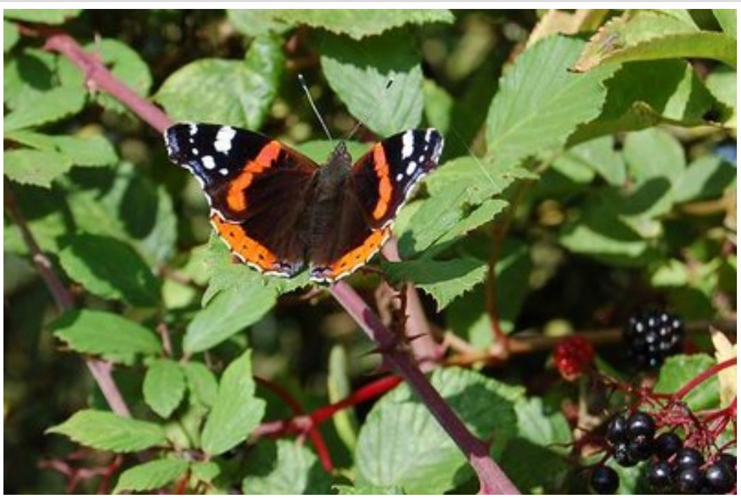
Red Admiral at Cliffe