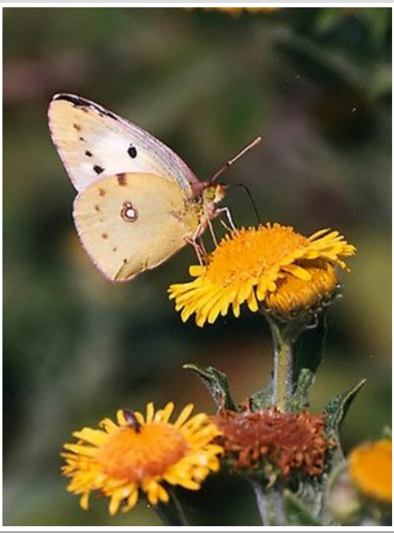
helice form - Tyneham, Dorset - Aug.96