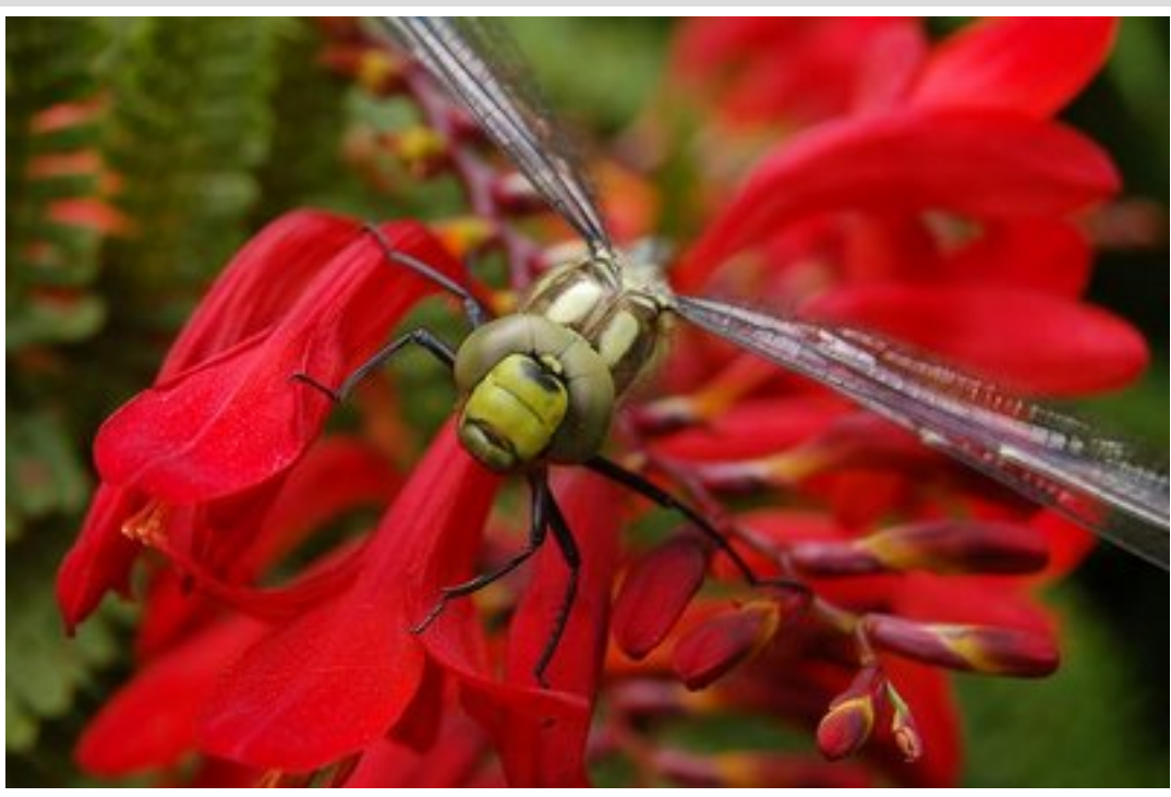
Southern Hawker in the garden...nice to have these guys visit the garden