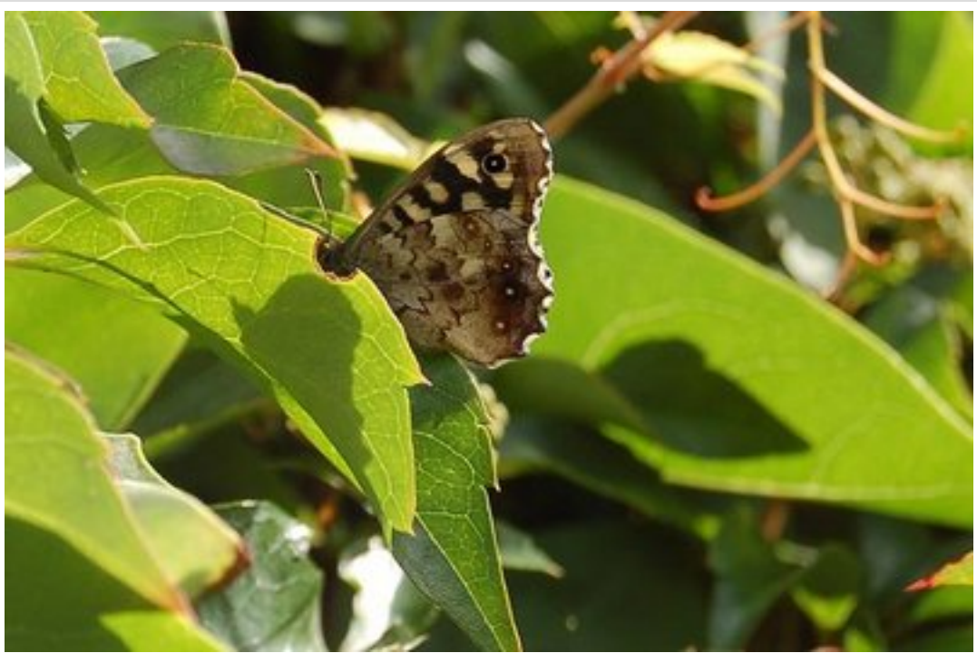
Speckled Wood in the garden