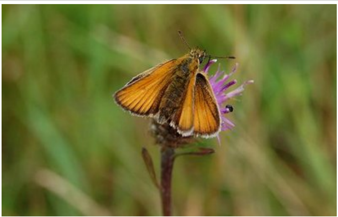
Small Skipper i think.....loads of these down at Vange Marsh