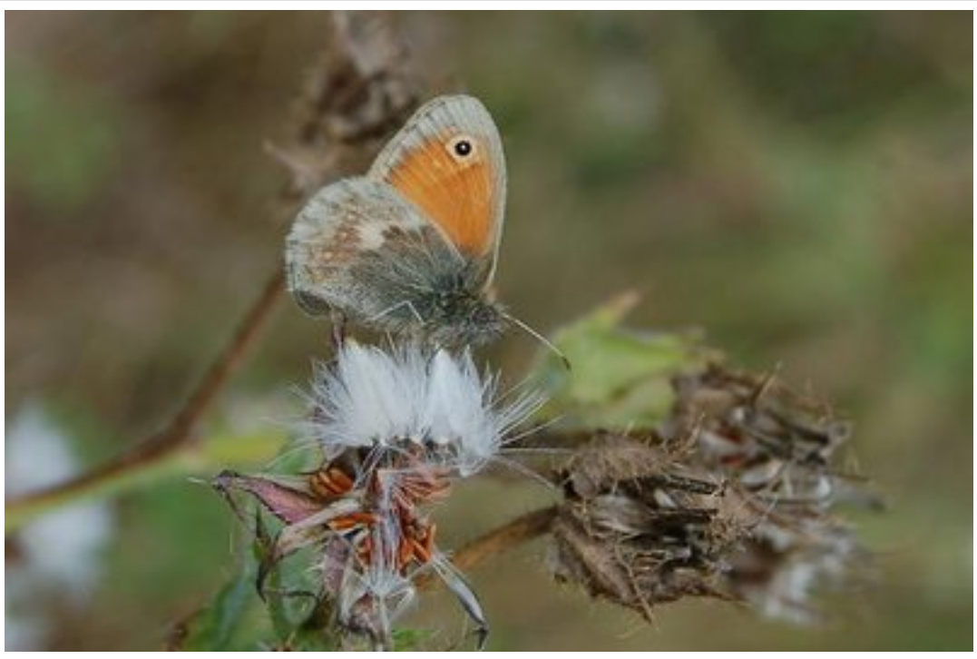
Small Heath Tilbury