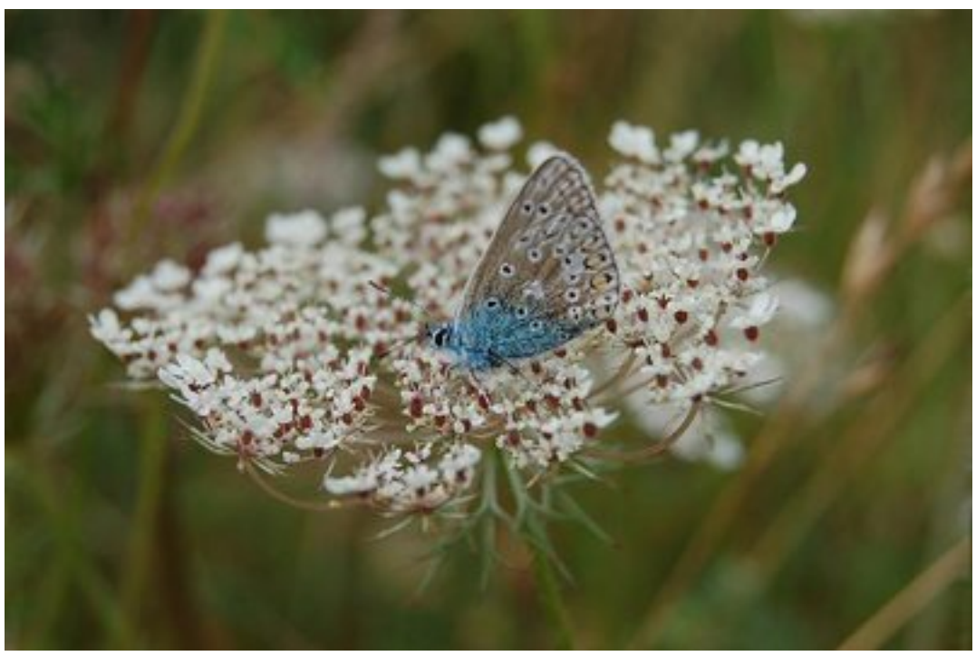
I think this is a common blue..saw 2 at Vange