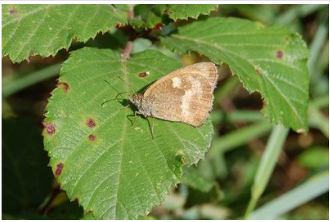
Think this is a very small gatekeeper