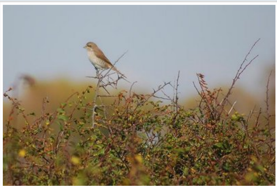
Red Backed Shrike

Took the wife and dog to Frinton today...The Red Backed Shrike showed well and allowed a record shot. The wife now thinks birding is easy, you just turn up take a short walk in the sun and the the bird sits in the open twenty feet away for you to see it. (She hasn't eperienced the 6mile walk to Blakeny point in the rain yet!) Nice day in good weather and the dog loved the run in the sea as she always does. Despite the good weather we only had a few whites flying which was dissapointing but with a good week forecast i'll have to see if i can get out and do what i enjoy...Walking and looking at what's there to be seen and stick to my motto...."if you get out you'll see more than if you don't"