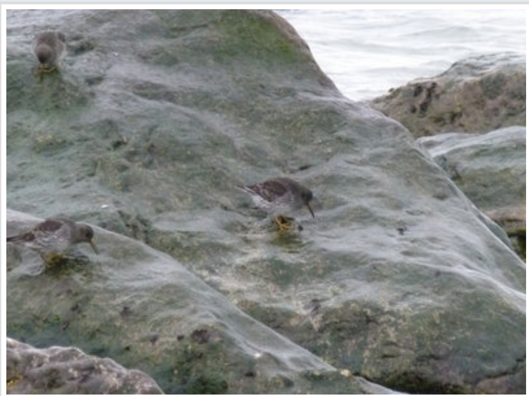
Distant photo of the Purple Sandpipers at Hythe.