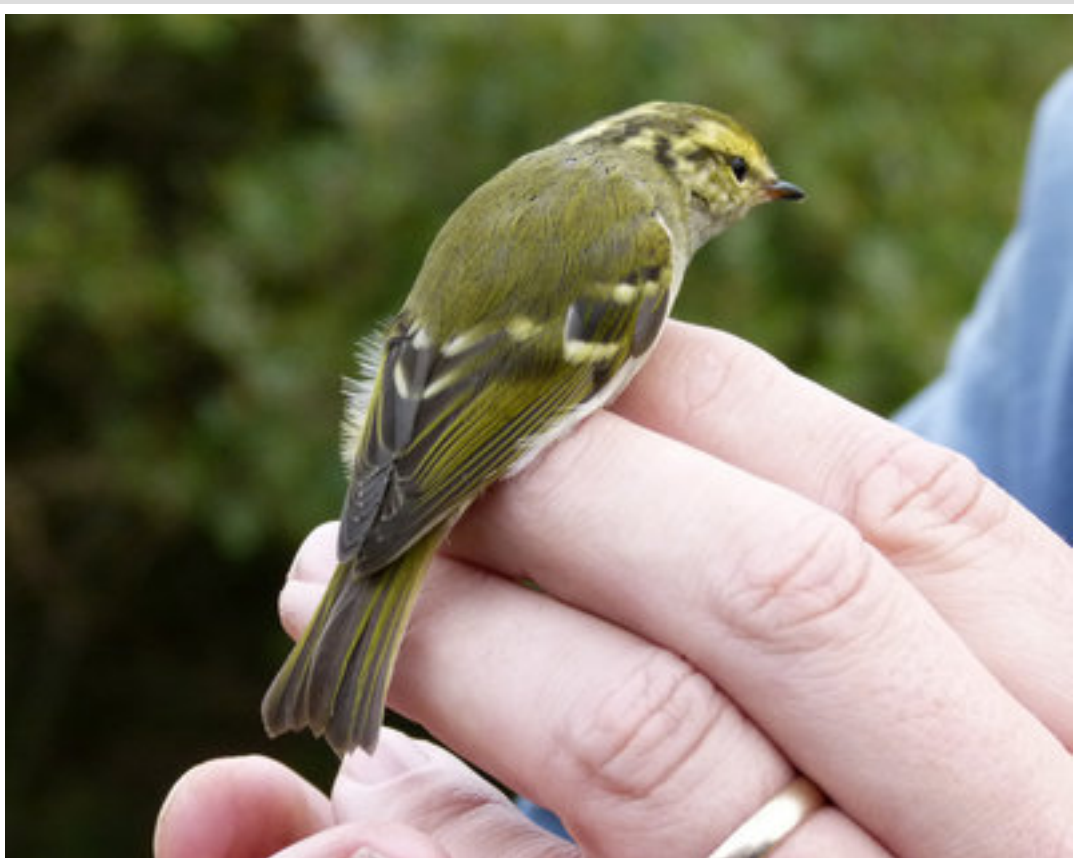
This very smart Pallas's Warbler was trapped and ringed whilst we were visiting the observatory (18 Oct 2010).