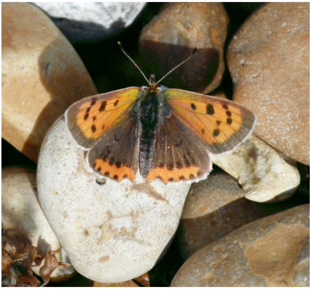
Small Copper at Dungeness soaking up the little sun on offer.