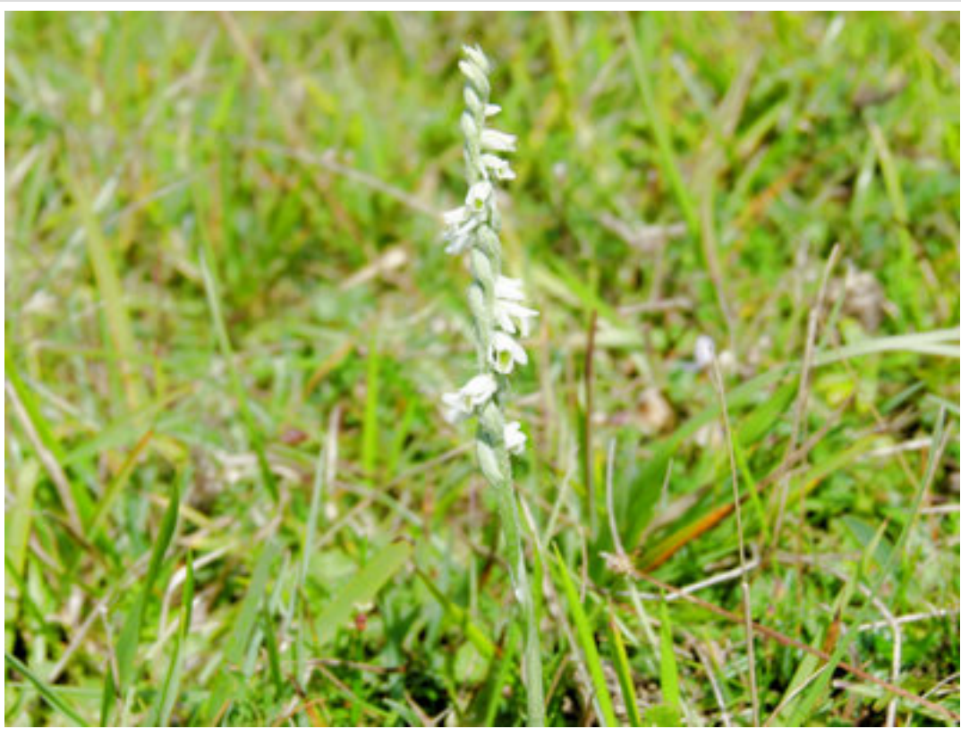
Autumn Ladies Tresses at Lydden