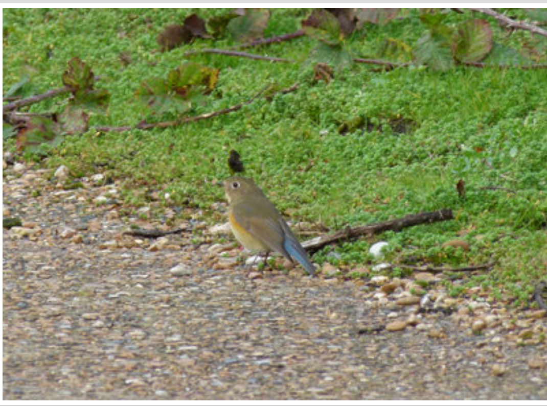
Red Flanked Bluetail along Dengemarsh Road at Dungeness. A first for the Dungeness area.