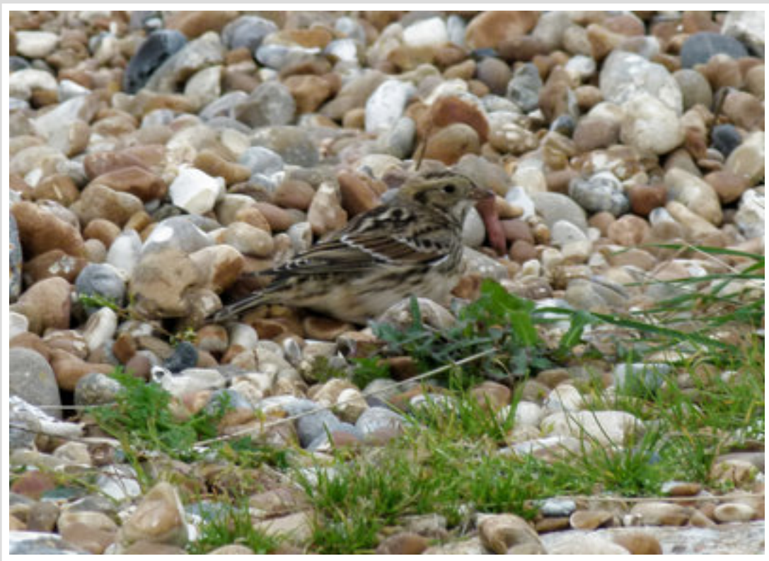
Lapland Bunting keeping low in the strong wind