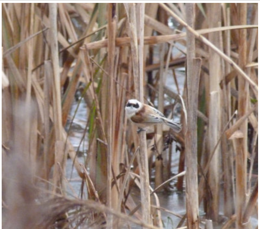
Penduline Tit in front of Hanson Hide, Dungeness RSPB