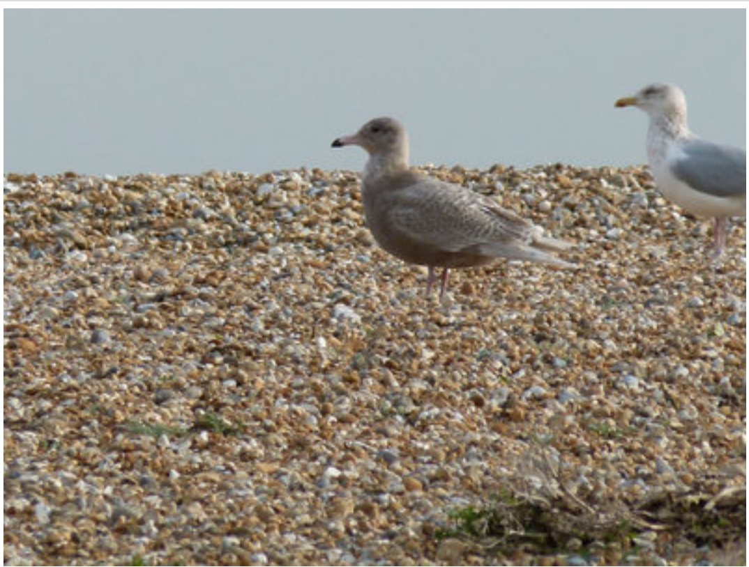
This 1st winter enjoyed the area of beach around the fishing boats. Notice the missing tail.