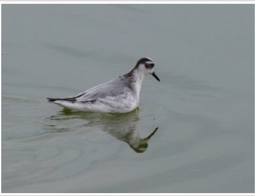
This is the Grey Phalarope that spent the day at Scotney Gravel Pits near Lydd.