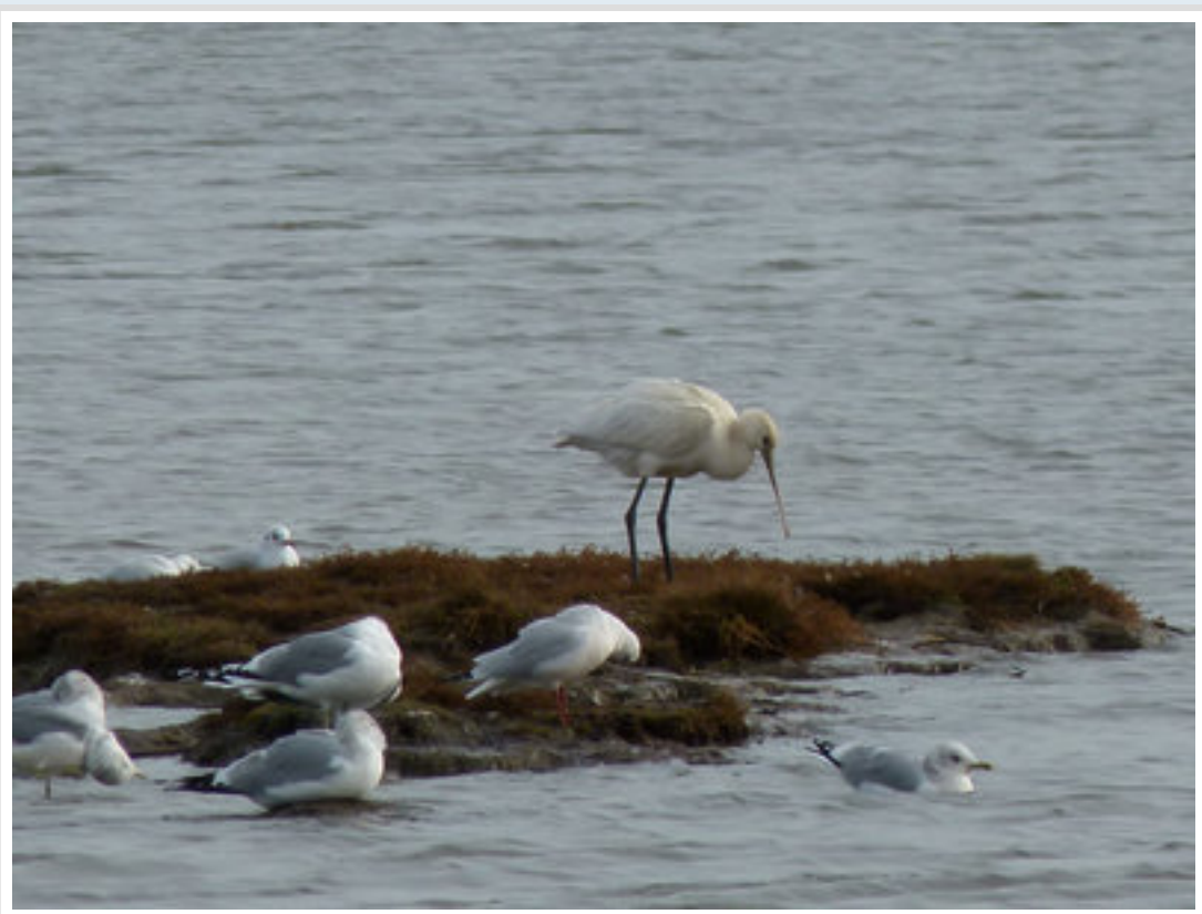
This rather untidy looking immature Spoonbill has been present at Oare Marshes for over a week.