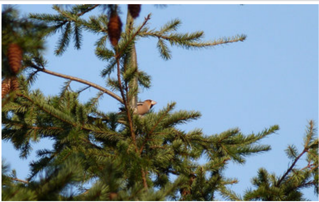
This species of bird is usually difficult to see so it was pleasing to obtain this photo.