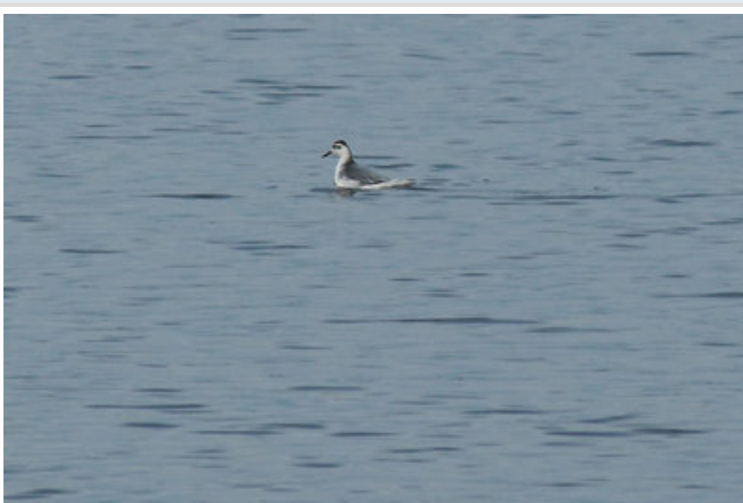
This Grey Phalarope was more distant. It spent most of the time spinning around in an anti-clockwise direction.