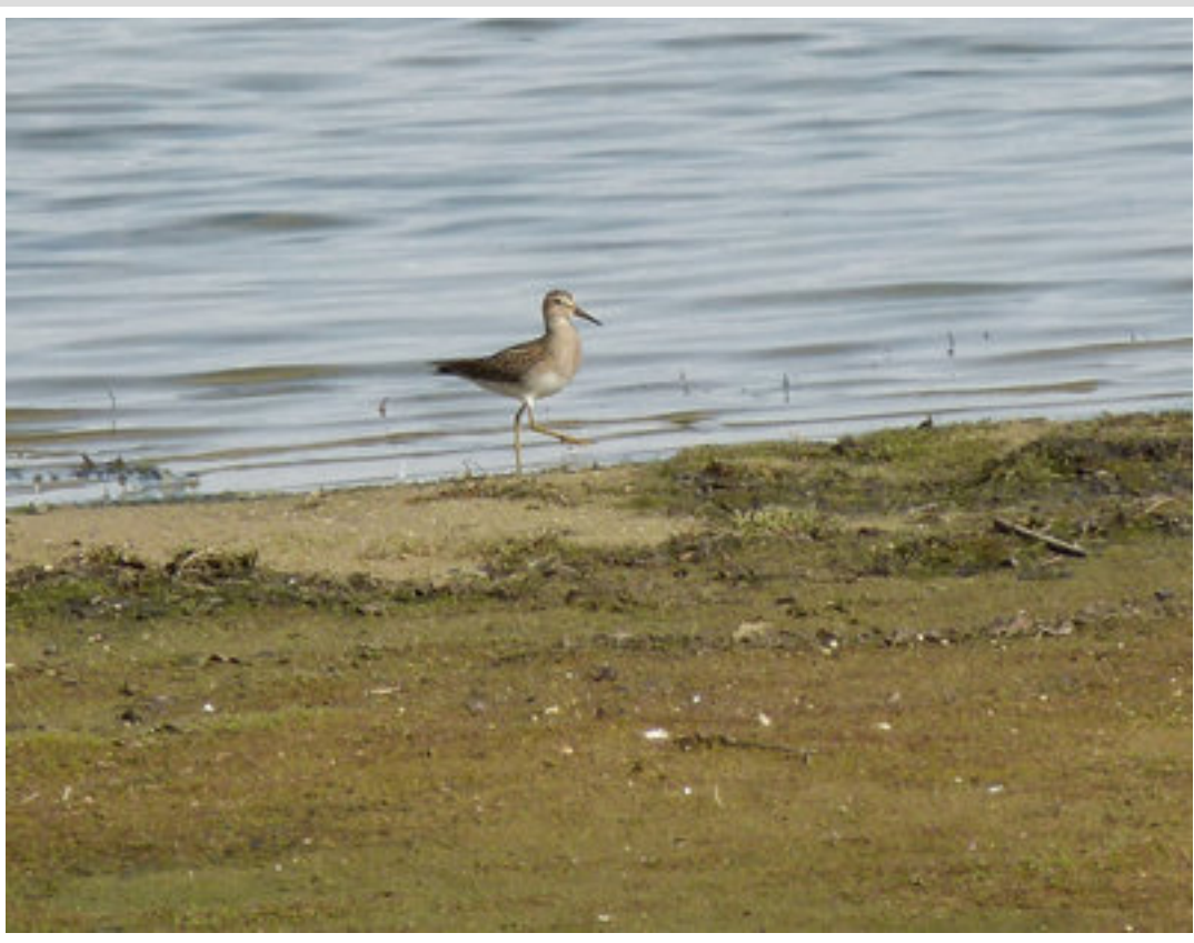
Record shot of the Pectoral Sandpiper at Dungeness