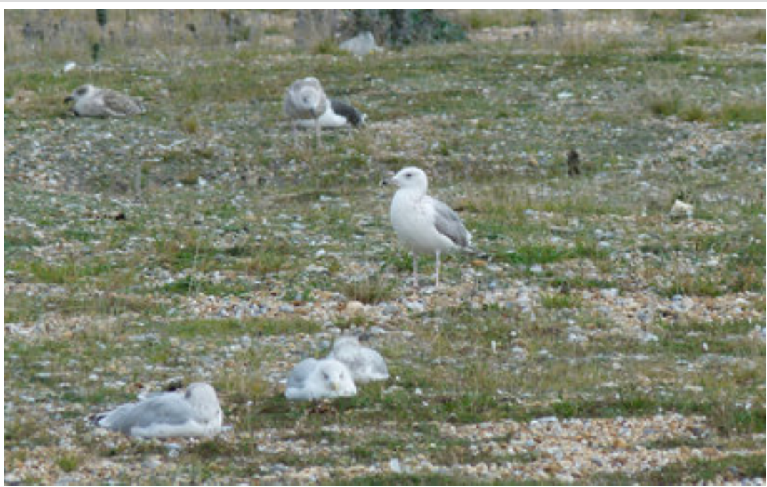
This Caspian Gull (bird in centre standing) was on Dungeness beach. We believe that this is a 3rd year bird (18 Oct 2010).