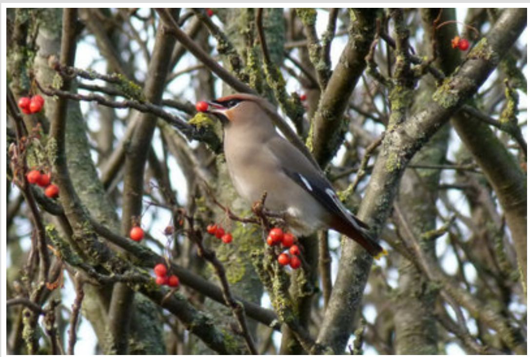
One of many at the Folkestone B&Q store.