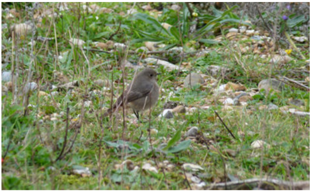
This Black Redstart was on the approach road to Dungeness Bird Observatory (18 Oct 2010).