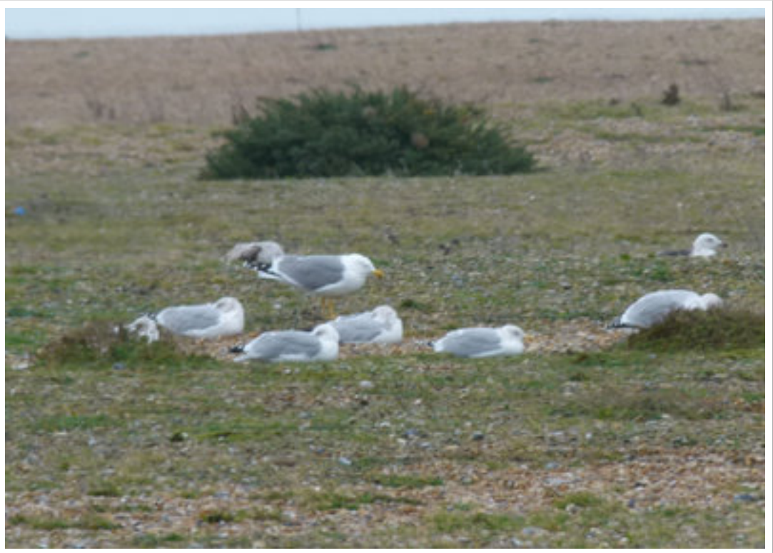
Yellow Legged Herring Gull (bird standing). Apart from the obvious yellow legs, the head is clean white and the back slightly darker than Herring Gull