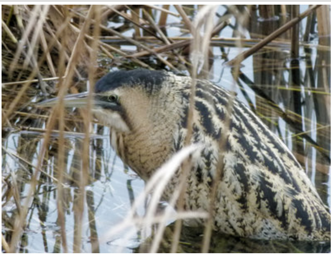
This Bittern was one of at least 11 on Dungeness RSPB. It showed well in front of Scott Hide for most of the day.