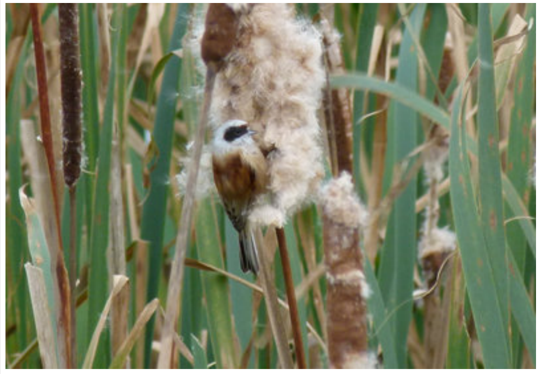
Male Penduline Tit at Dungeness, sorry but the poor light would not produce a sharper image.