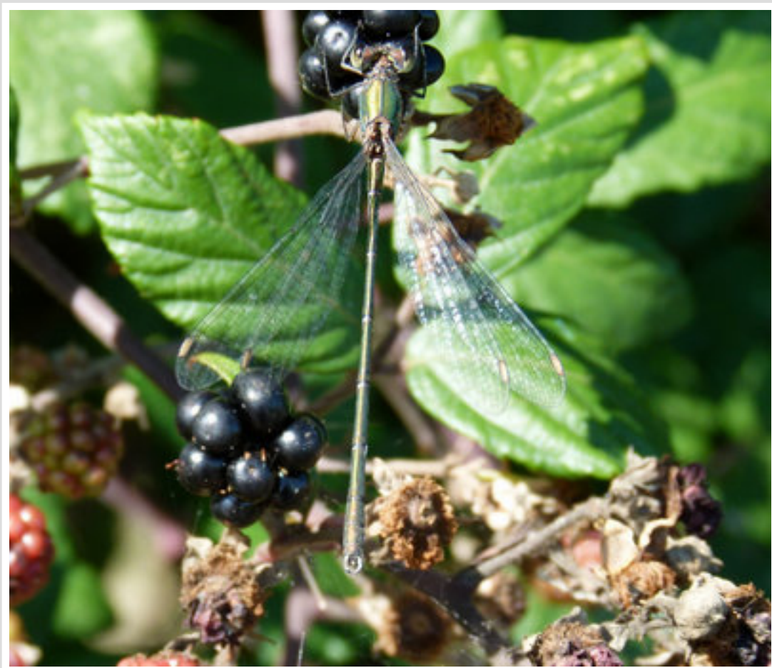
Willow Emerald Damselfly at Marshside in Kent