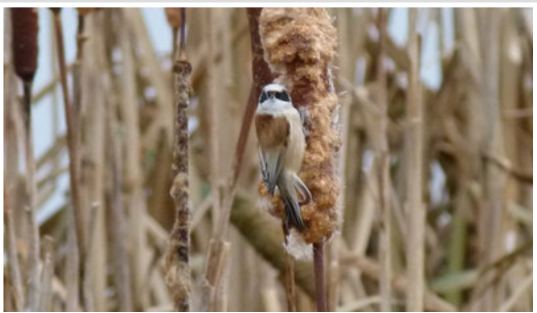
Penduline Tit in front of Hanson Hide, Dungeness RSPB