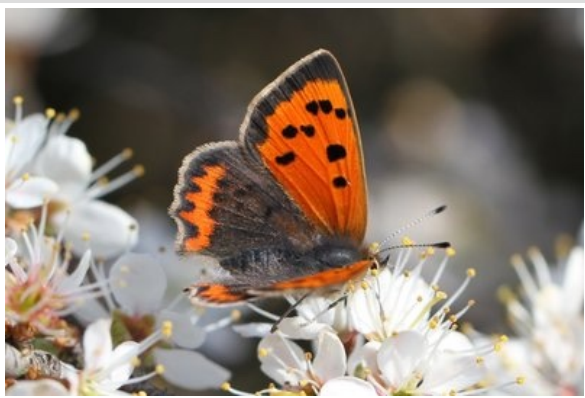
It is so good to see them again