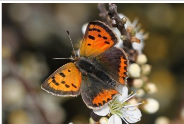
Gorgeous weather, butterflying in T-shirt and Sun Hat and fresh Small Coppers everywhere -