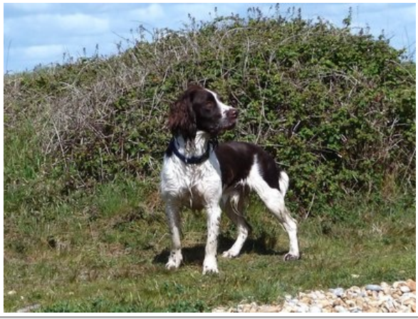
And we managed to count 63 during our walk