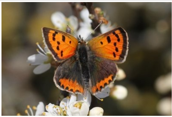
I've never seen one like him before