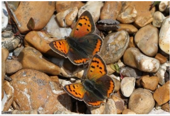
Certainly, they were getting straight down to business