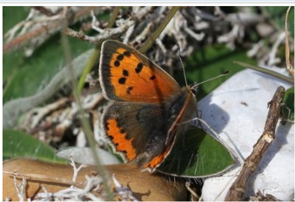
And good to see AllanW down there too after the long Winter hibernation