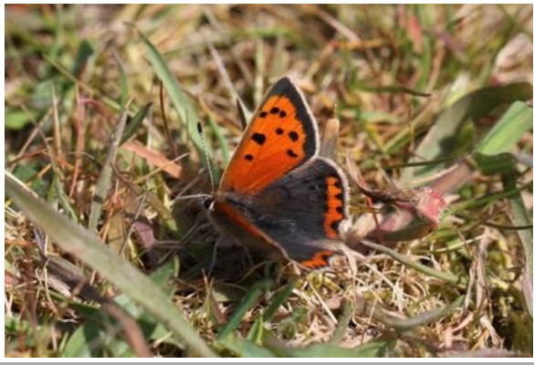
I counted 42 Coppers