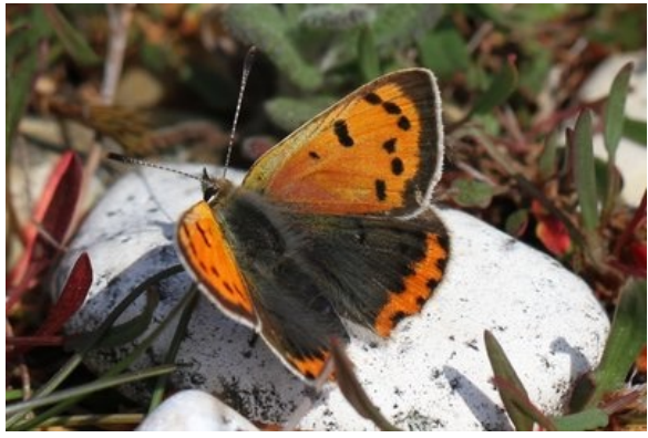
My Odd Copper of the Day was this chap