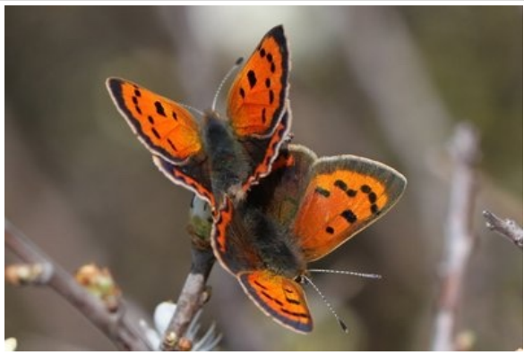
(And I was lucky enough to later find a second mating pair out on the shingle.)