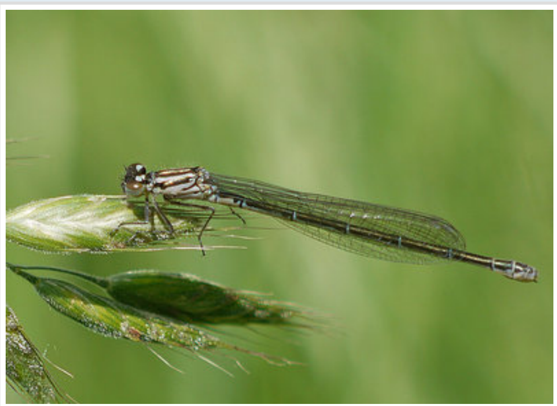
Damselfly (Azure?) - Meon Valley - 01/06/2011