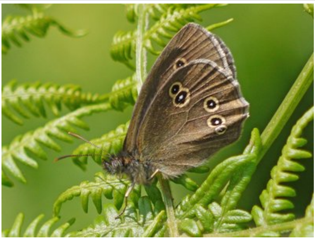
Ringlet - wings still not fully 'inflated' - Meon Valley - 14/06/2011

Then, on to the Victorian Walled Garden. Long abandoned for horticulture, it now consists of fruit trees trained round the walls, a central mown area but with un-mown strips all round, left to grow as un-grazed meadow – with different areas being cut on a rotational basis to prevent succession to scrub and wood. Small though it may be its diversity of flora is considerable. Just in this small area (approx. 70 x 30 metres) 9 butterfly species were seen that day.