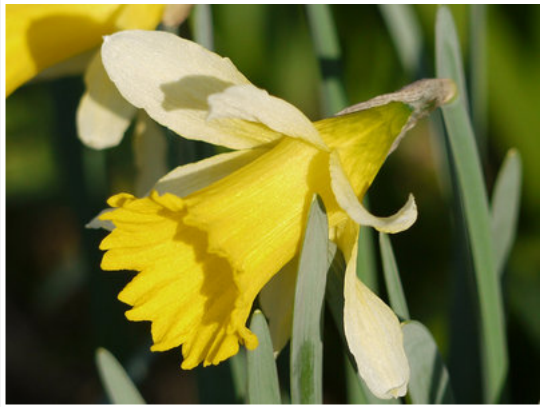
01/03/2012 - Southampton Old Cemetery

This time of year is so good for the spirits. Winter now behind us and spring flora starting to burst through. Spring Crocus, Wild Daffodils, Primrose, Lesser Celandine, Greater Periwinkle, Pulmonaria saccharata all adding colour together with Alpine Squill, Snowdrops and Hazel not yet finished. Yews shedding pollen so profusely it looks like smoke and the first of the Prunus trees already well in flower - the Purple-leaved Cherry-plum, Prunus cerasifera "Pissardii". And, things can only get better - until autumn at least.