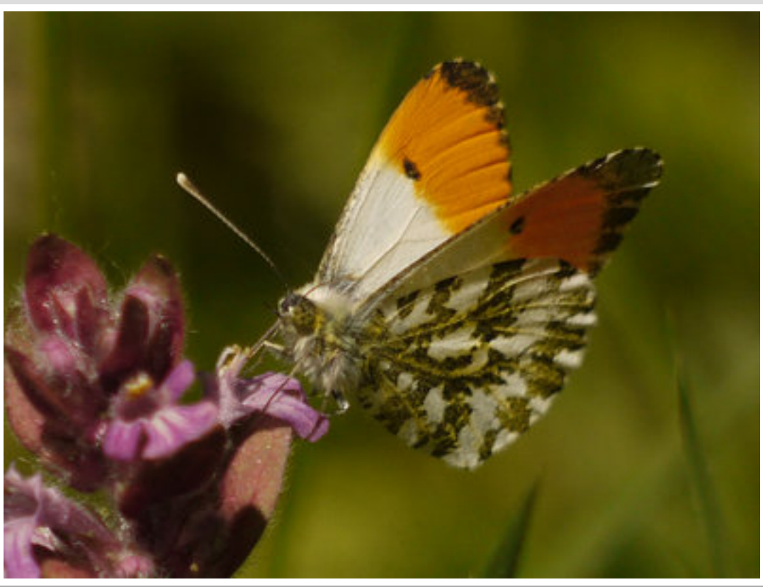
Orange-tip - Meon Valley - 03/05/2011