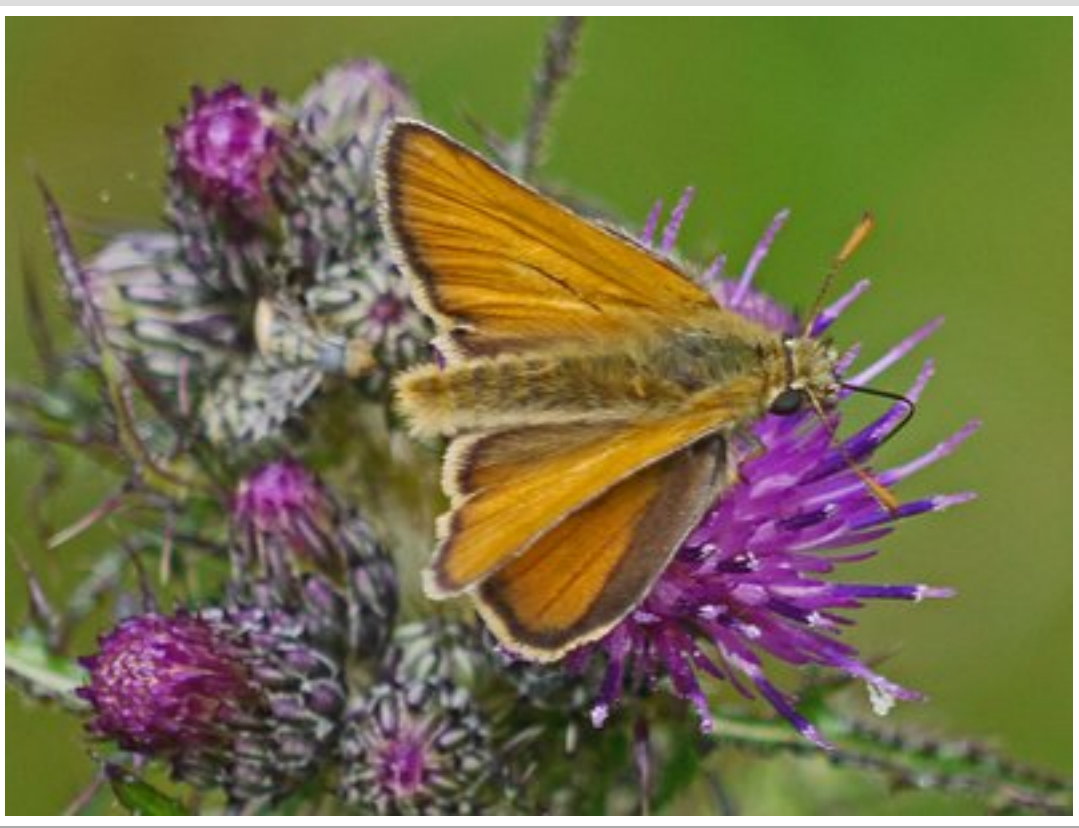
Small Skipper - Meon Valley - 14/06/2011

Together with Peacock, Comma, Common Blue, Large Skipper, Small Tortoiseshell, Speckled Wood, Green-veined White, Red Admiral, Small White, Small Heath and Meadow Brown that was 16 species in total.