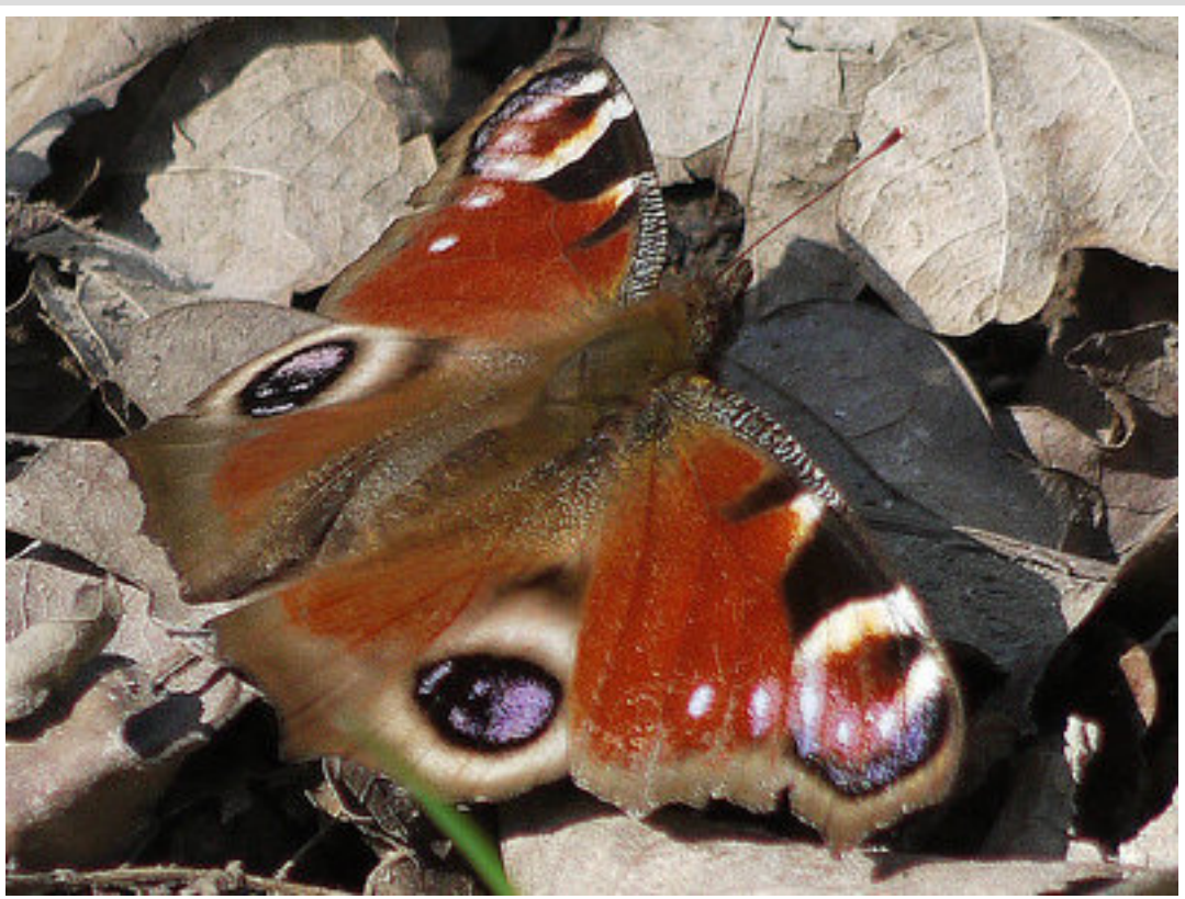
Peacock - Meon Valley - 11/04/2011

One visit - 17 Orange-tip, 6 Speckled Wood, 1 Comma, 3 Peacock, 1 Brimstone. Didn't manage to get one decent photo of an Orange-tip, in fact I don't remember ever seeing one that was not in flight.