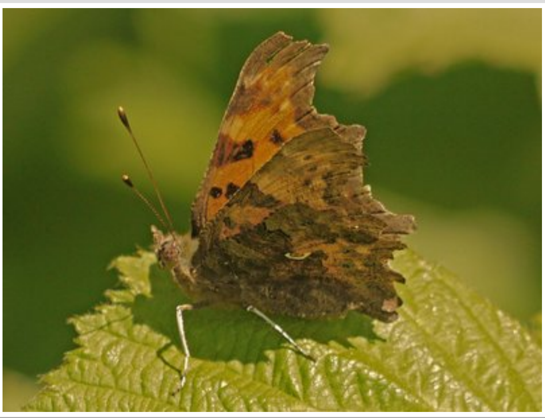
Comma - Meon Valley - 03/05/2011