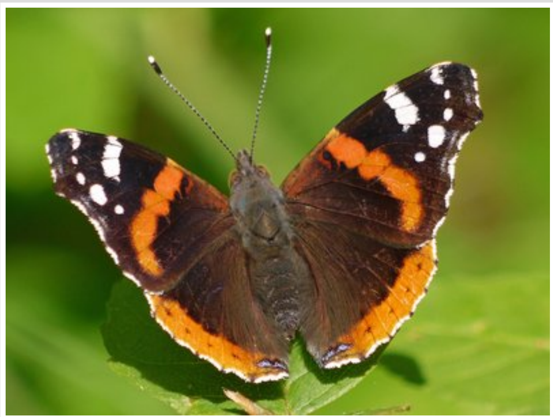
Red Admiral - Meon Valley - 01/06/2011

Also a good day for day-flying moths, 11 specimens in total - Mother Shipton, Burnett Companion and Brown Silver-line.