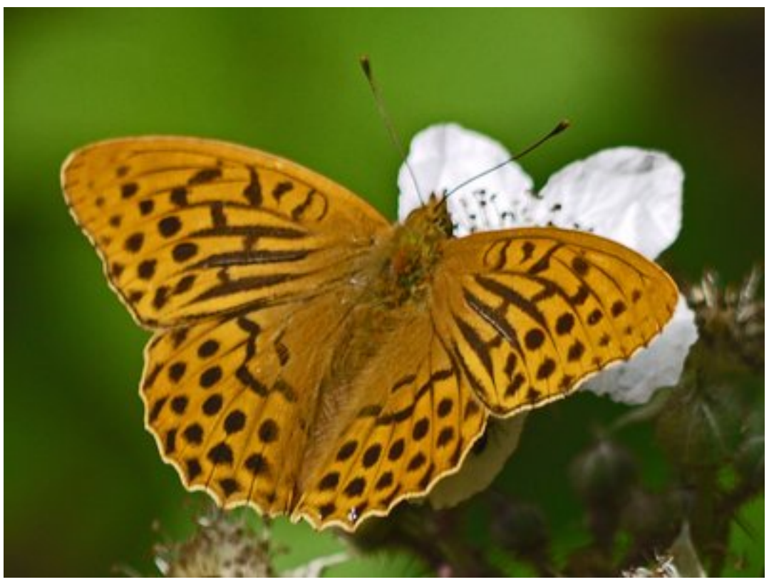
Silver-washed Fritillary - Meon Valley - 14/06/2011

With White Admirals swooping down to the bramble from above and Silver-washed Fritillaries sweeping along the paths from all 4 directions to the same nectar sources, I just sat there for an hour or so in complete awe.