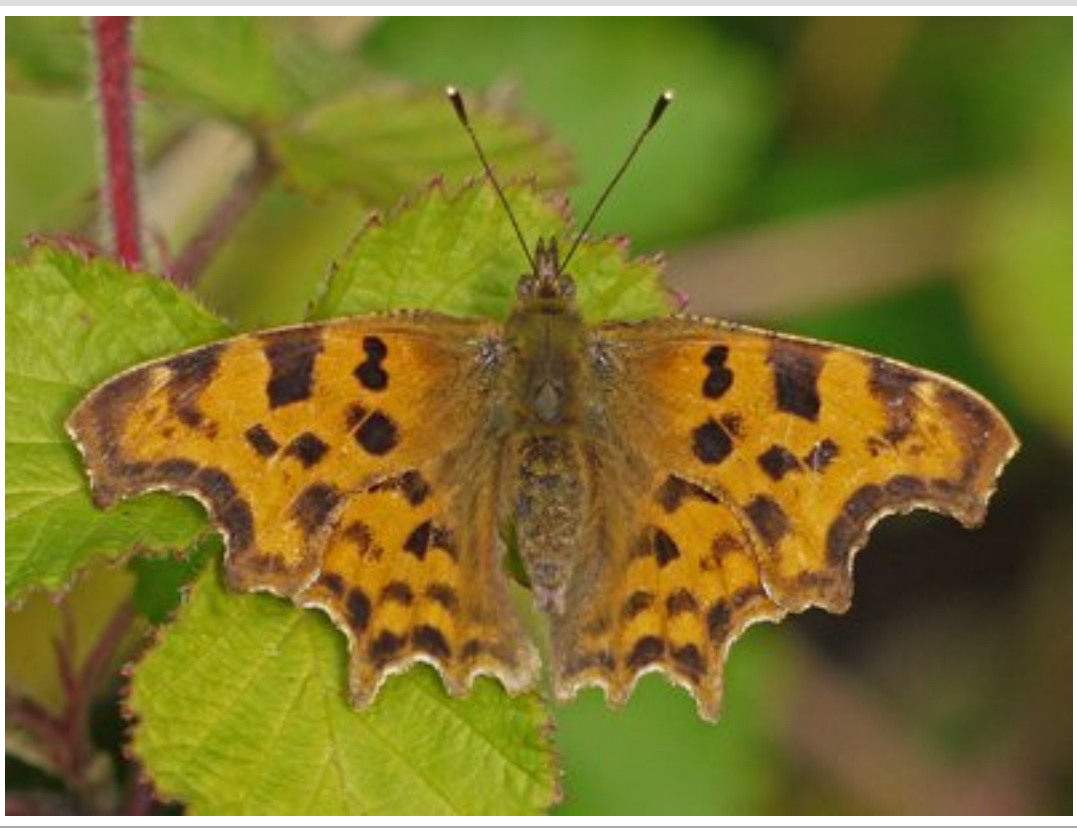
Comma - Meon Valley - 14/06/2011

Could have stayed there forever, but I eventually dragged myself away to search under one of the pylon clearings and then down a long wood/meadow edge. And it was just fantastic – never seen such concentrations of Meadow Browns, a dozen or more at every bramble clump, interspersed with Large Skippers at regular intervals. Also my first Ringlet of the year – still ‘pumping-up’ its wings – fantastic.