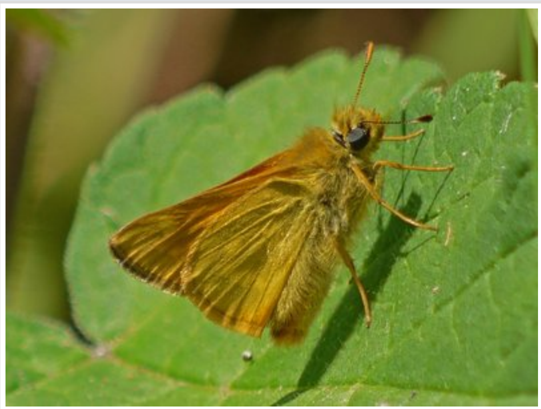
Large Skipper - Meon Valley - 01/06/2011

Other species seen for the first time were Brown Argus, Common Blue and Large Skipper, as well as additional sightings of Brimstone, Small Tortoiseshell, Speckled Wood, Green-veined White, Red Admiral and Small Heath.