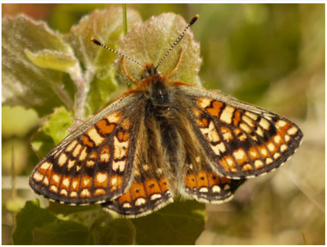
Marsh Fritillary – Meon Valley – 03/05/2011

First visit – Brimstone, Comma, Green-veined White, Large White, Orange-tip, Peacock, Red Admiral, Small White and Speckled Wood all seen, but the star of the day was a single Marsh Fritillary. This was quite unexpected as the nearest known colony in recent years, the unofficial reintroduction at Botley Wood, is several kilometres away and only a single individual (female) was recorded there in 2010. Apart from that it's 20 to 30 km to another colony. Not that the food plant is absent. Found under the pylon lines, this clearing was revealed later in the year to have almost 'wall to wall' Devils-bit Scabious. If I'm correct in my ID, it's a female – however an extensive search later in the year for larval webs produced a zero count. I hope to get back this year.