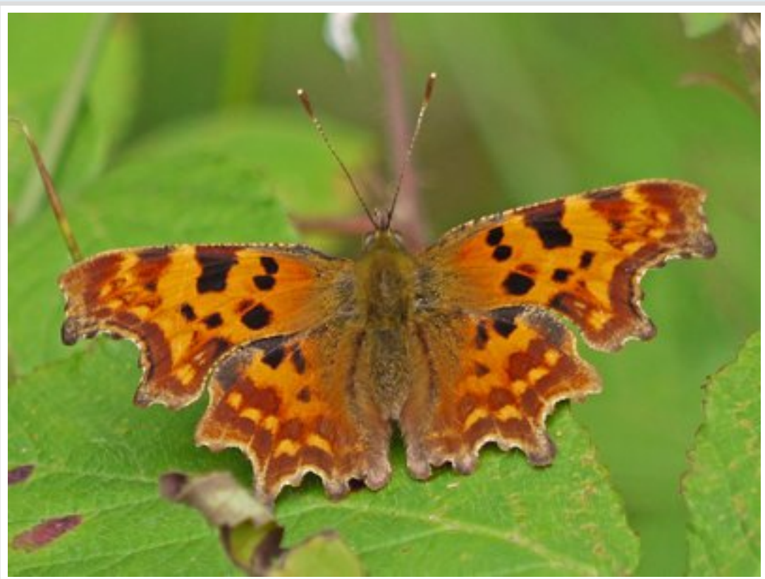
Comma - Meon Valley - 03/07/2011

I did manage to get into a wood or two and also along several wood/pasture edges as I made my way around the estate. One of my primary aims that day was to see if Purple Emperors were present on the estate. Plenty of suitable territory with Sallow by the River Meon near to extensive woods with suitable trees and clearings. Alas, I did not find any, although I'm sure they must be there somewhere. Probably because I spent too much time looking down and counting grassland species.