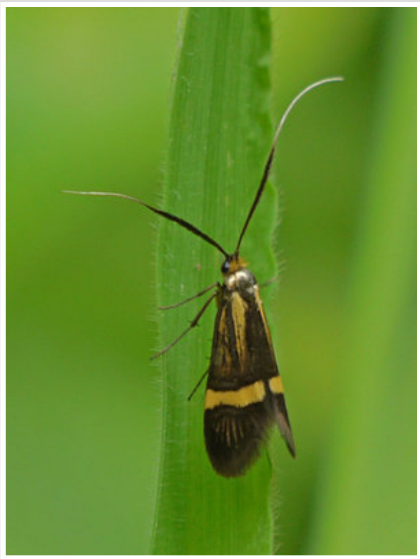
Longhorn Moth - Nemophora degeerella - Meon Valley - 01/06/2011

Not to mention the Micro-Moths. A month before it had been Adela reaumurella in HUGE numbers, now the turn of Nemophora degeerella .