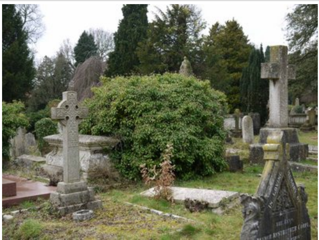
southampton Old Cemetery

I have been walking a transect there since 2006. So far 24 species recorded, plus another 2 off-transect. Species with an Annual Index regularly exceeding 100 are Speckled Wood, Marbled White, Gatekeeper, Meadow Brown and Ringlet; although the MW and MB have both had a very poor last couple of years. Holly Blue and Small/Essex Skippers also reach 100 in good years.