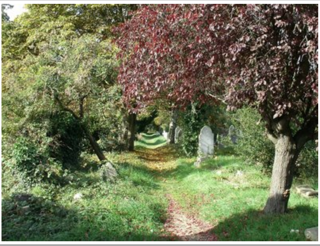
southampton Old Cemetery

The friends-group for the cemetery has a good website to which I have contributed the wildlife page and photos - http://fosoc.org/the-cemetery/wildlife/ Some of the photos shown above are from Gillie Dunkason of the friends-group. I hope to keep updating the butterfly situation in the cemetery as I progress with the transect this year.