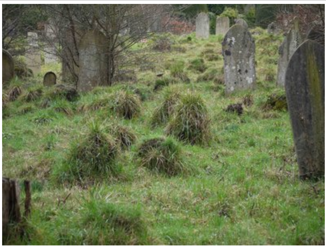
Southampton Old Cemetery

Originally hived off from Southampton Common, much of the woodland stream valley remains to the west (although the stream itself was diverted underground) with several big old Oaks remaining. To the east the acidic soils produce a heath-type environment with Ling & Bell Heather thriving. In the centre is an area of maintained grassland, originally much grazed when part of the Common (since kept as such by scythe, strimmer and volunteer sapling removal) and is home to many huge Yellow Meadow Ant mounds – fast-food restaurants for Green Woodpeckers. Over 300 species of flora are present including quite a few feral exotics and non-native conifers.