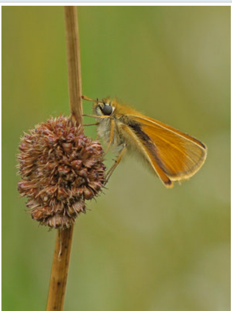
Small Skipper - Meon Valley - 03/07/2011 - my favourite photo of the day

Numbers: Silver-washed Fritillary 70, Small Skipper 167, Marbled White 236 (up from one 19 days before), Meadow Brown 482 and Ringlet 559 (again, up from one 19 days before). These are considerable underestimates, I was basically just recording those about 5 metres either side (a double transect width). Altogether 1589 butterflies recorded.