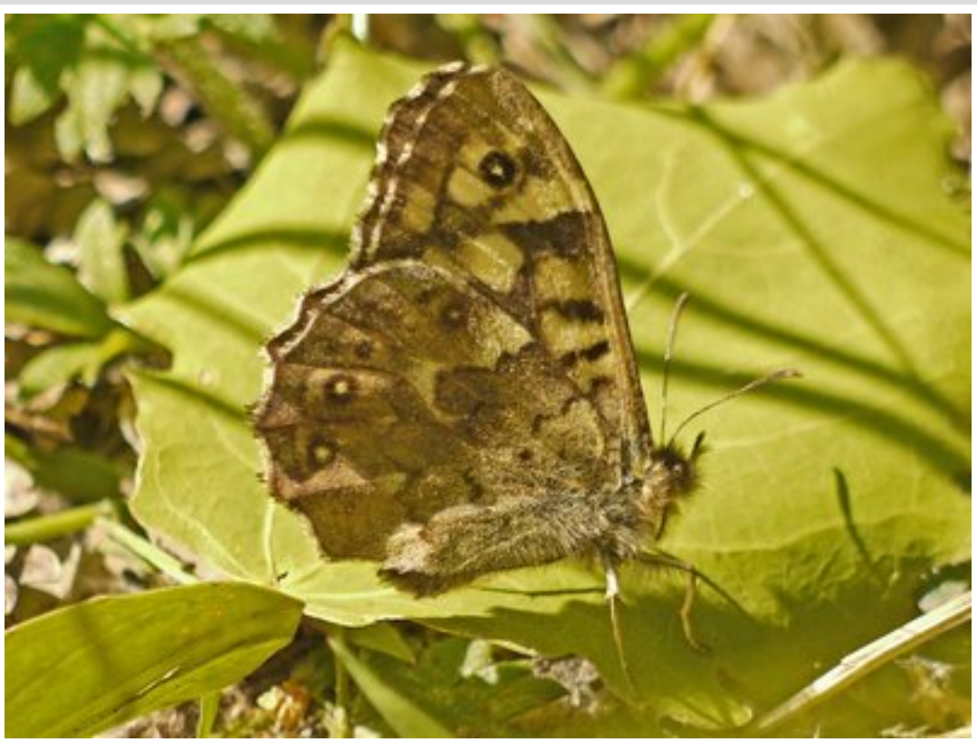
Speckled Wood – Meon Valley – 03/05/2011