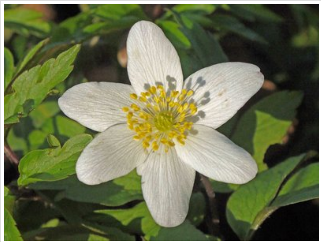
Wood Anemone - 10/03/2012

But in my book, spring has finally arrived as I found the first Wood Anemone in flower - a little earlier than last year.