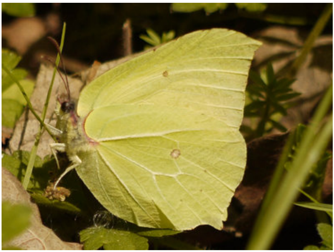
Brimstone - Meon Valley - 03/05/2011