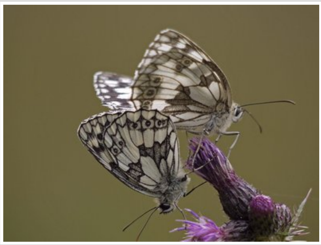
Marbled White - Meon Valley - 03/07/2011 - ditto