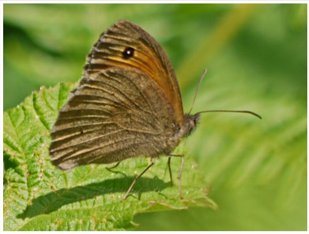
Meadow Brown - Meon Valley - 01/06/2011

Other species seen for the first time were Brown Argus, Common Blue and Large Skipper, as well as additional sightings of Brimstone, Small Tortoiseshell, Speckled Wood, Green-veined White, Red Admiral and Small Heath.