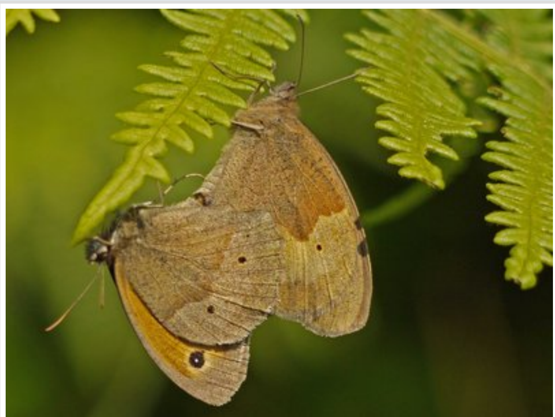
Meadow Brown - Meon Valley - 03/07/2011 - making sure we get some next year