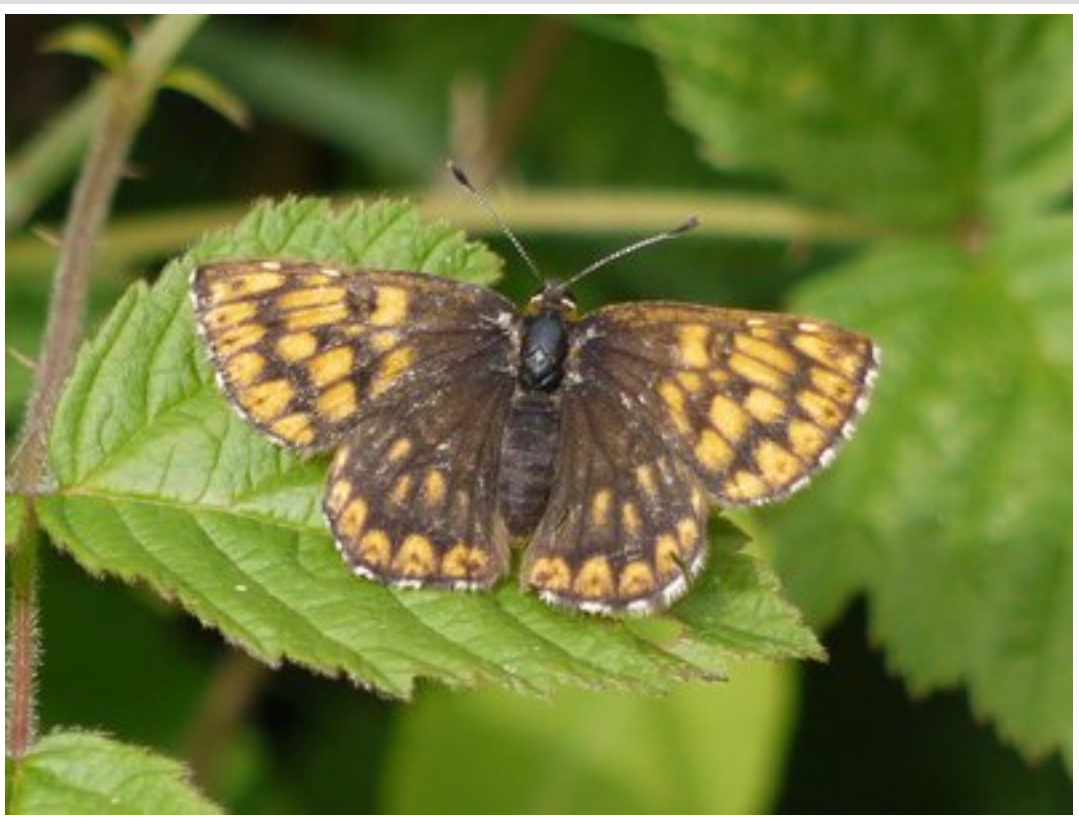
Duke of Burgundy – Meon Valley – 18/05/2011