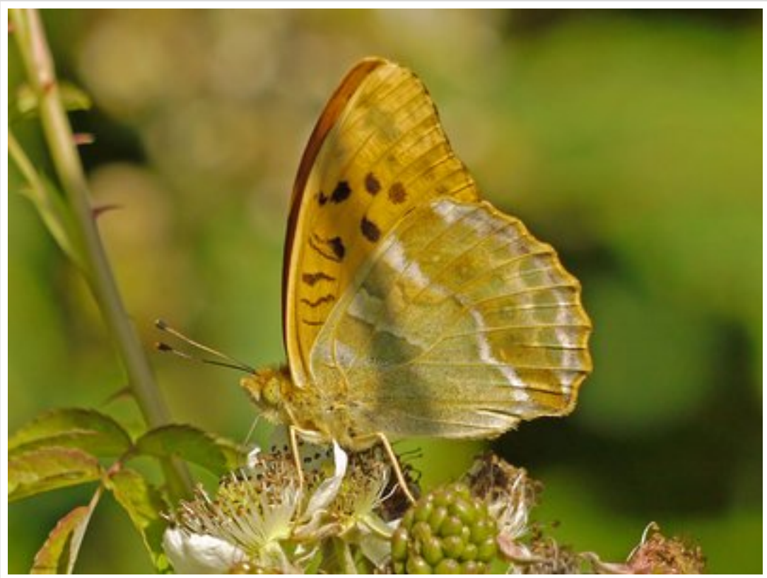
Silver-washed Fritillary - Meon Valley - 03/07/2011

I did manage to get into a wood or two and also along several wood/pasture edges as I made my way around the estate. One of my primary aims that day was to see if Purple Emperors were present on the estate. Plenty of suitable territory with Sallow by the River Meon near to extensive woods with suitable trees and clearings. Alas, I did not find any, although I'm sure they must be there somewhere. Probably because I spent too much time looking down and counting grassland species.