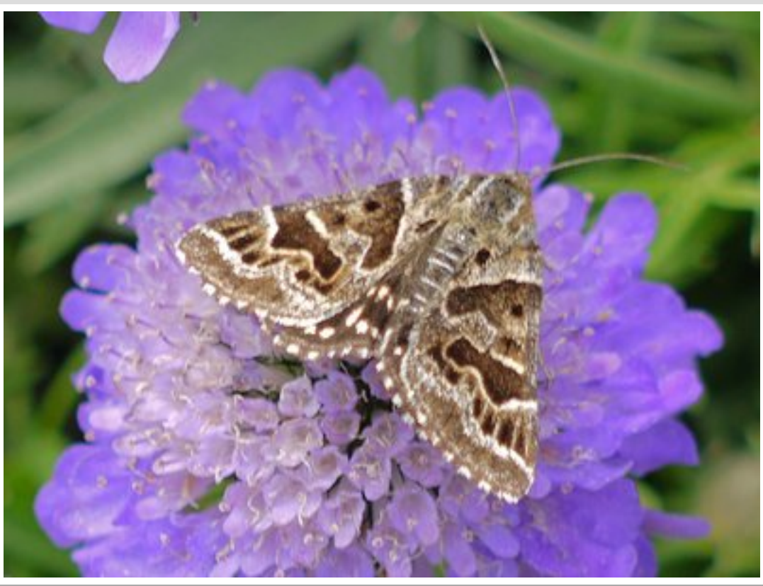
Mother Shipton - Meon Valley - 01/06/2011

Not to mention the Micro-Moths. A month before it had been Adela reaumurella in HUGE numbers, now the turn of Nemophora degeerella .