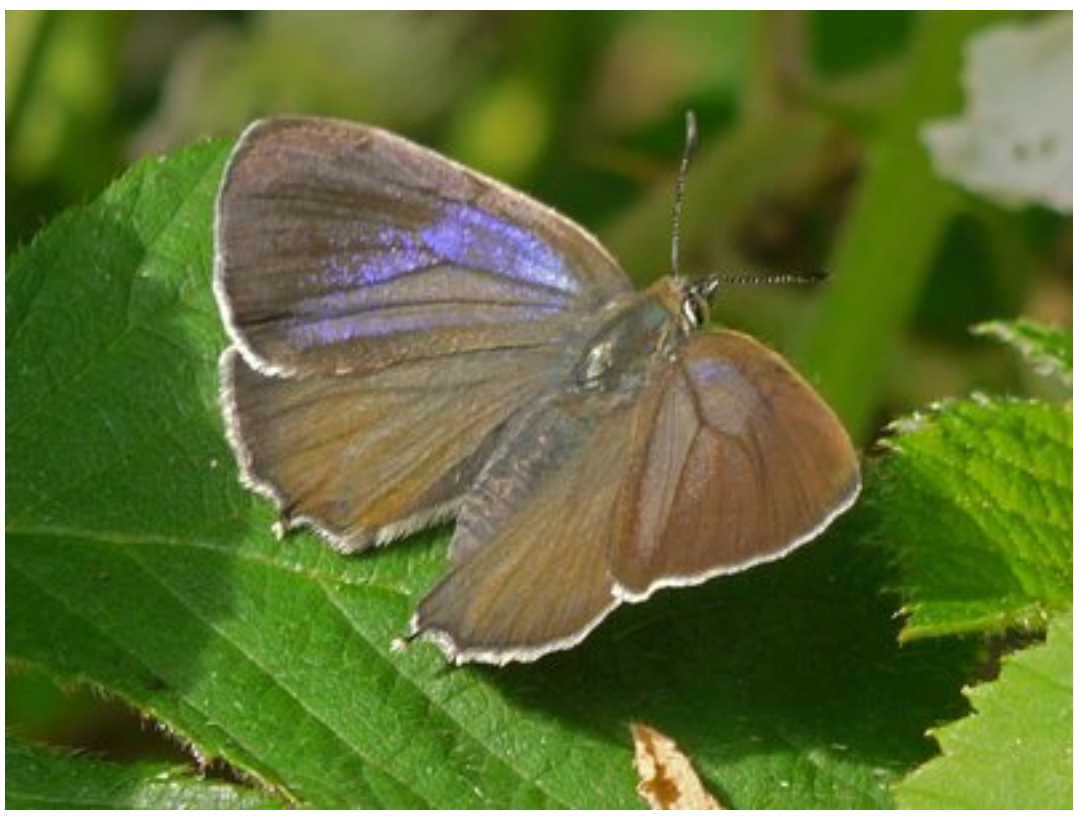
Purple Hairstreak - Meon Valley - 03/07/2011

But I did find a single Purple Hairstreak, and low down so I could get a single photo before it flew off. I'm sure there are many colonies of this species on the estate, but I was usually on my way home before that time in the early evening when they display atop the Oaks.