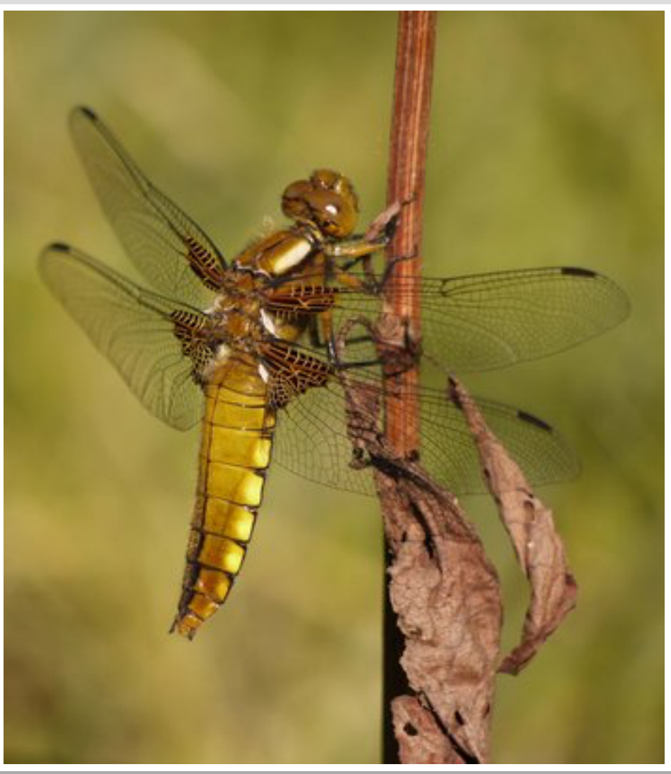
Broad-bodied Chaser – Meon Valley – 03/05/2011