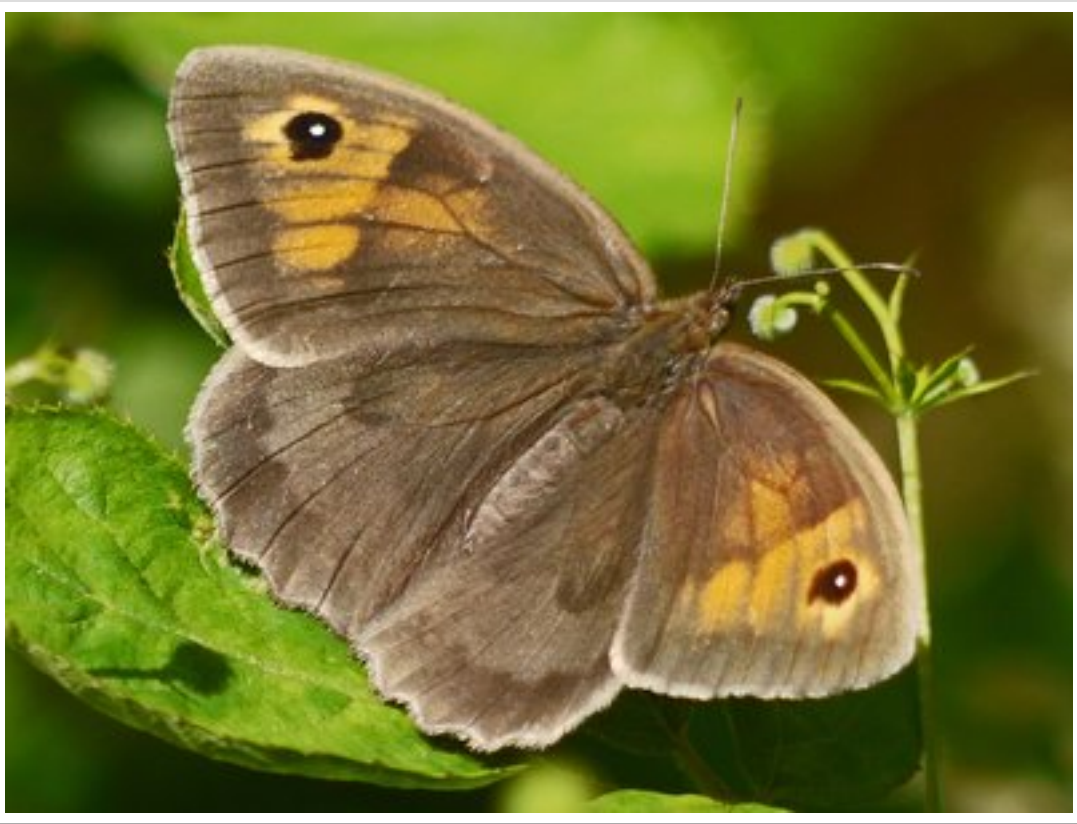
Meadow Brown - Meon Valley - 14/06/2011

Could have stayed there forever, but I eventually dragged myself away to search under one of the pylon clearings and then down a long wood/meadow edge. And it was just fantastic – never seen such concentrations of Meadow Browns, a dozen or more at every bramble clump, interspersed with Large Skippers at regular intervals. Also my first Ringlet of the year – still ‘pumping-up’ its wings – fantastic.