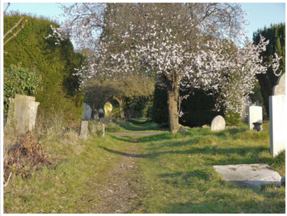
Southampton Old Cemetery - 10/03/2012

Managed to get out yesterday and today to Southampton Old Cemetery for a few hours. Both were very sunny and warm afternoons. Surprisingly, no butterflies yesterday.