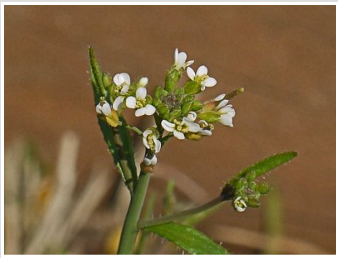
Thale Cress - 11/03/2012

the first time today; while Yews continue to disperse pollen.