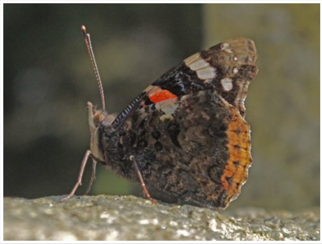
Red Admiral - Southampton Old Cemetery - 25/03/2012

Had managed a few trips to the cemetery the previous week when it was much hotter. Mainly Red Admiral and Comma earlier, with a first Holly Blue on 25/03. Then the first generation Speckled Wood emerged - none on 25/03, 7 on 27/03 and 10 on 28/03.