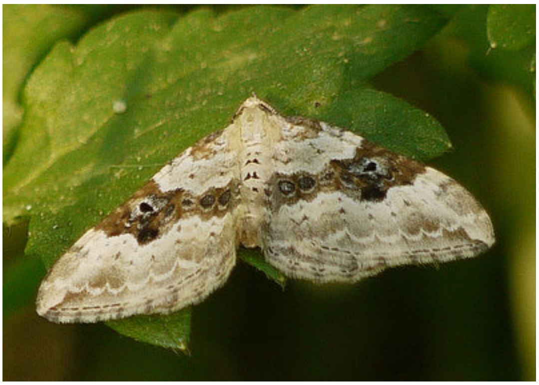
Silver-ground Carpet - Meon Valley - 03/05/2011

As mentioned , there are two lakes, attracting a couple of dragonflies posing nicely for me.