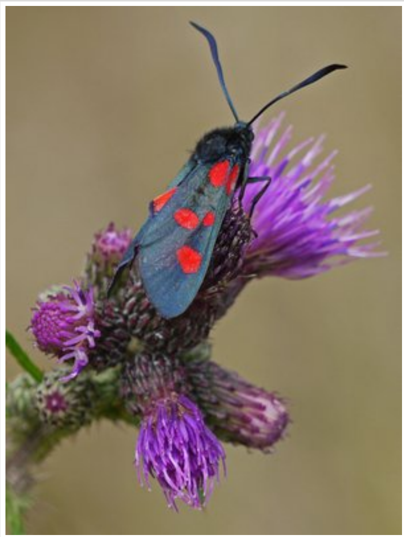
Narrow-bordered Five-spot Burnet - Meon Valley - 03/07/2011

Was a lovely day, long sunny spells with some short cloudy intervals. Spent most of the day in the two pylon clearings. These areas are quite typical of most pylon clearings in woods I have come across in the south - free of trees, not much shrub, not grazed and just left to see what nature makes of it. Grass left to flower and seed, patches of bracken, bramble against the edges and a succession of wild flowers throughout the seasons. Ideal for a number of species.