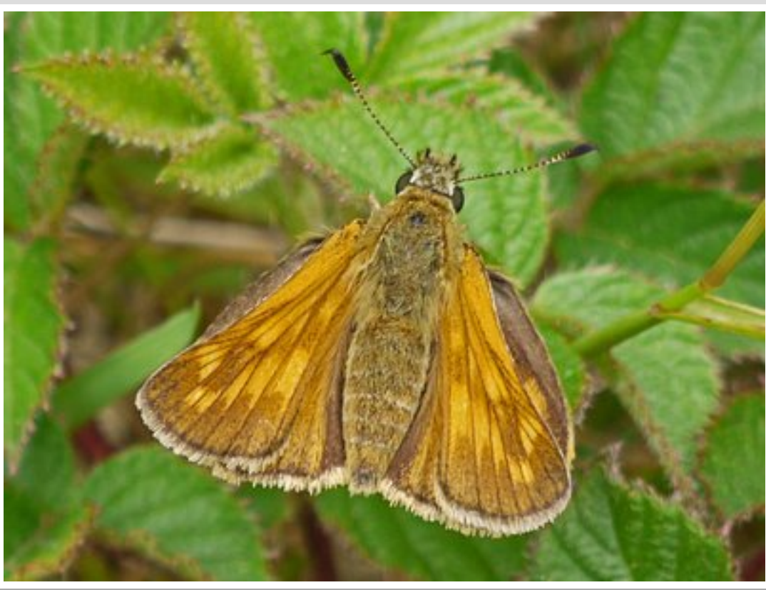
Large Skipper - Meon Valley - 03/07/2011

But I did find a single Purple Hairstreak, and low down so I could get a single photo before it flew off. I'm sure there are many colonies of this species on the estate, but I was usually on my way home before that time in the early evening when they display atop the Oaks.