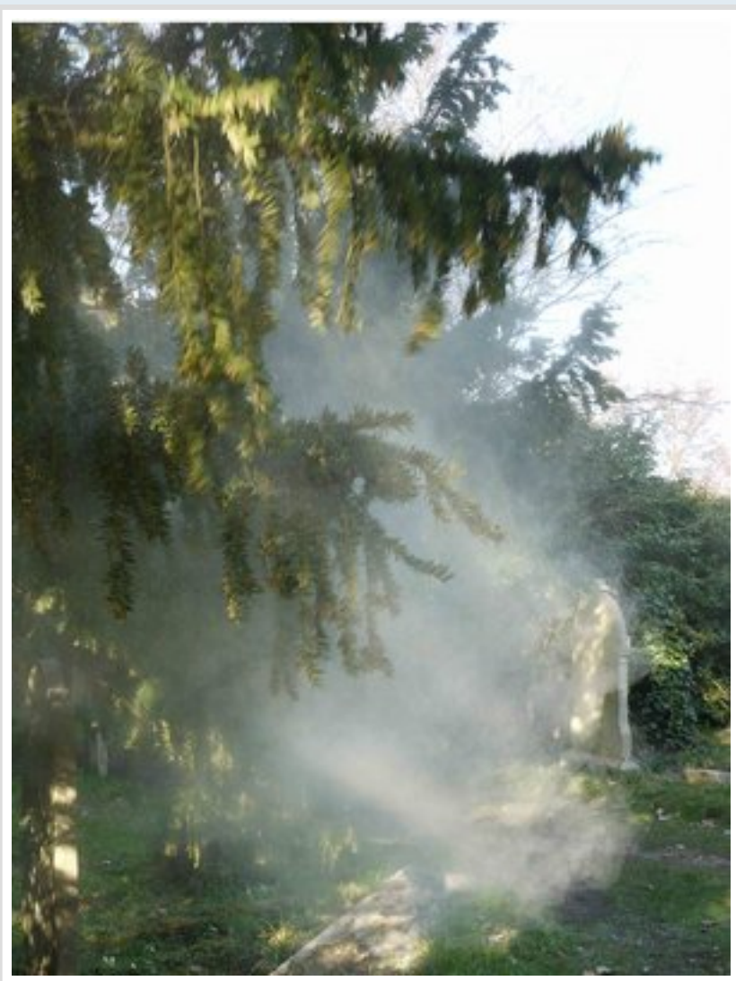
'Blowin' in the Wind' (actually, I gave the branch a sharp tap) - Yew pollen - 11/03/2012

More details of Wildlife in Southampton Old Cemetery at http://fosoc.org/the-cemetery/wildlife/