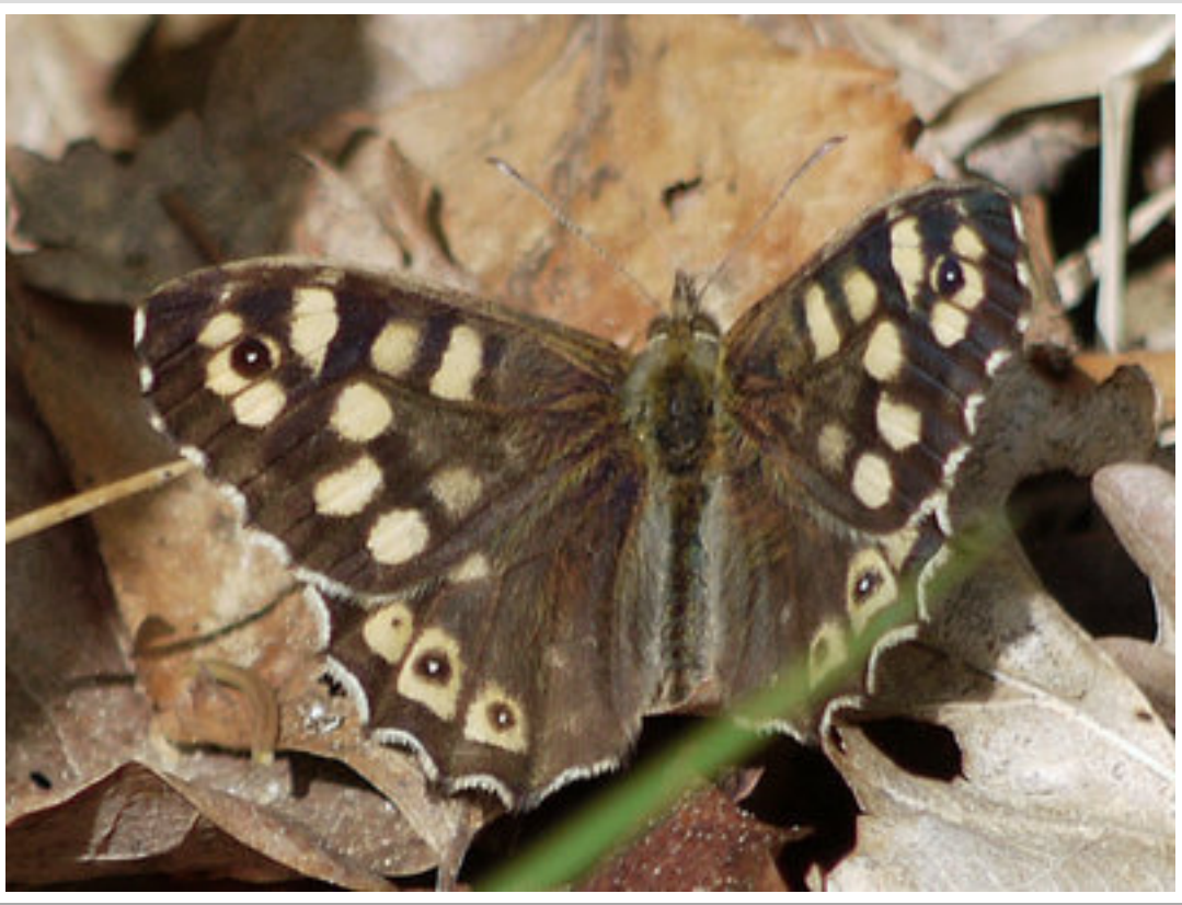
Speckled Wood – Meon Valley – 11/04/2011