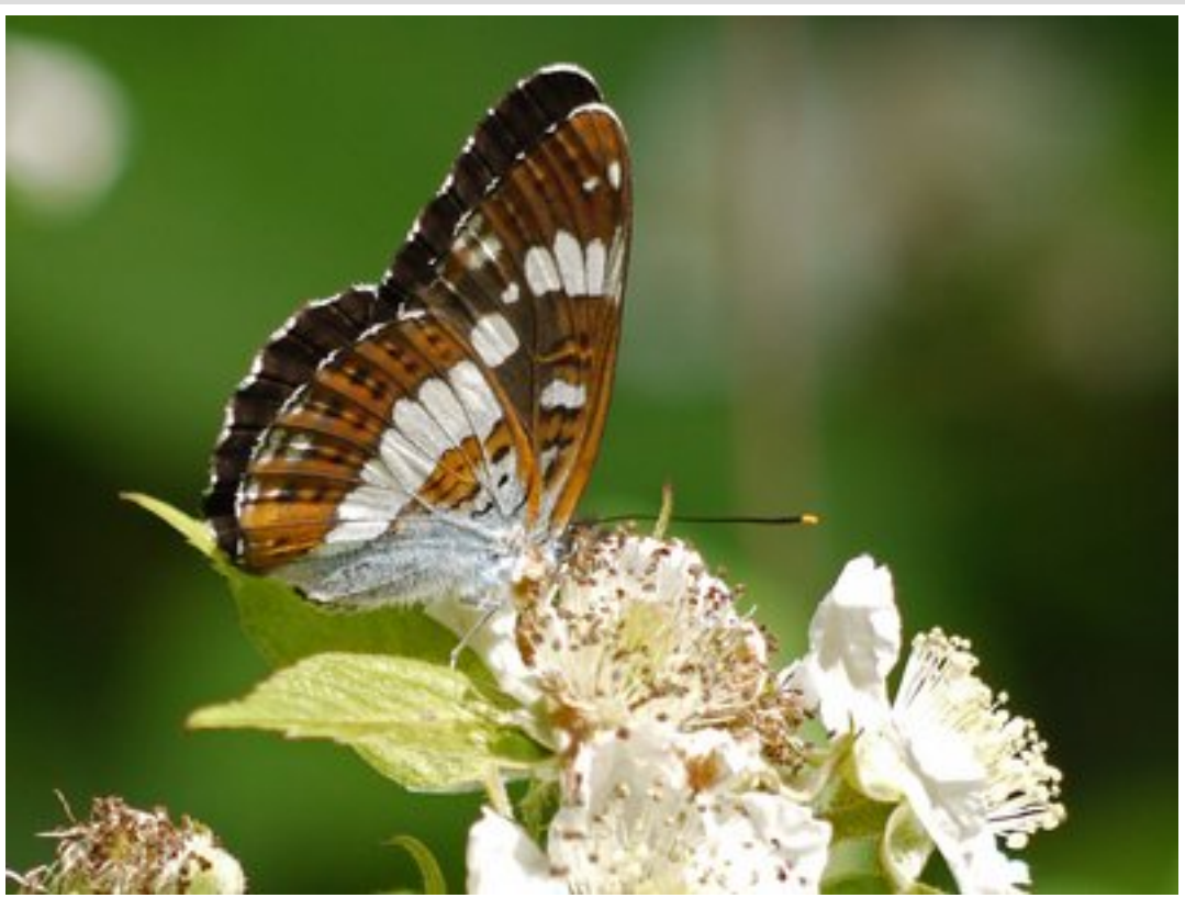
White Admiral - Meon Valley - 14/06/2011

Nearby a Comma had staked out a patch of bramble and chased off all-comers. A few Meadow Browns drifted by, searching for each other and the Knapweed just starting to flower in the more sunny clearings. Not surprising really that they found their way into this wood in view of the huge numbers in the meadows and under the pylons. All this with just birdsong; no other noise, no people - bliss.