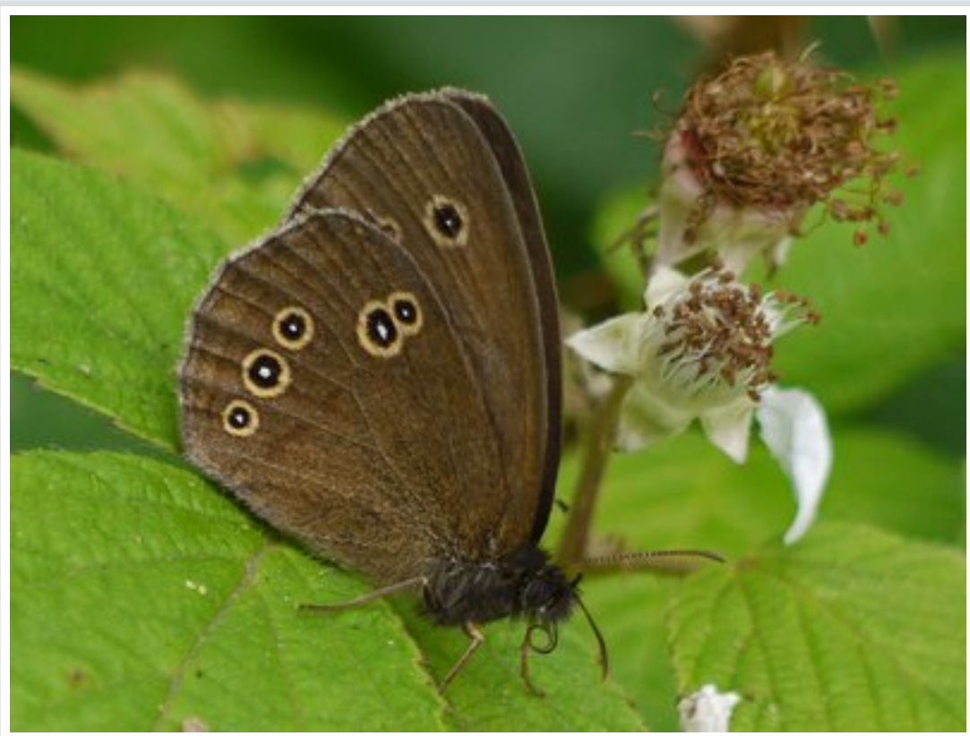
Ringlet - Meon Valley - 03/07/2011

So, with trousers tucked firmly into socks in a vain attempt to keep out the ticks, I came to the first pylon clearing. Ringlets, Meadow Browns, Marbled Whites and Small Skippers in profusion. Walking through the long grass was akin to Moses parting the Red Sea - they would flutter to one side as I approached and then regroup behind to fill the empty space as I made forward progress. Counting them became increasingly difficult and slowed me down to a virtual stop in places. Just absolutely wonderful to experience such huge numbers in this beautiful setting.