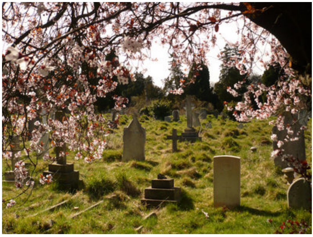
Southampton Old Cemetery

An introduction to this little city-enclosed paradise. It consists of 11 hectares (27 acres) of Victorian council owned cemetery, opened in 1846. All burial plots had been used by the 1910's; gradually over the following decades it became less manicured and more wild. Following a public consultation in the late 1980's it has been managed since 1990 by a regime "aimed at preserving the character of the existing flora and fauna".