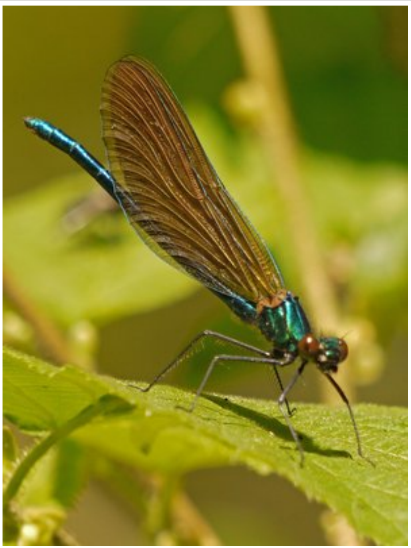
Beautiful Demoiselle - Meon Valley - 03/05/2011

As mentioned , there are two lakes, attracting a couple of dragonflies posing nicely for me.