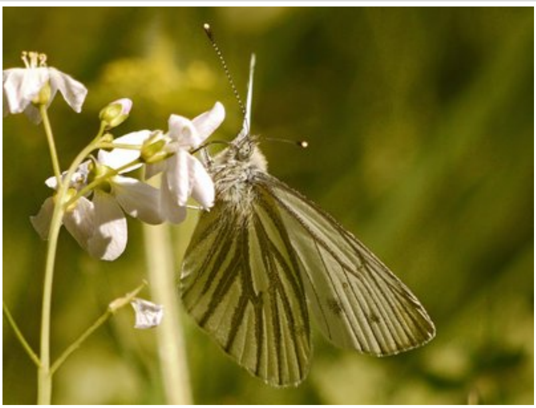
Green-veined White - Meon Valley - 03/05/2011