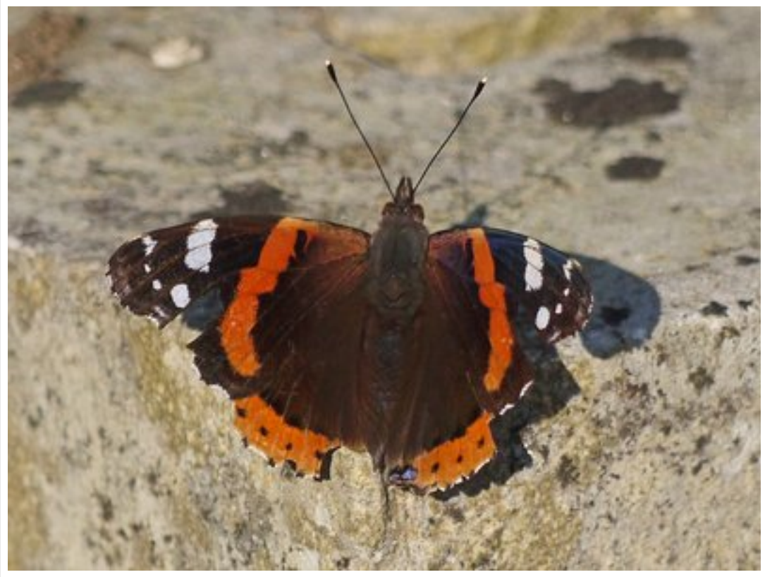
Red Admiral - 01/03/2012 Southampton Old Cemetery

And, my first of the year, a solitary Red Admiral. Not in too good a nick, guess it managed to get through winter as an adult. Despite a few nectar sources being available, it was quite content to just bask on the headstones.