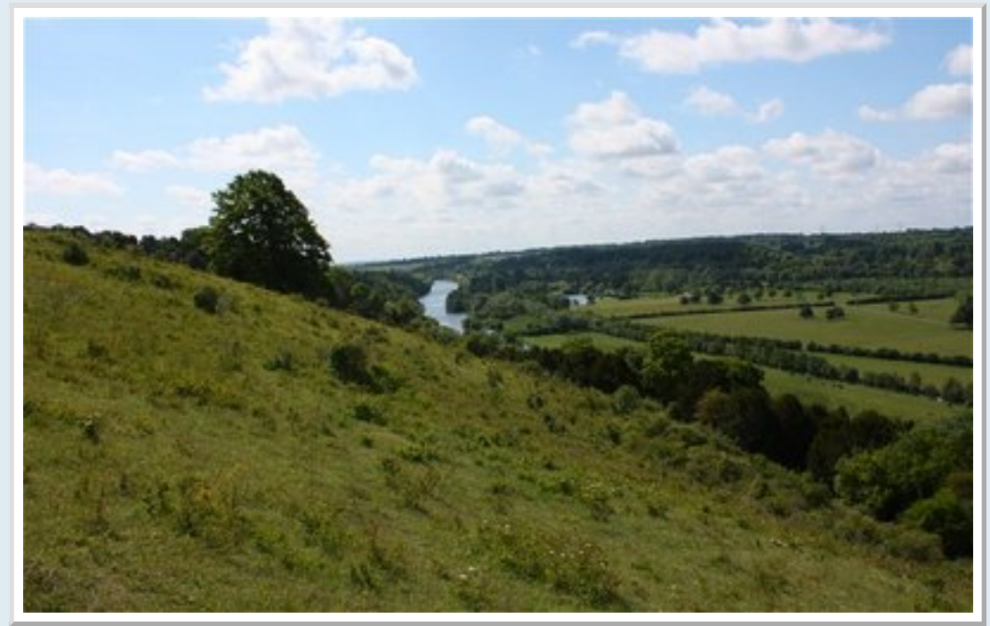
Hillside at Hartslock Nature Reserve

We visited the nearby Hartslock Nature Reserve famous for its Orchids.