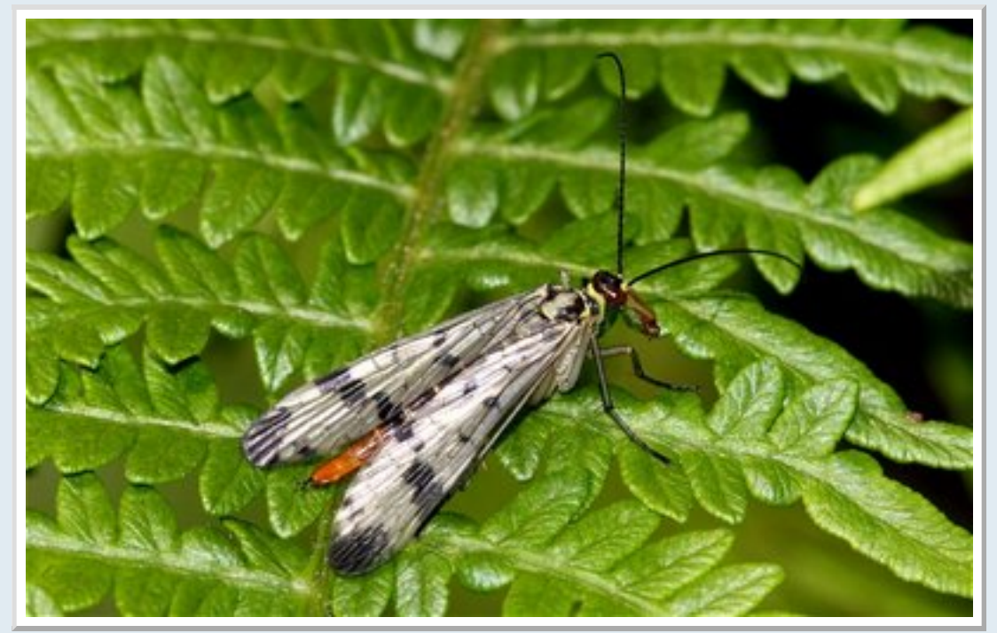
Scorpion Fly female