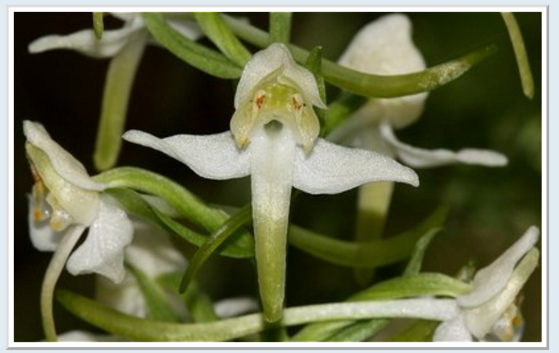
Greater Butterfly Orchid