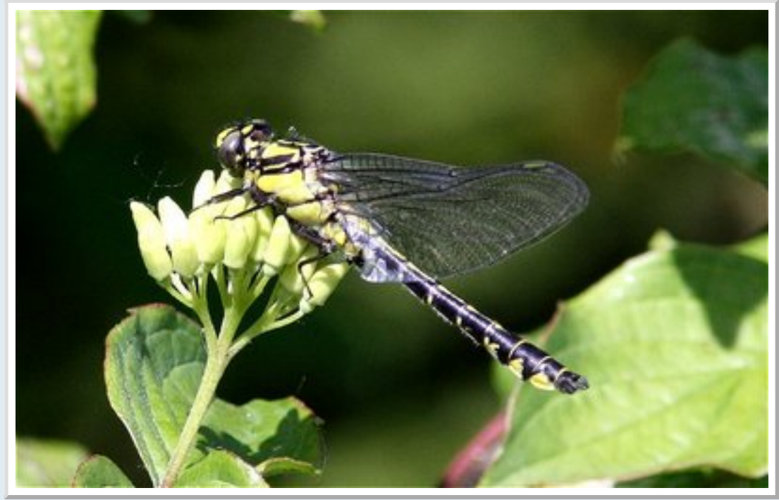
First Club Tail

Found plenty of exuviae on the concrete edge of the bridge but didn't find any hatching out. Guess we were too late in the year or it was the wrong day. We did find a couple of adults warming up in the riverside vegetation. I love these dragonflies.