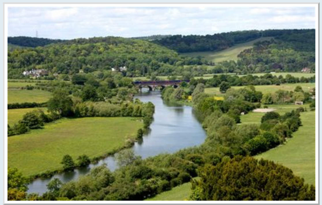
Shot along the Thames south of Goring

Had a trip to Goring on the Thames to find the Club-tailed Dragonfly.