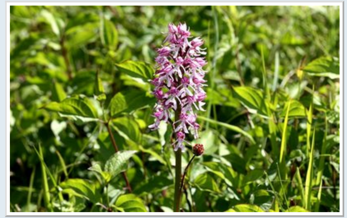
Lady x Monkey Orchid hybrid

There were some splendid Monkey x Lady Orchid hybrids showing quite tall spikes on the hillside.