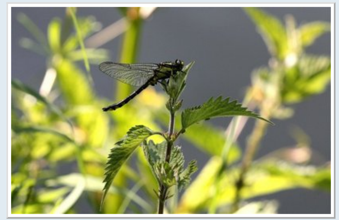
Second Club Tail

This was the second found by two wildlife enthusiasts we met at Bentley Wood last year. Good to meet up again.