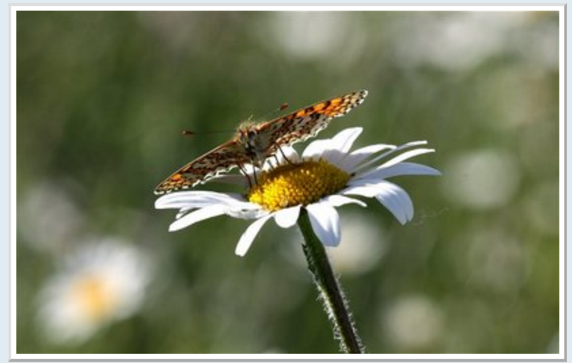
Arty shot of a Female Here's a few of the males.