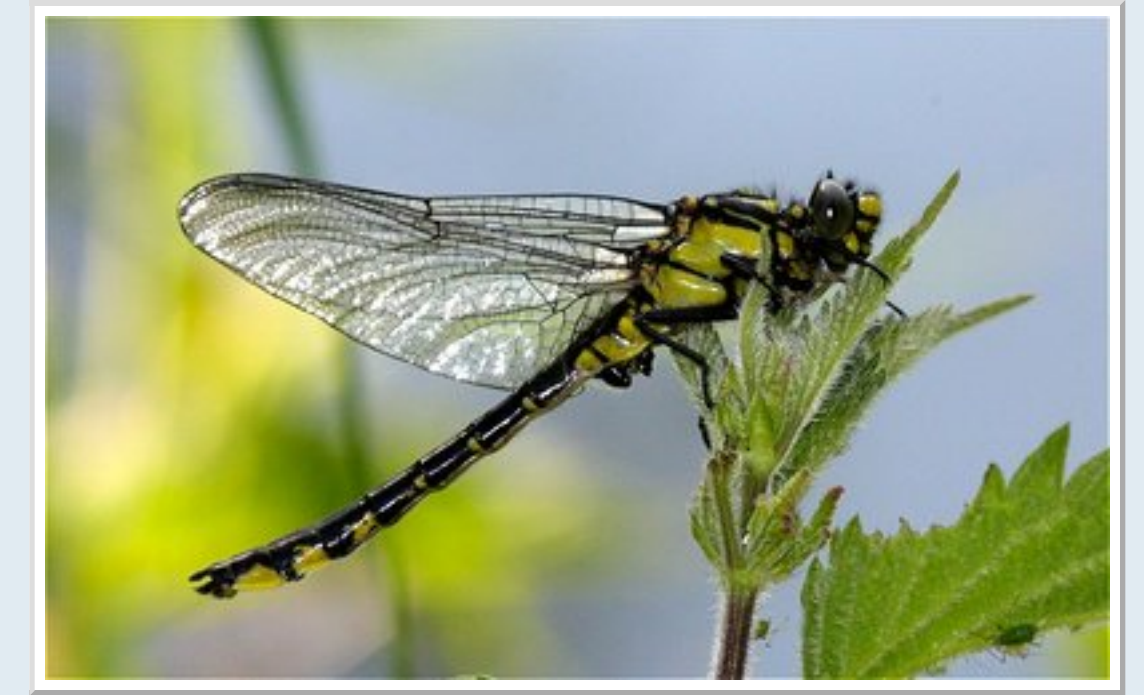
Second Club Tail

We visited the nearby Hartslock Nature Reserve famous for its Orchids.