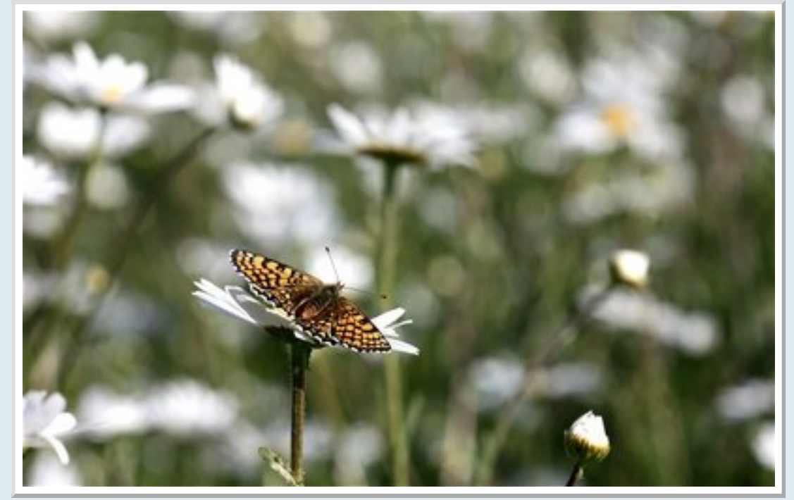
Female Glanville surveys the daisies