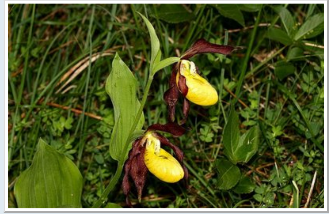
Lady's Slipper Orchid