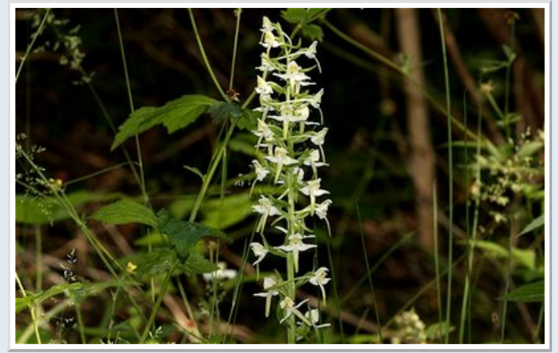
Greater Butterfly Orchid